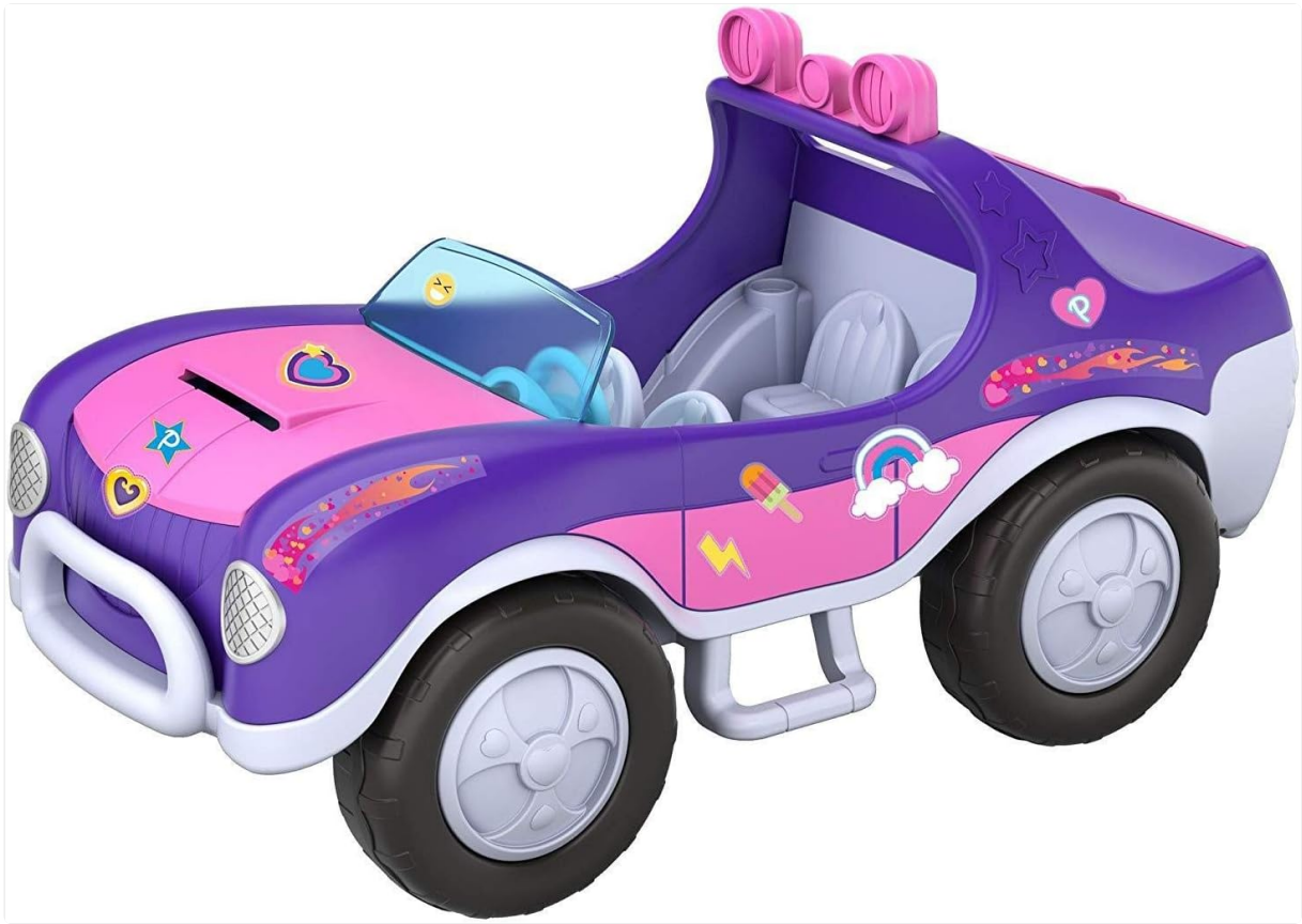
Image 1.1: The Polly Pocket Adventure S.U.V. with its vibrant pink and purple design.