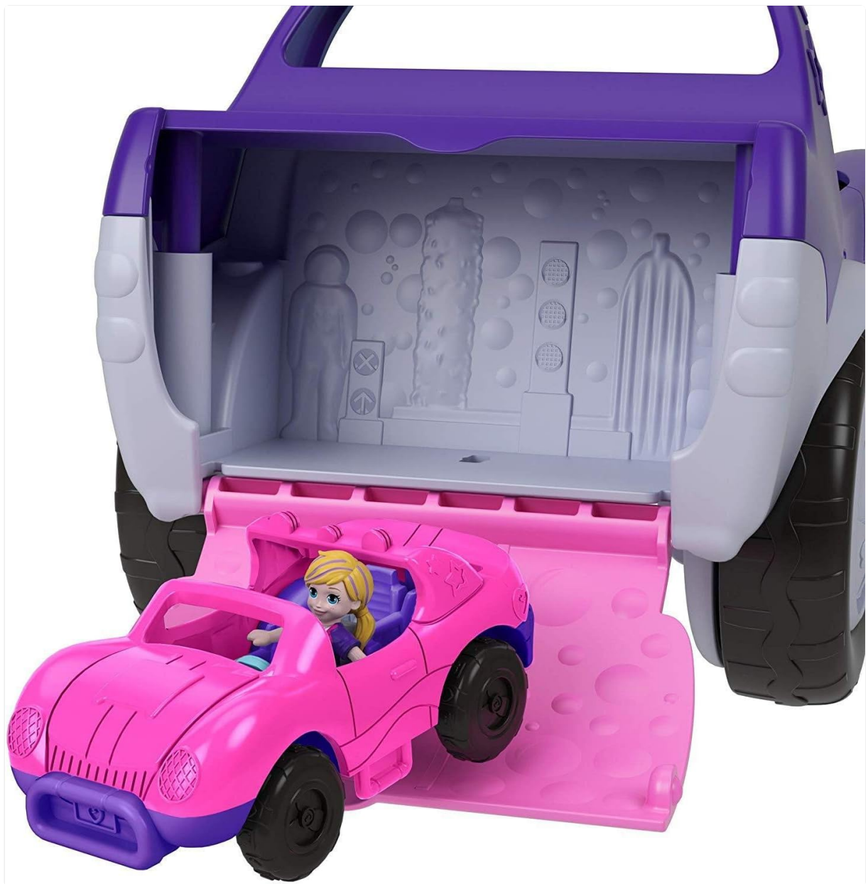
Image 3.1: The S.U.V.'s trunk opened to show the hidden car wash environment and the micro vehicle.