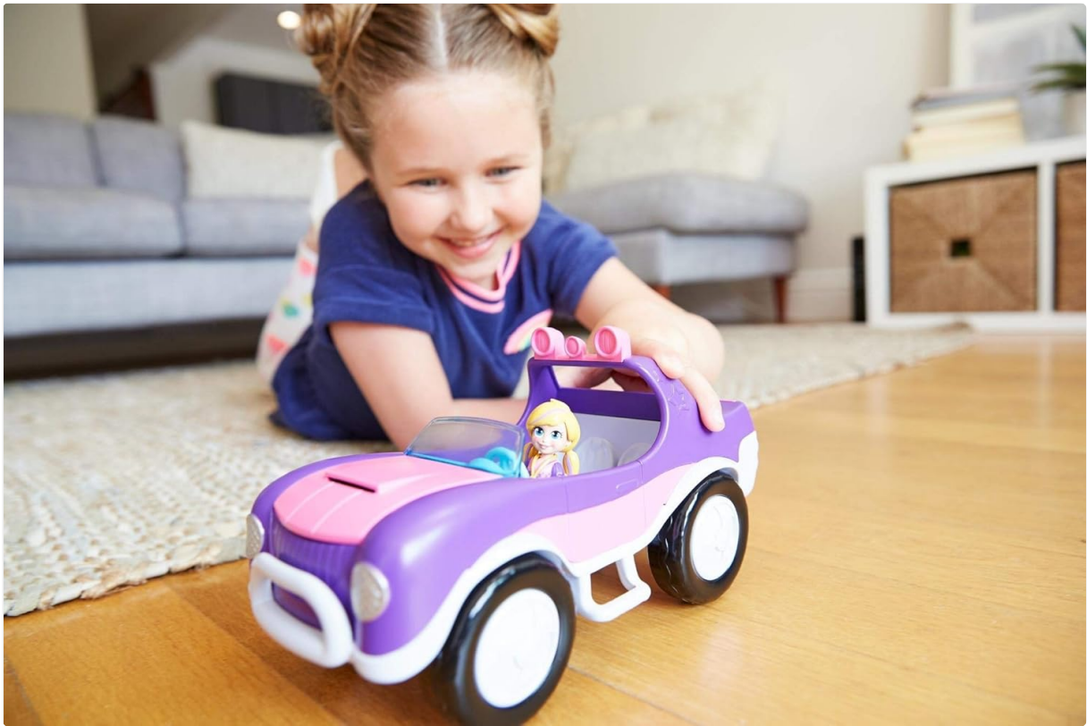
Image 2.1: A child engaging in play with the Polly Pocket S.U.V. and doll.