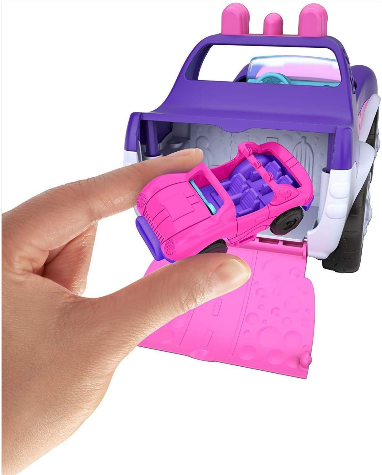
Image 3.2: Demonstrating how the micro vehicle is stored in the S.U.V.'s trunk.