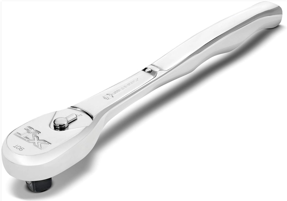
Image 4.1: The Powerbuilt XT90 1/2-inch Drive Ratchet, ready for socket attachment.

fully seated to prevent it from detaching during use.