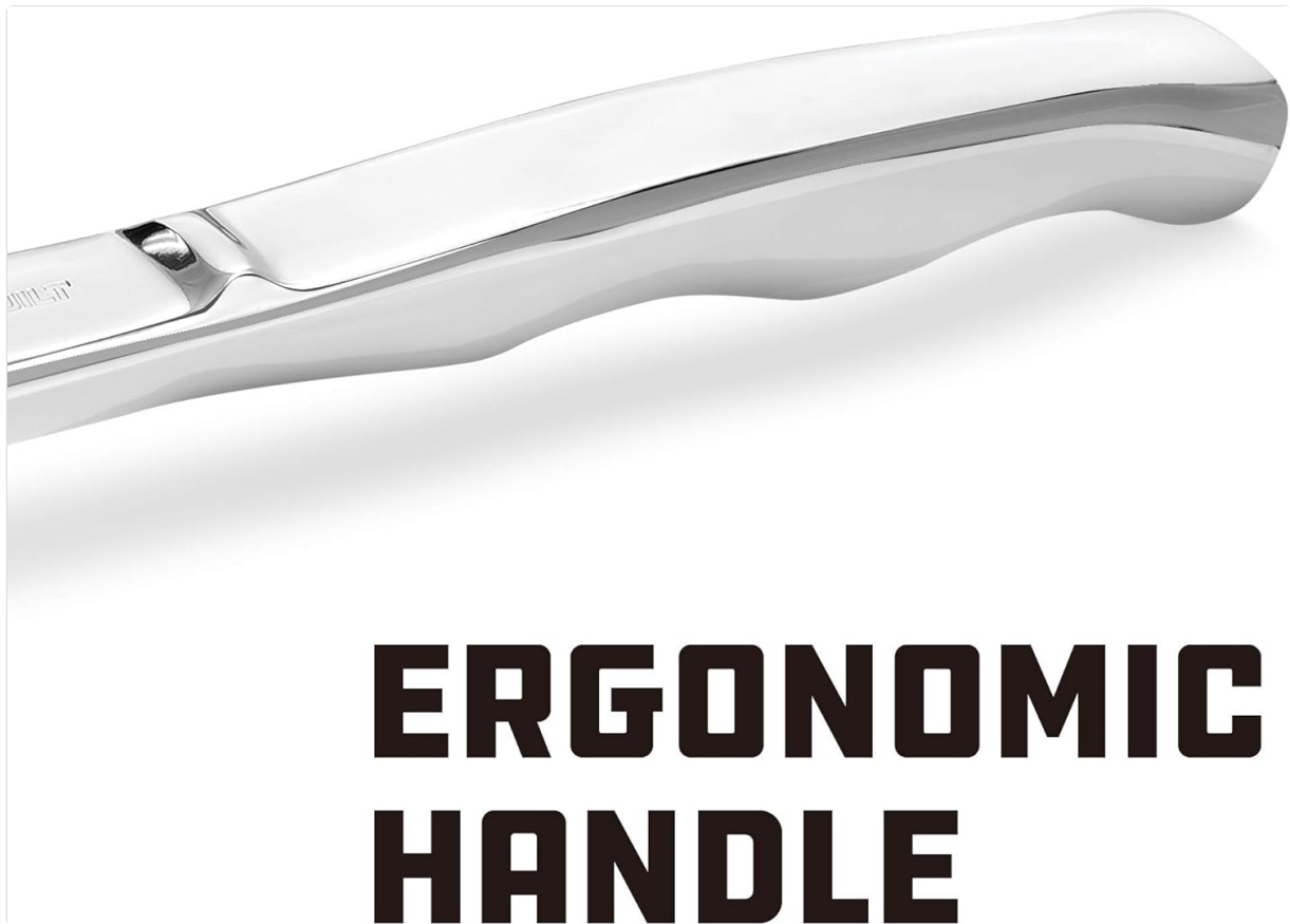
Image 5.2: The ergonomic handle design for comfortable and secure grip.