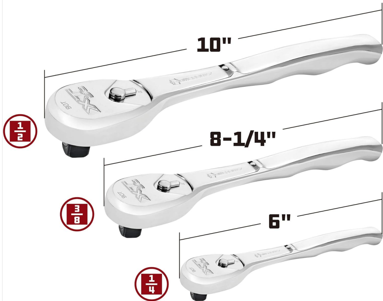
Image 8.1: The 1/2-inch drive ratchet (top) measures 10 inches in length.