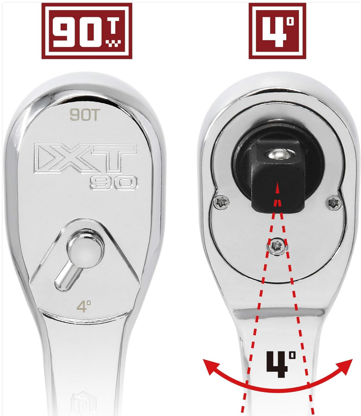
Image 5.1: The ratchet head, illustrating the directional switch and the minimal 4-degree swing required for engagement.