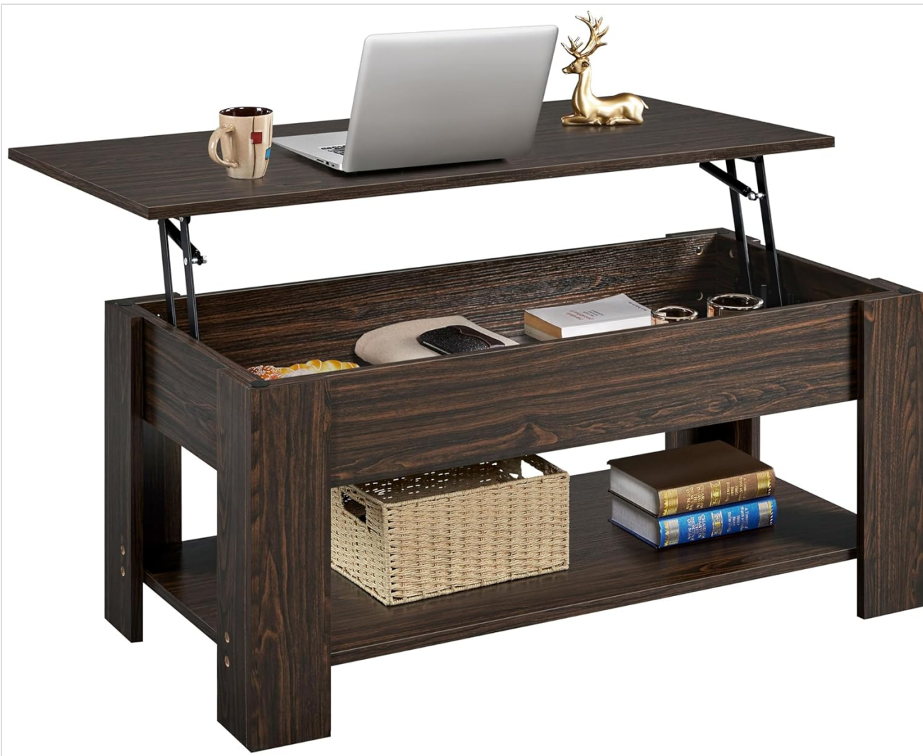
Image: The Yaheetech Lift Top Coffee Table in Espresso finish, with its top lifted to reveal a hidden storage compartment and a laptop placed on the elevated surface. A lower shelf provides additional open storage.