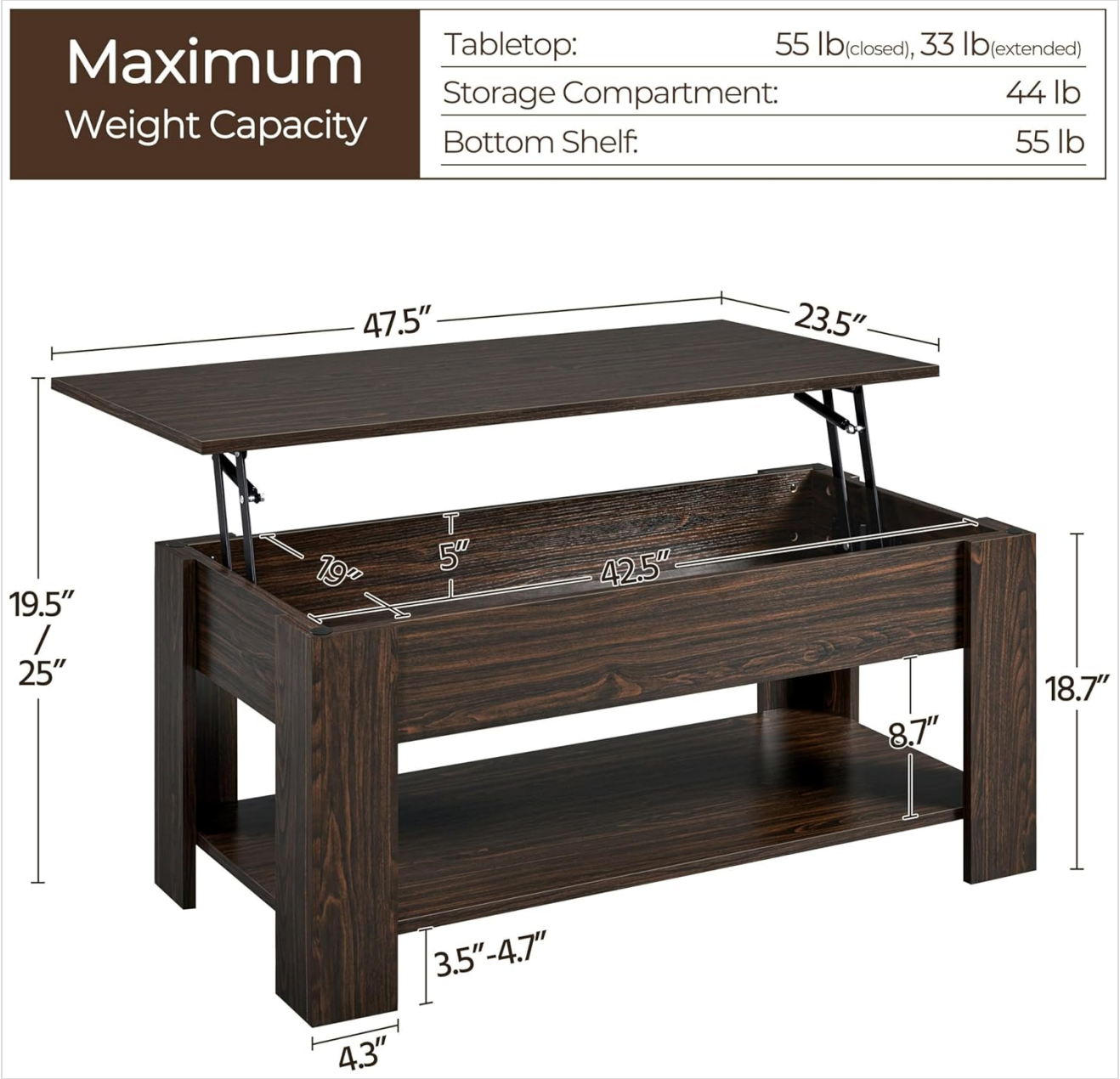
Image: A detailed diagram illustrating the dimensions of the coffee table in both closed and extended positions, along with the maximum weight capacities for the tabletop, hidden storage compartment, and bottom shelf.