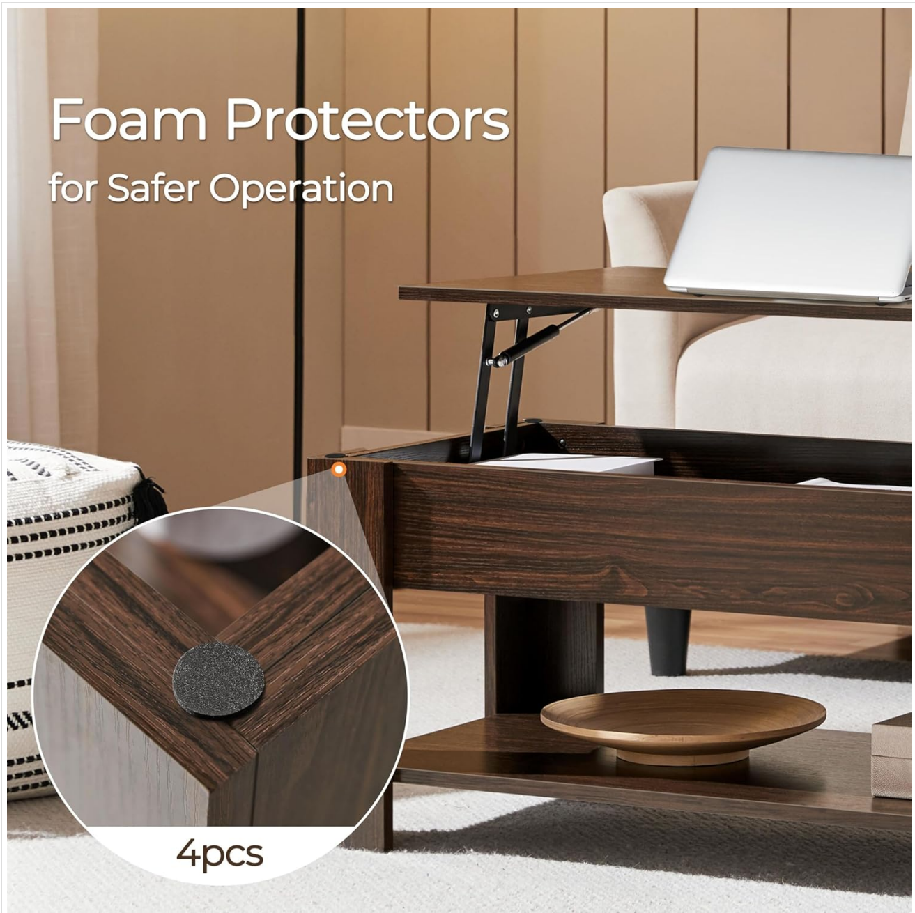
Image: A close-up view highlighting the inclusion of foam protectors (4 pieces) designed to ensure safer operation and prevent damage.