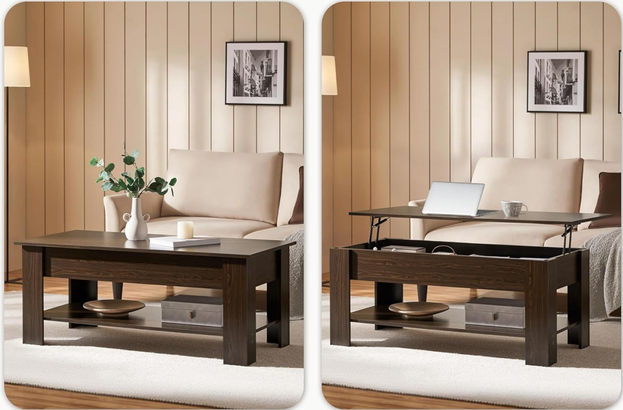
Image: A visual comparison demonstrating the coffee table in its standard, closed position on the left, and with its lift-top extended on the right, providing an elevated surface for activities like using a laptop.

Customize the tabletop to your desired height with ease