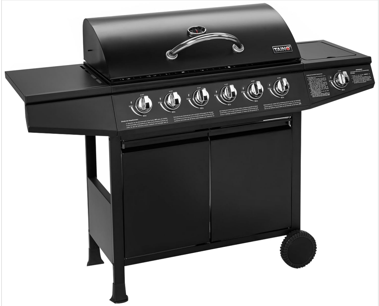
Image: Front view of the TAINO Basic 6+1 Gas Barbecue, showing the main unit with lid closed, control knobs, side shelves, and cabinet doors.