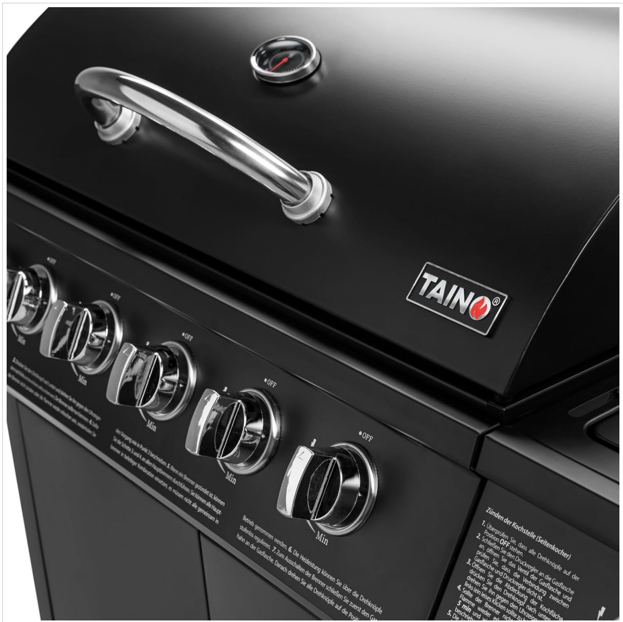
Image: Close-up of the control knobs on the TAINO Basic 6+1 Gas Barbecue, showing the individual burner controls and ignition markings.