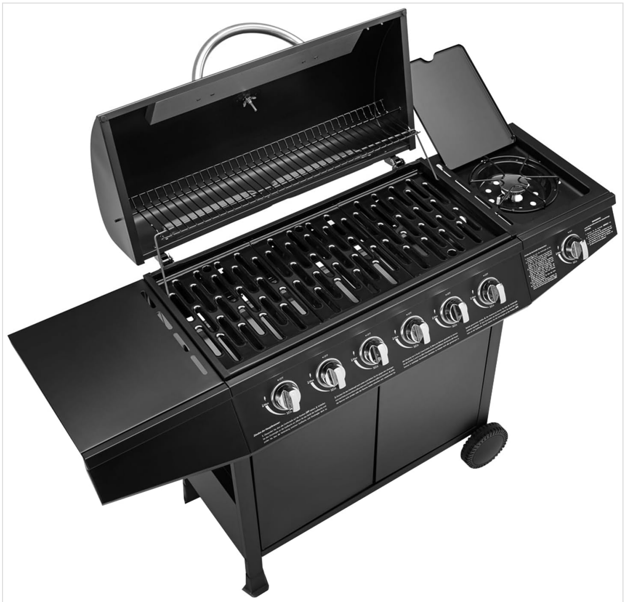
Image: Top-down view of the TAINO Basic 6+1 Gas Barbecue with the lid open, revealing the grill grates and the side burner on the right.