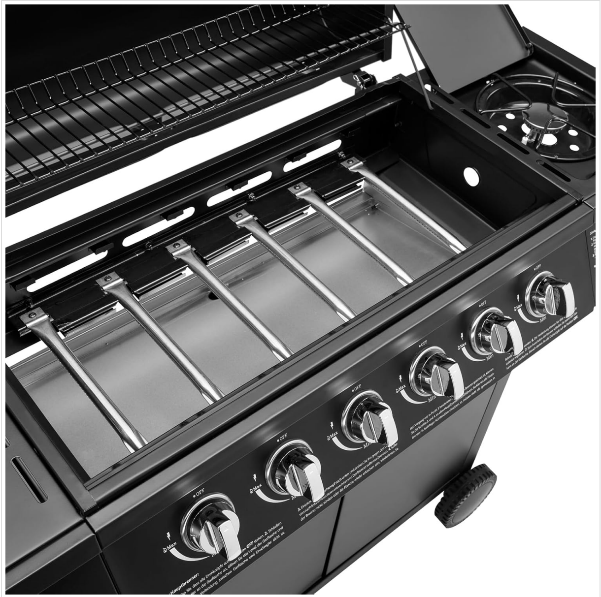
Image: Close-up view of the TAINO Basic 6+1 Gas Barbecue's interior, showing the six stainless steel burners and the heat distribution plates above them.