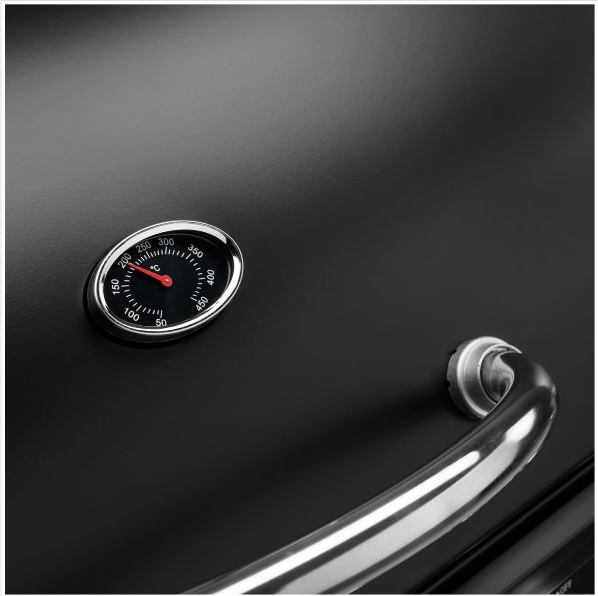
Image: Close-up of the integrated thermometer on the lid of the TAINO Basic 6+1 Gas Barbecue, indicating temperature readings.