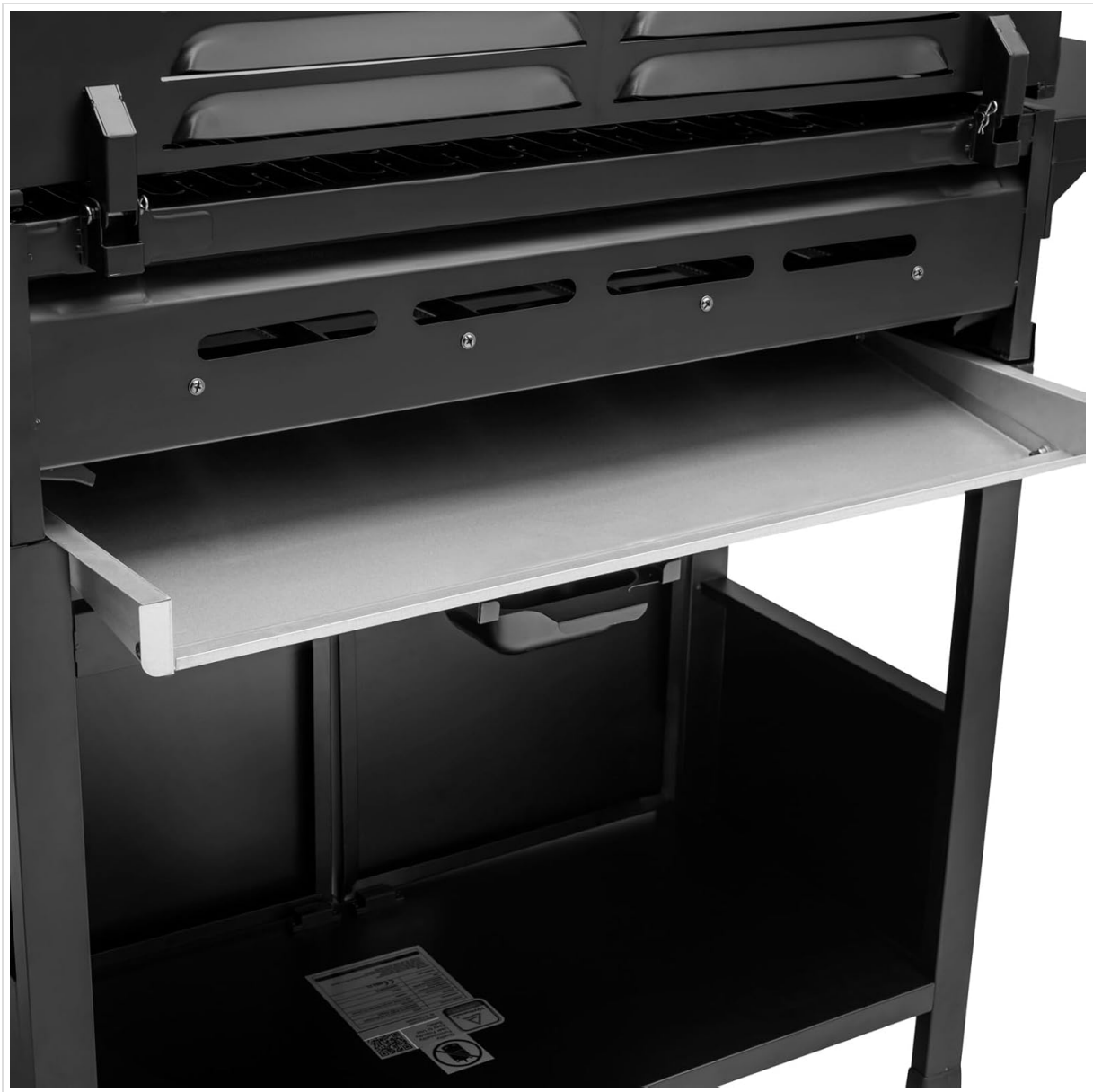
Image: View of the removable grease tray located beneath the burners of the TAINO Basic 6+1 Gas Barbecue, designed for easy cleaning.