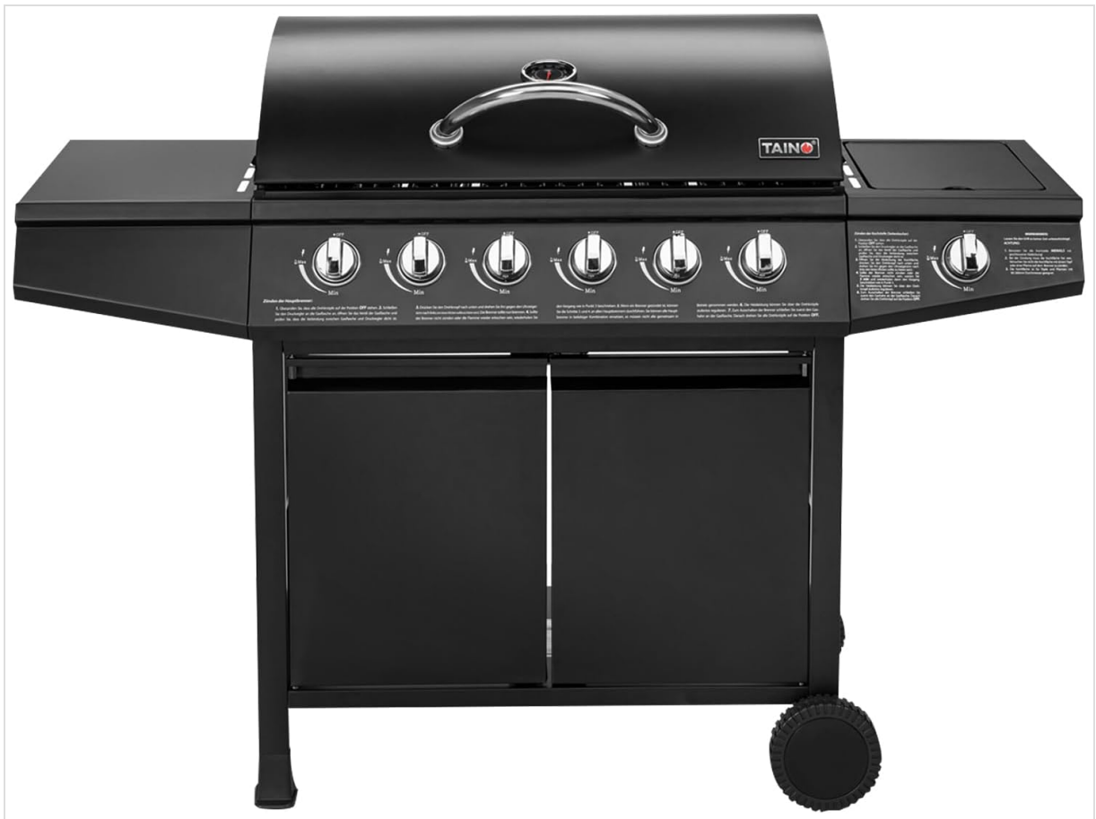
Image: Front view of the TAINO Basic 6+1 Gas Barbecue with the lid closed, showcasing the control panel and the overall compact design.