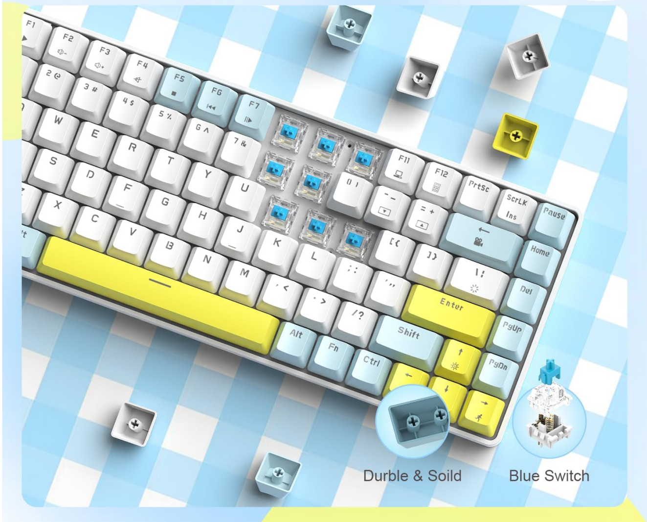
Image: A close-up view of the LexonElec RK-84 keyboard, highlighting the blue mechanical switches and their durable construction.