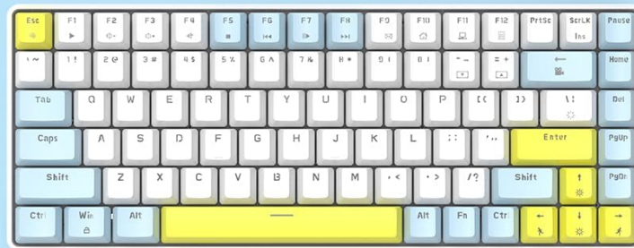
Image: The LexonElec RK-84 keyboard connected to a laptop, illustrating its wide compatibility with various operating systems via USB-C.