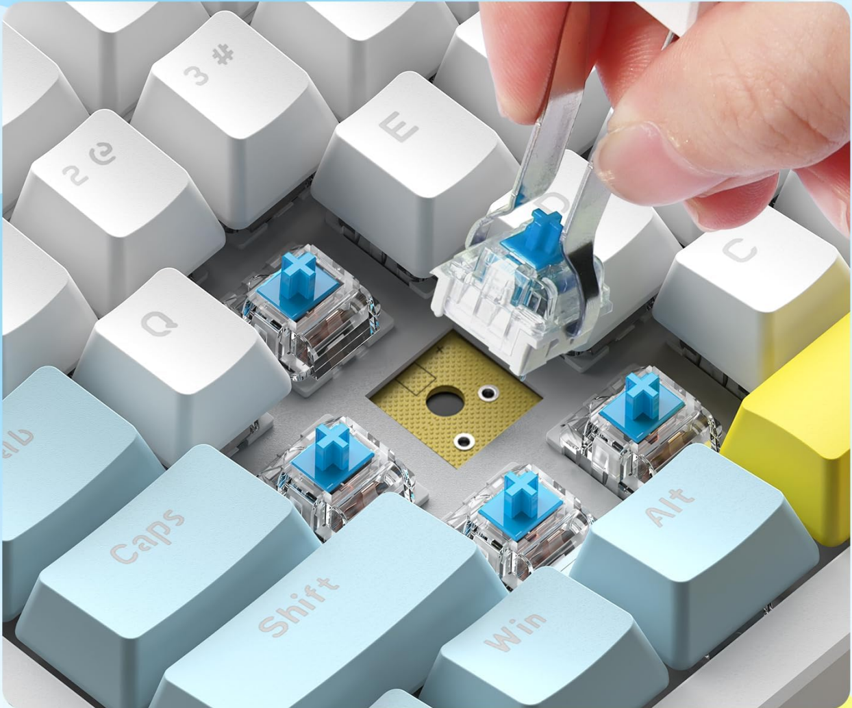
Image: A hand demonstrating the use of a keycap puller on the LexonElec RK-84 keyboard, highlighting its 3-pin hot-swappable switch sockets.