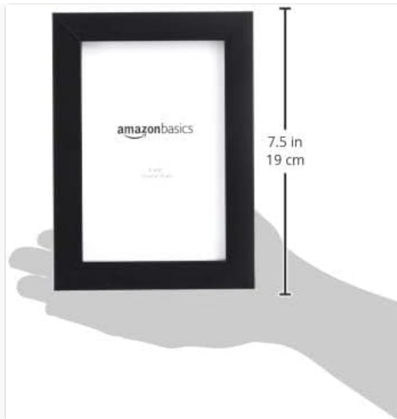
Figure 8.1: Frame dimensions illustration.