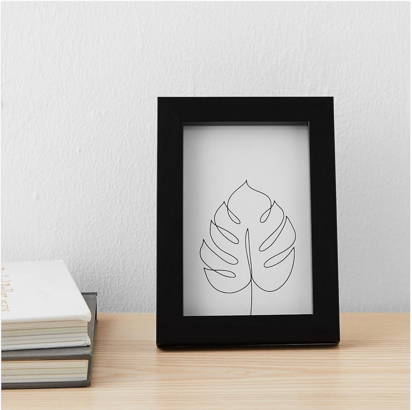
Figure 5.2: Frame displayed on a tabletop.