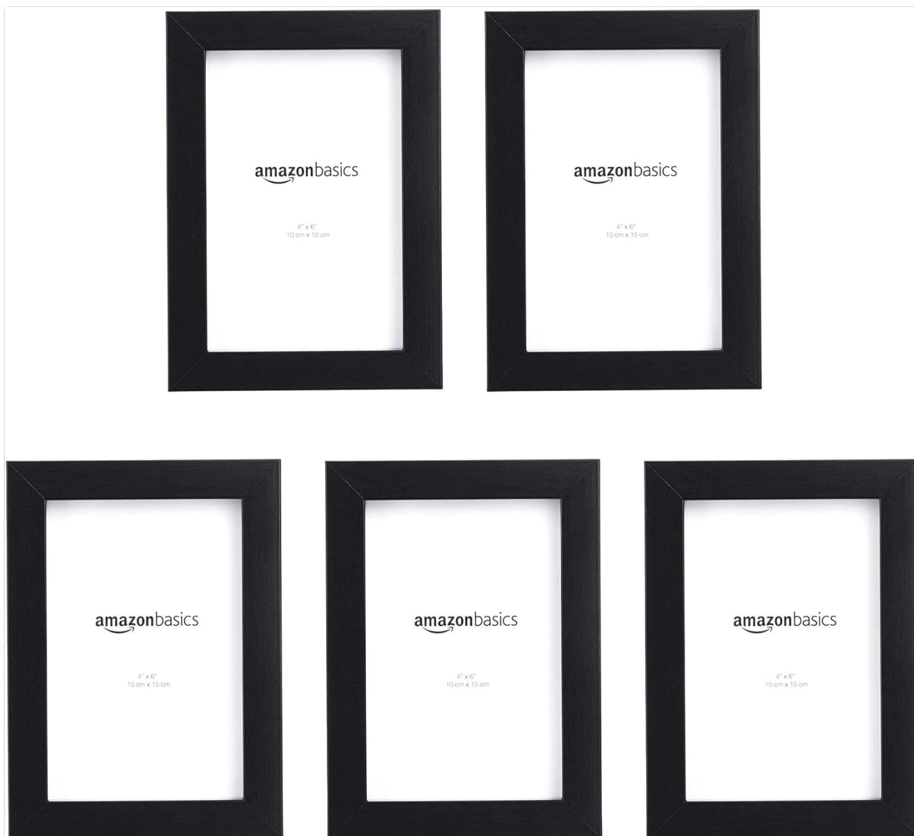
Figure 1.1: Overview of the Amazon Basics Rectangular Photo Picture Frame (Pack of 5).