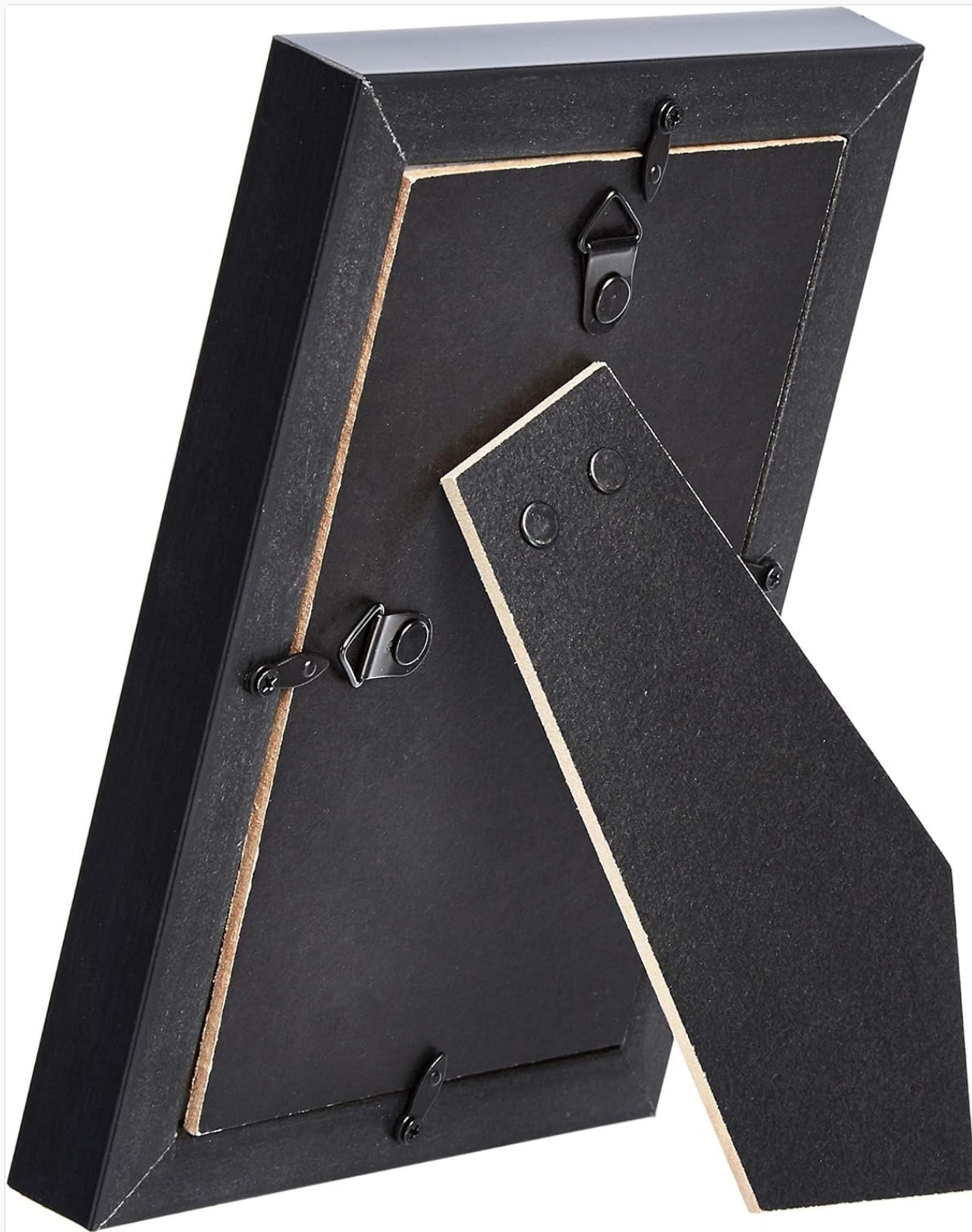
Figure 4.1: Back of the frame with easel and retaining clips.