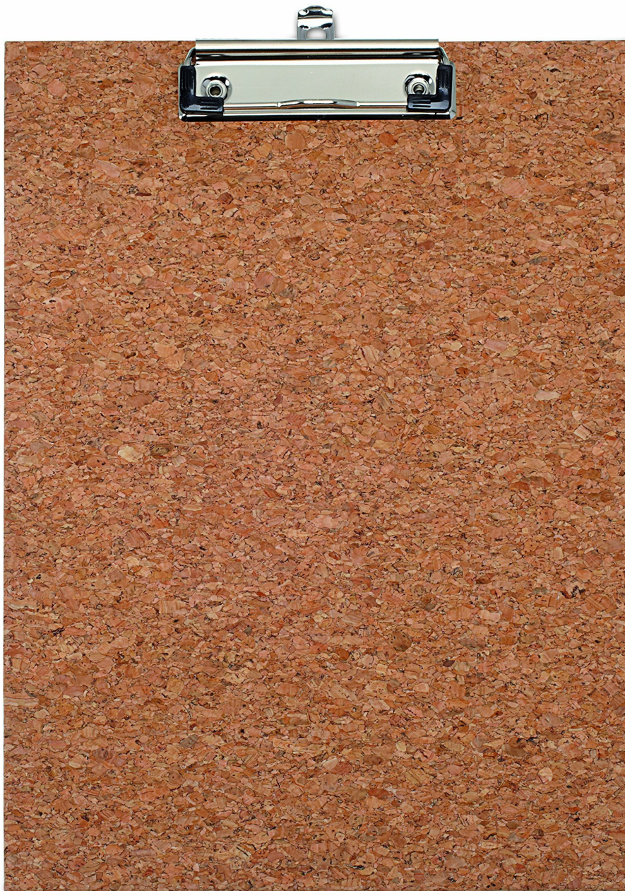
Image 3.3: Top section of the clipboard, highlighting the two metal hanging holes.