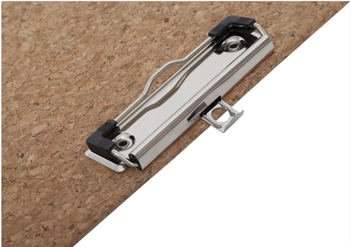
Image 3.1: Detailed view of the flat clip mechanism with protective plastic corners and dimple handle.