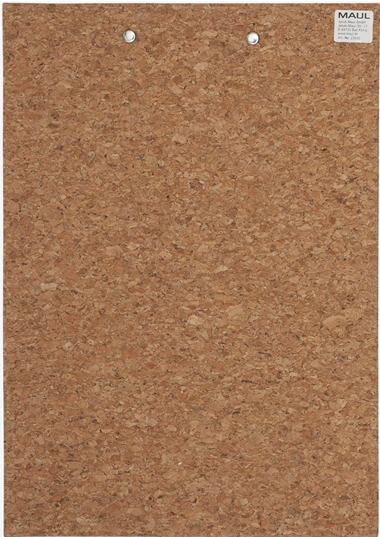
Image 1.1: Front view of the MAUL Maulcork Clipboard, showing its natural cork surface and metal clip at the top.