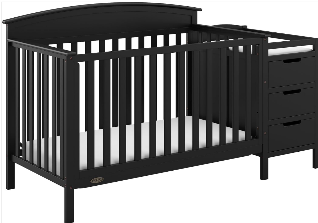
Image: The Graco Benton 4-in-1 Convertible Crib and Changer in black, showcasing its crib and attached changing table configuration.

This manual provides essential information for the safe and proper assembly, use, and maintenance of your Graco Benton 4-in-1 Convertible Crib and Changer. Please read all instructions carefully before assembly and retain this manual for future reference. This product is designed to adapt to your child's growth, converting from a crib to a toddler bed, daybed, and full-size bed with headboard.