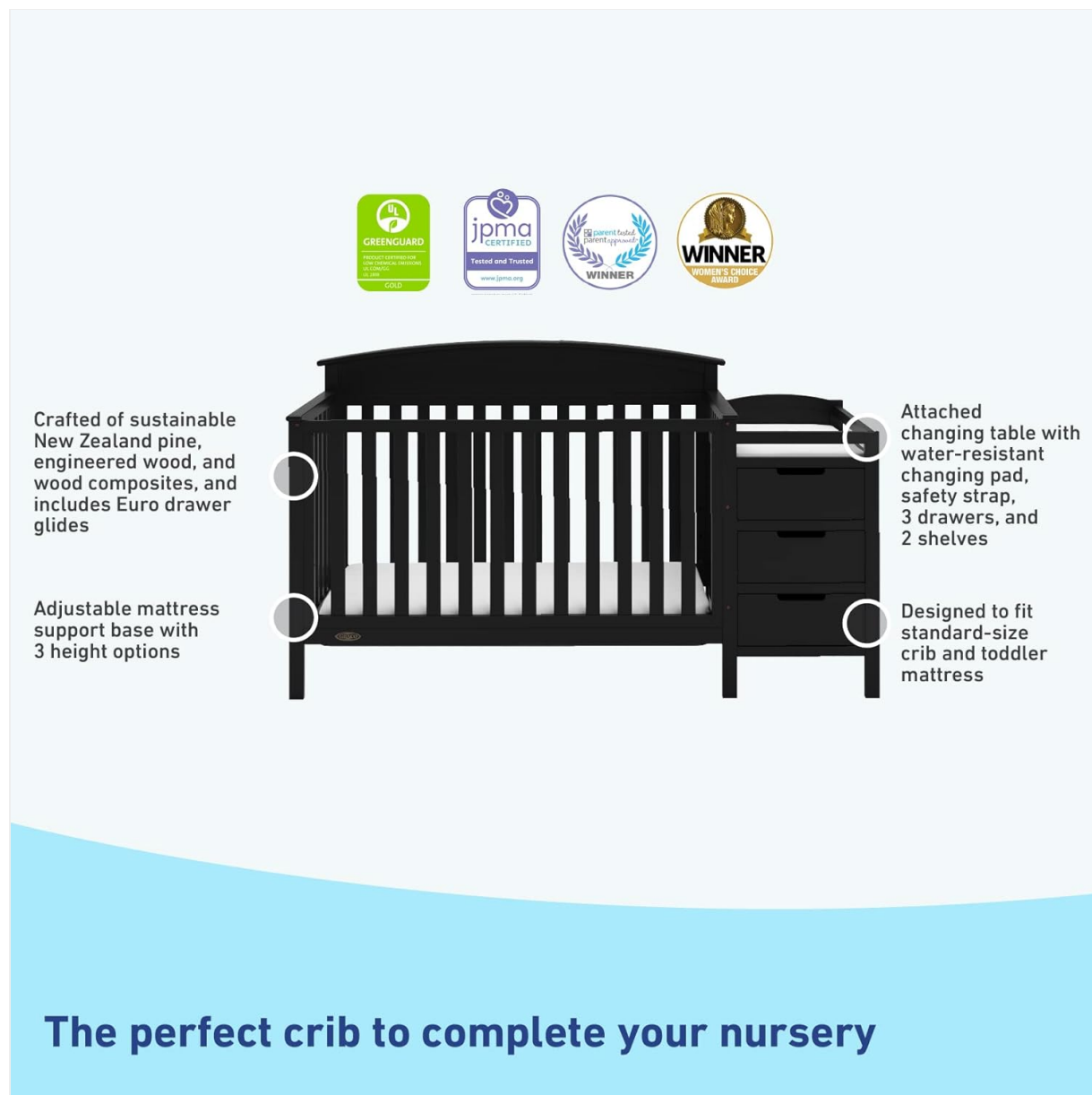
Image: A diagram illustrating the key features of the crib and changer, including the adjustable mattress support, attached changing table, drawers, and shelves.