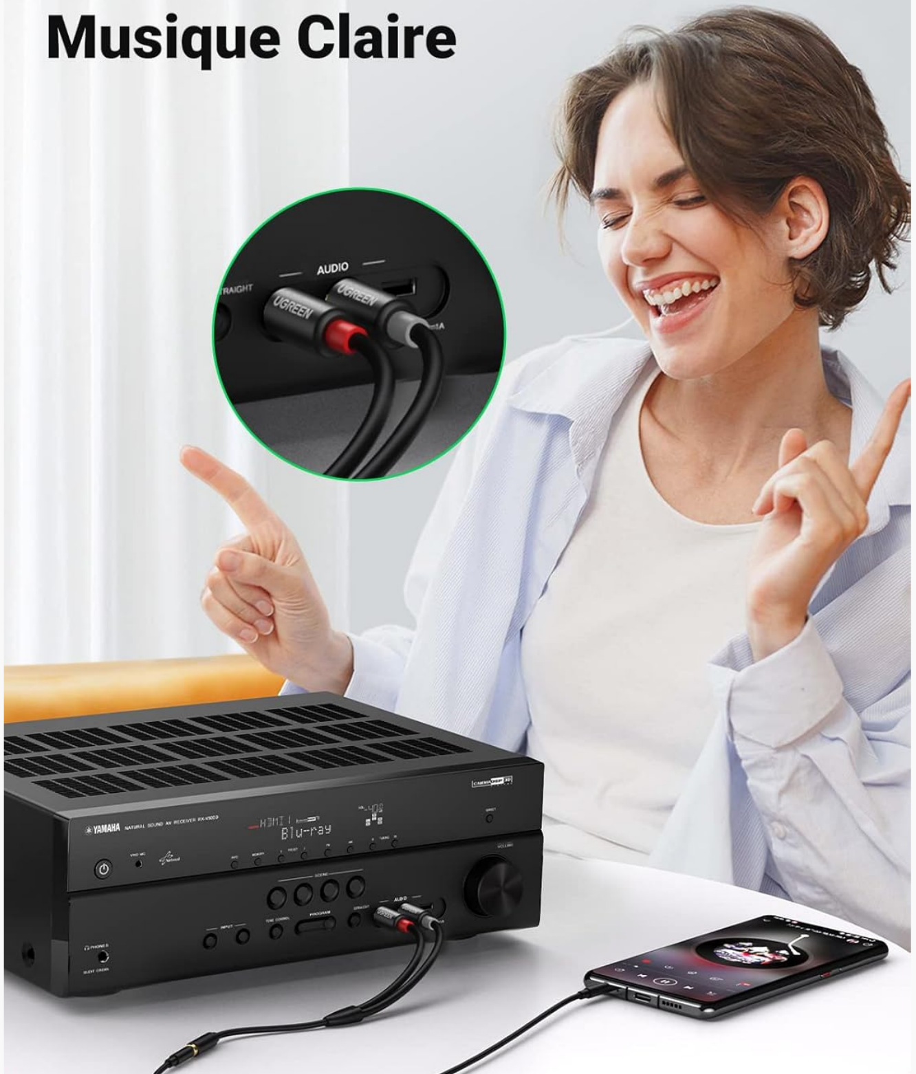
Image 7: User enjoying clear music after connecting a smartphone to an amplifier using the UGREEN adapter.