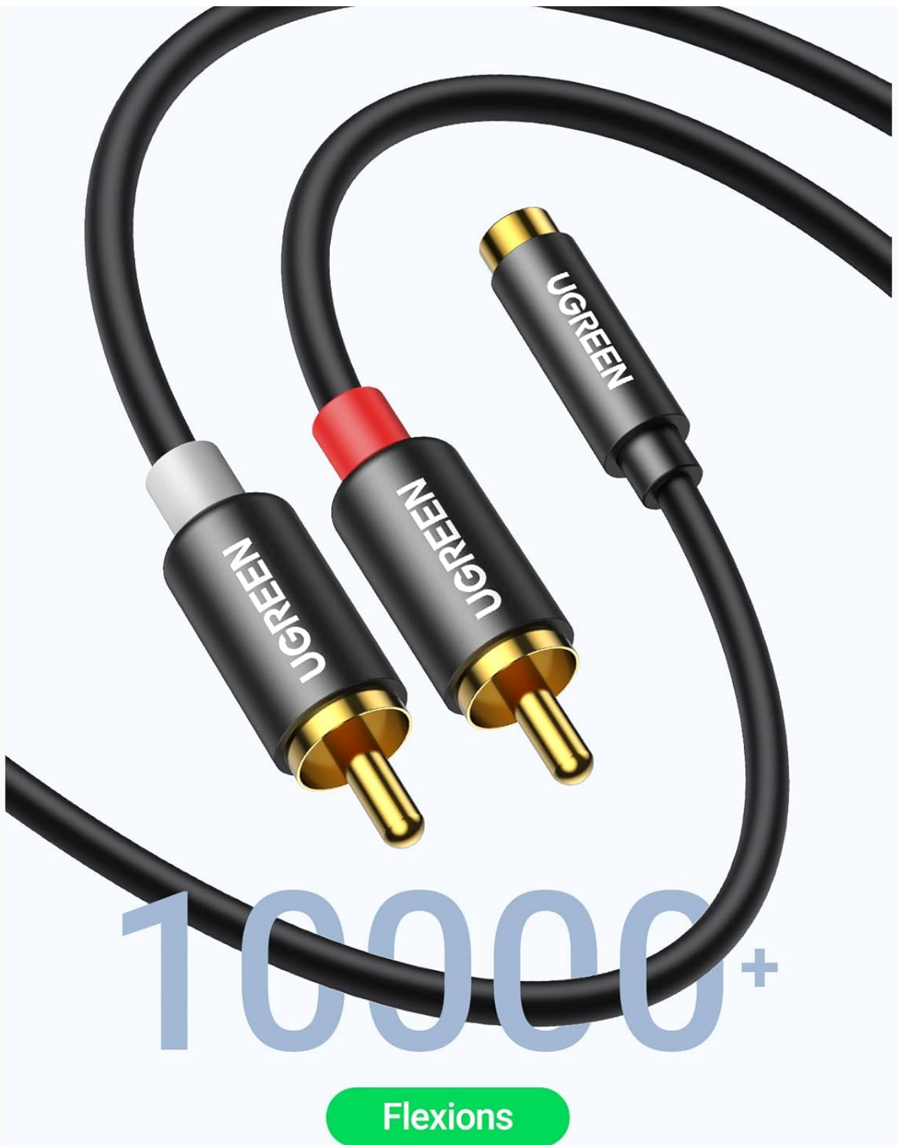
Image 4: The cable's flexibility and resilience, indicating it can withstand over 10,000 bends.