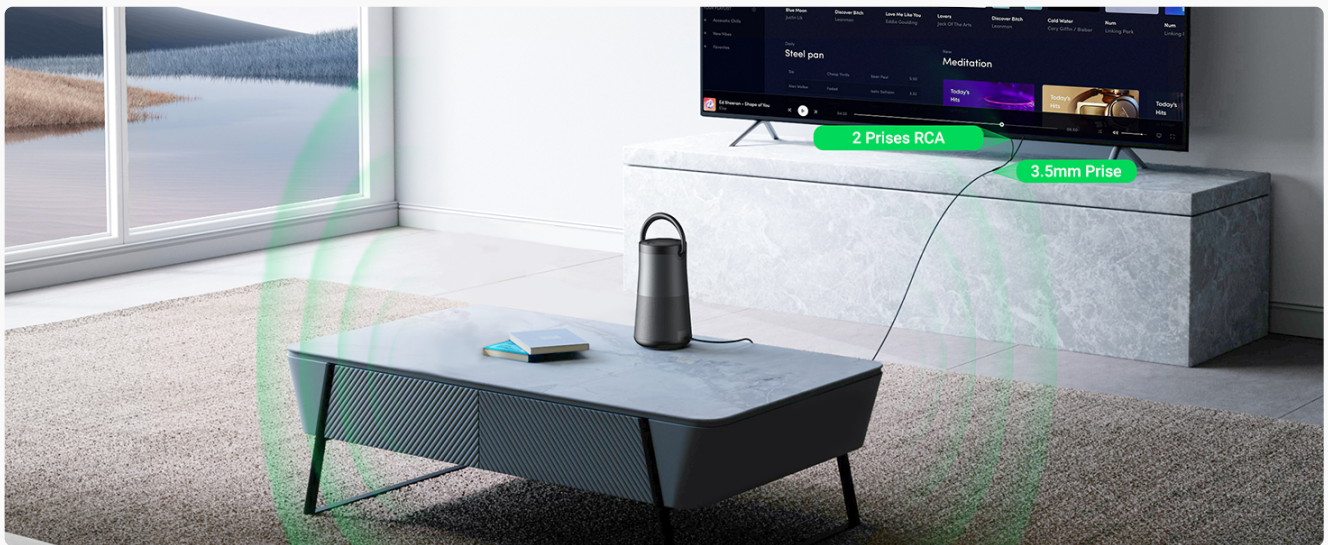
Image 6: Example setup showing a 3.5mm device connected via the adapter to a TV and a speaker.