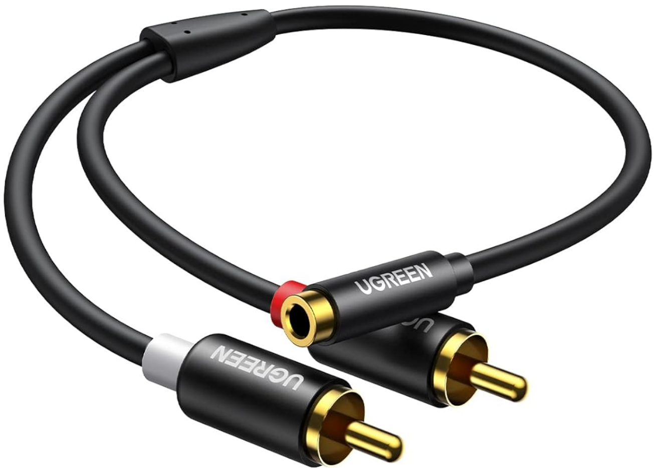
Image 1: UGREEN RCA Jack 3.5mm Female to 2 RCA Male Stereo Audio Adapter.