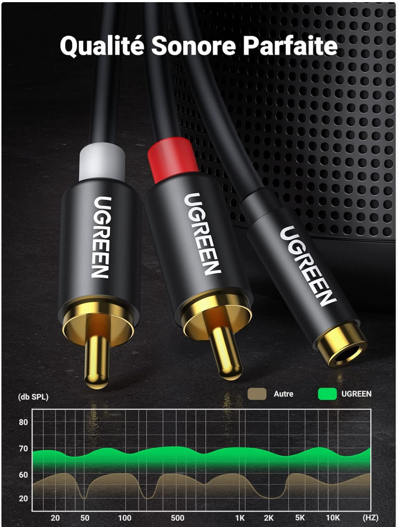
Image 2: Visual representation of superior sound quality with UGREEN cables compared to others.