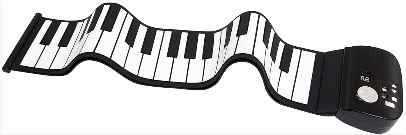
Figure 1: The Sharper Image 37-Key Digital Roll Up Electronic Keyboard fully unrolled, displaying its flexible design and integrated control panel.