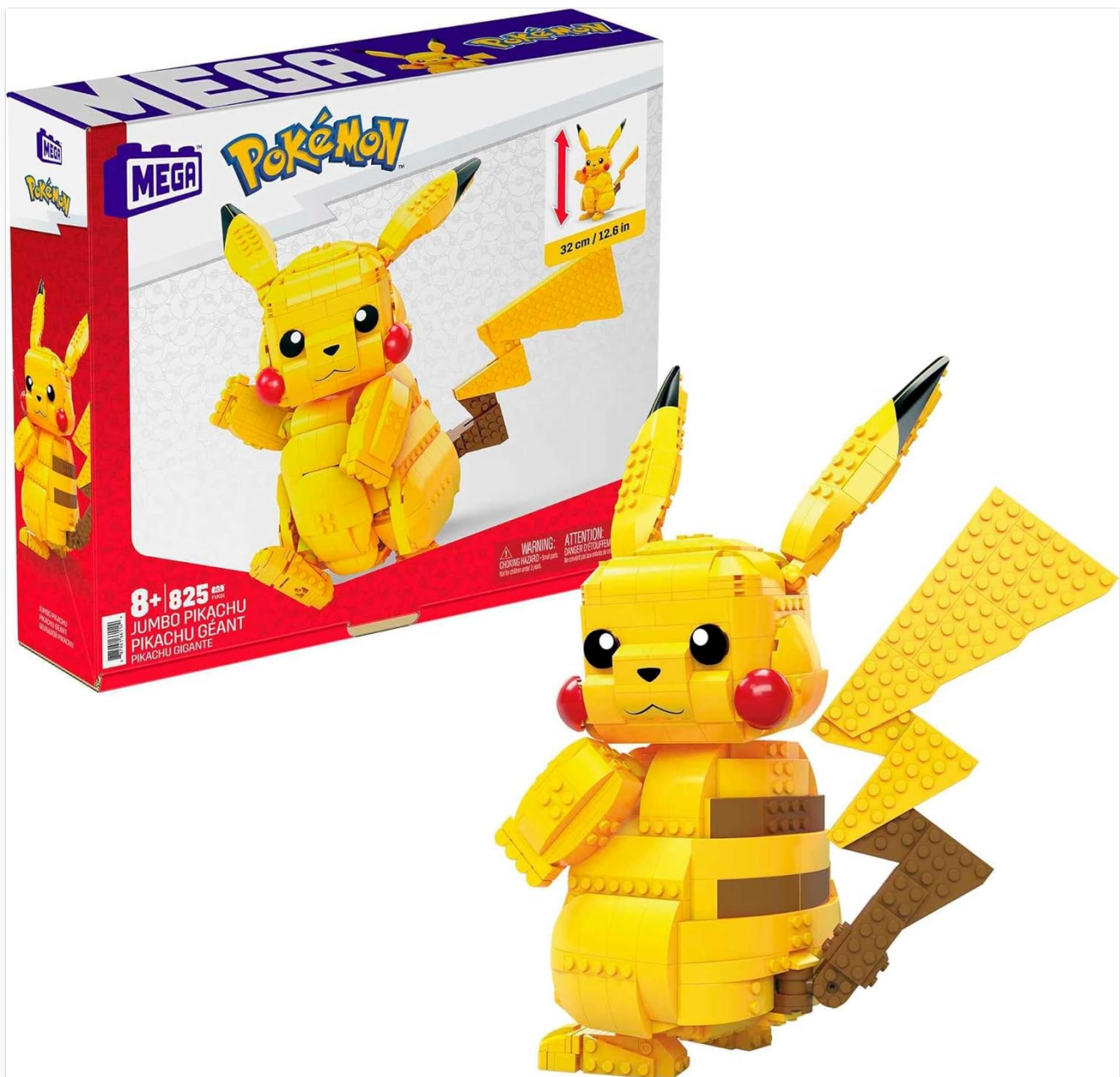
Image: The product packaging alongside the fully assembled Jumbo Pikachu figure, illustrating the contents of the set.