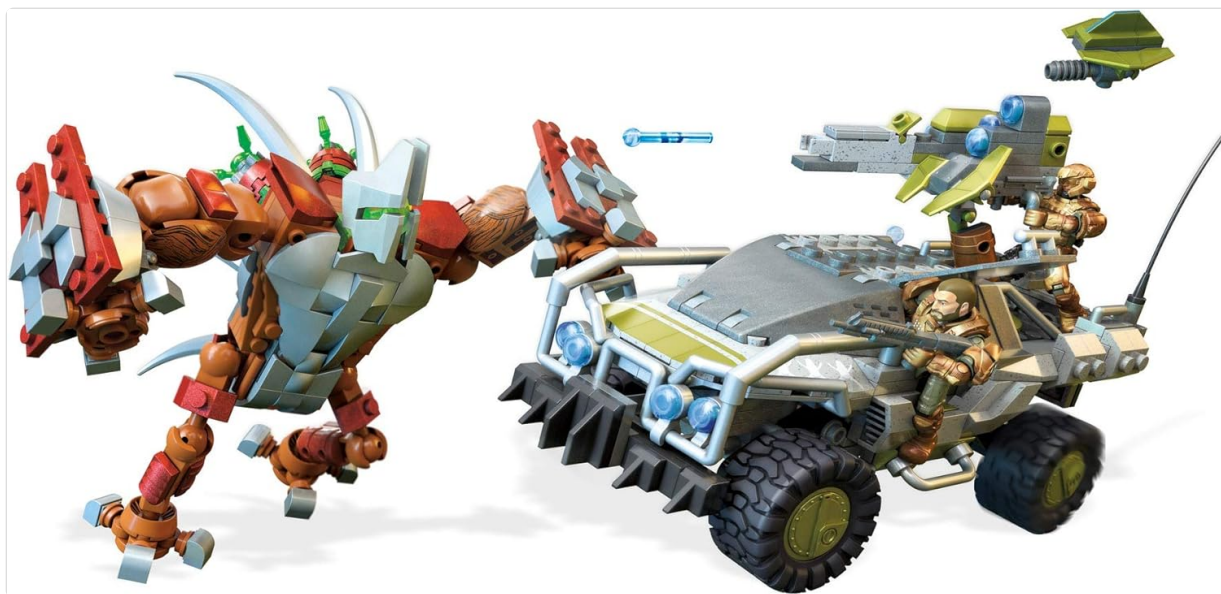
Image 1.1: The fully assembled Mega Construx Halo Forgehog vehicle and Banished Goliath figure.

The set includes 654 building pieces designed for ages 8 and up. Please read all instructions carefully before beginning assembly.