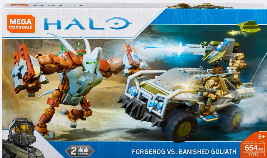
Image 3.1: The product box, indicating the contents and age recommendation.