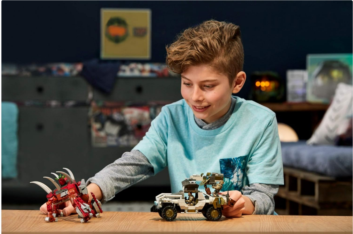
Image 4.1: A child engaging with the assembled Forgehog and Goliath figures, demonstrating playability.