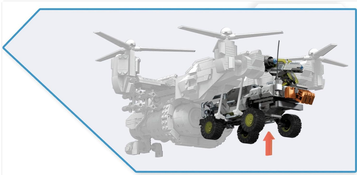
Image 3.3: The Forgehog vehicle, demonstrating its compatibility with other Mega Construx sets for transport or display.