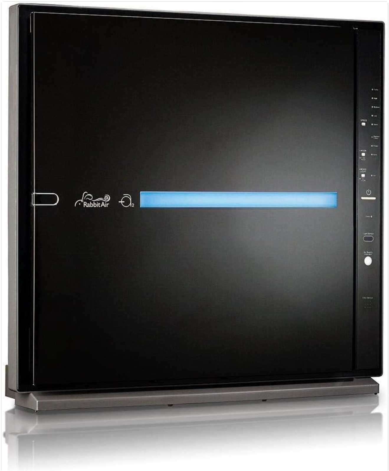
Figure 1: The Rabbit Air MinusA2 Air Purifier, showcasing its sleek black design and illuminated air quality indicator bar.