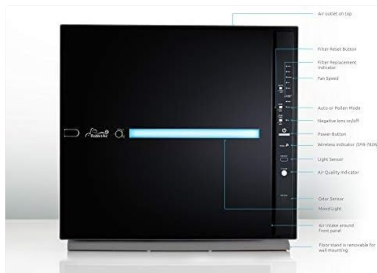
Figure 3: Control panel diagram illustrating the various buttons and indicators for operation.