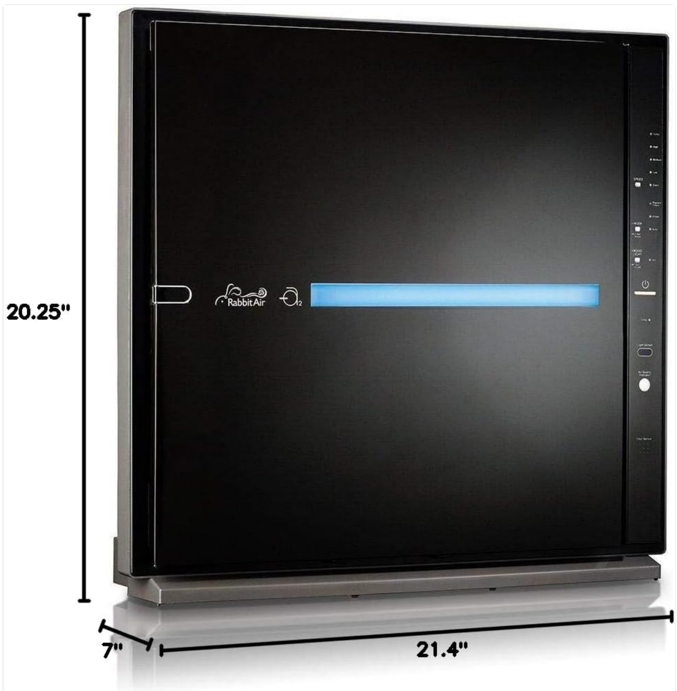
Figure 6: Dimensional overview of the MinusA2 air purifier.