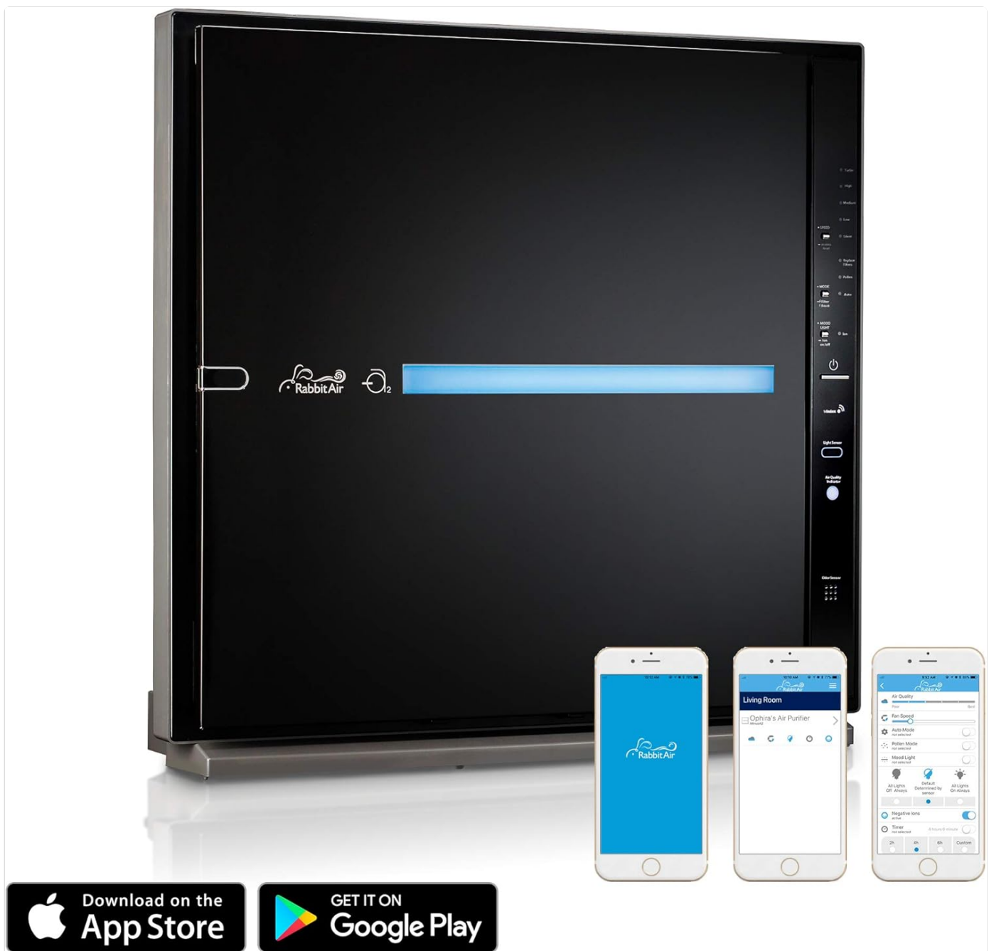
Figure 4: The Rabbit Air MinusA2 unit alongside mobile devices demonstrating the smart app control feature.