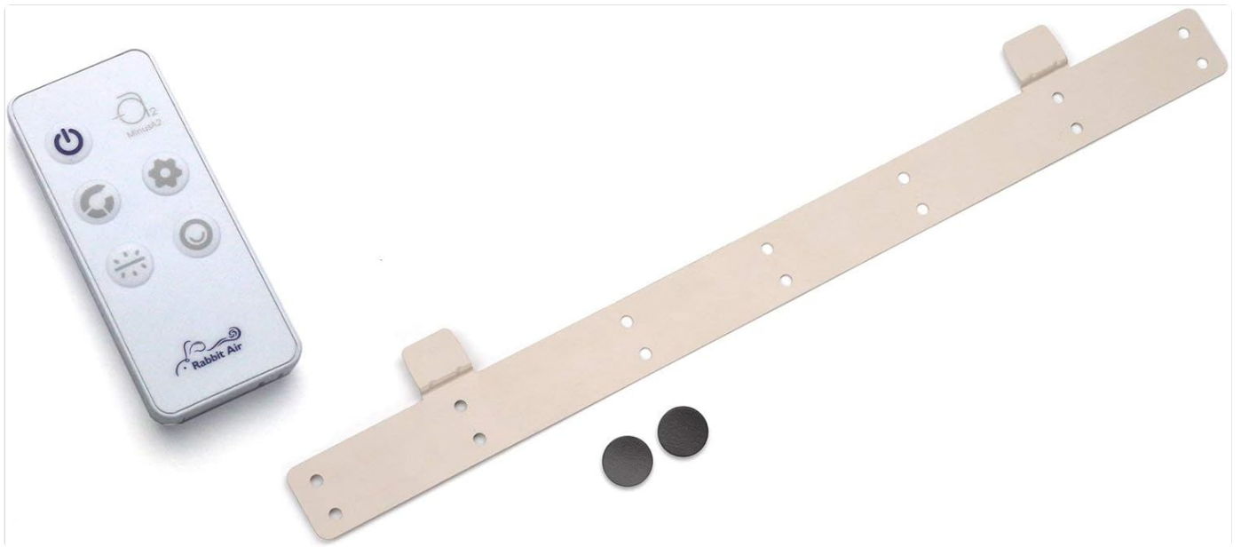
Figure 7: Included remote control and wall mount bracket for flexible placement.