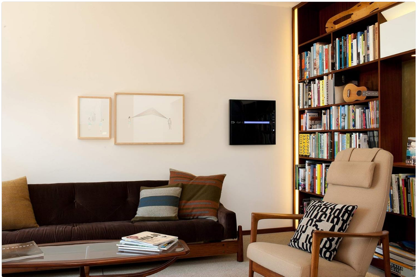
Figure 9: The MinusA2 air purifier wall-mounted, demonstrating its space-saving design.