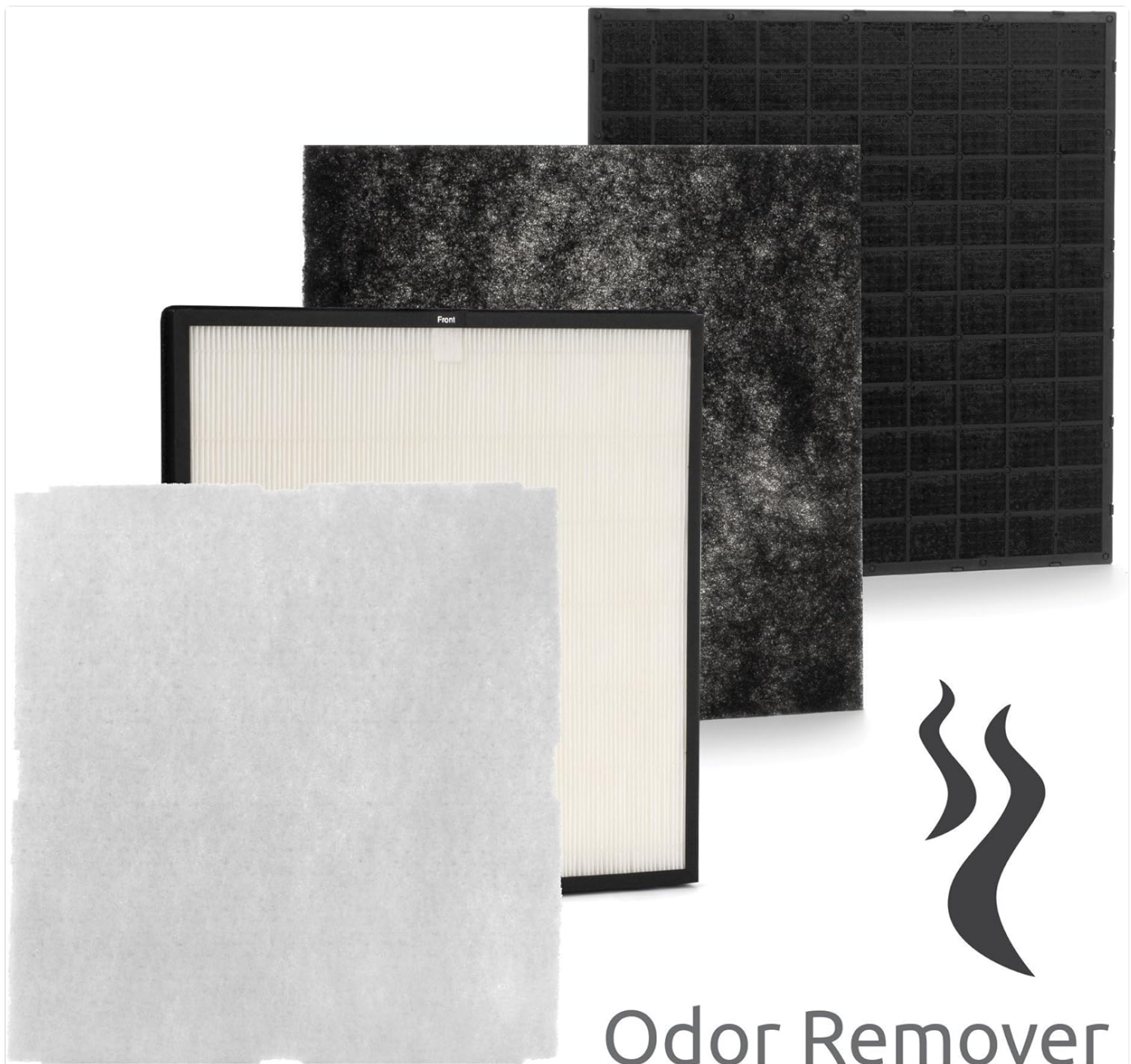
Figure 2: The multi-stage filter set for the MinusA2 air purifier, including the Odor Remover customized filter.