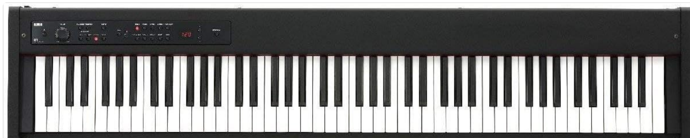
Close-up of the Korg D1 control panel, highlighting the power button, volume knob, and sound selection buttons.

Adjust the keyboard's touch response (light, normal, heavy) using the TOUCH button to match your playing style.