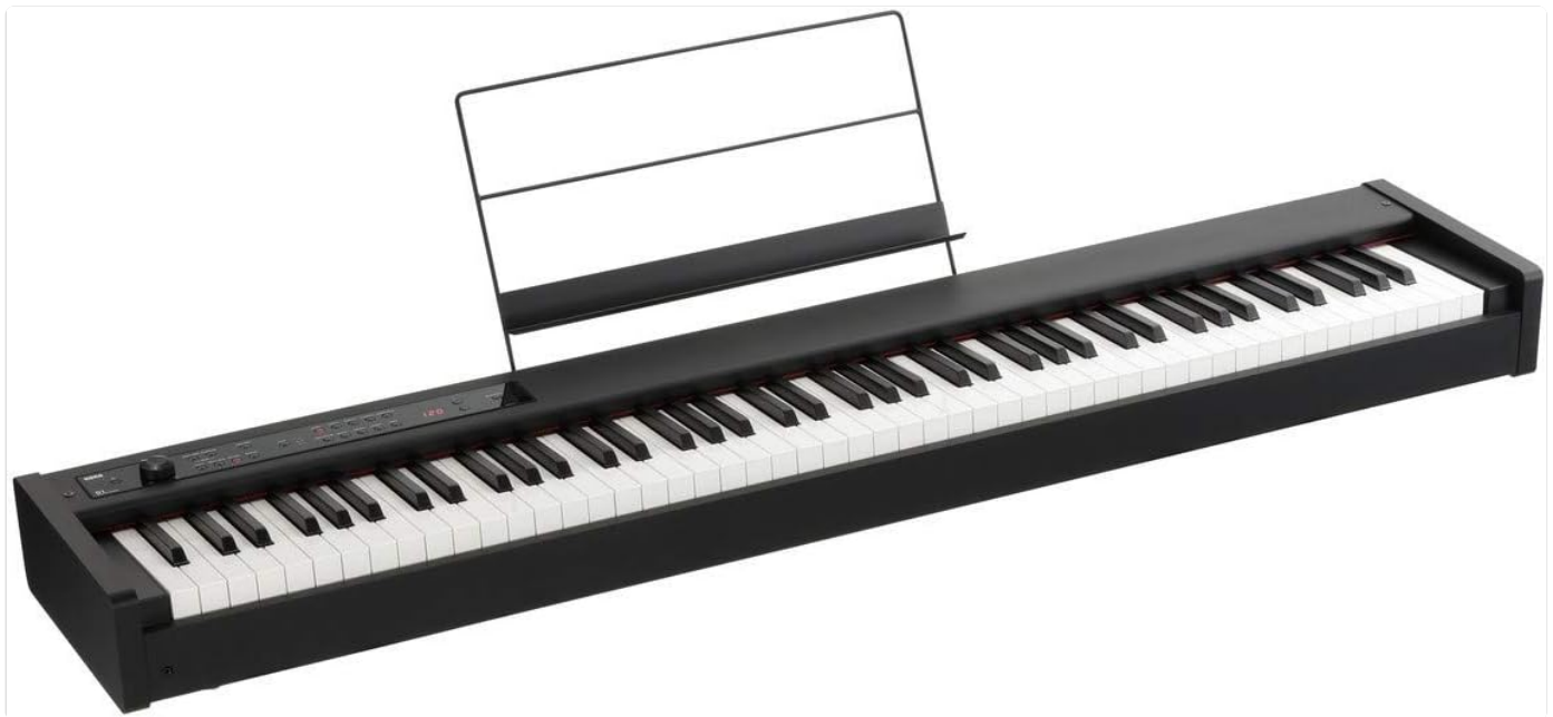
The Korg D1 88-Key Stage Piano Controller, shown with its included music rest, ready for setup.

The Korg D1 is an 88-key digital piano controller designed for musicians who require a realistic playing experience in a compact, portable form. It features Korg's acclaimed RH3 (Real Weighted Hammer Action 3) keyboard, providing an authentic grand piano touch. With a diverse range of high-quality sounds and essential onboard effects, the D1 is suitable for both stage performances and home practice. Its slim design allows for easy setup in various environments and convenient storage.