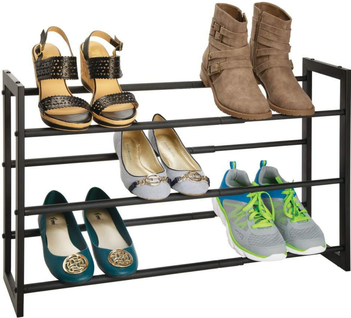
Image: The mDesign 3 Tier Adjustable/Expandable Shoe and Boot Storage Organizer Rack, shown fully assembled and holding various types of footwear.