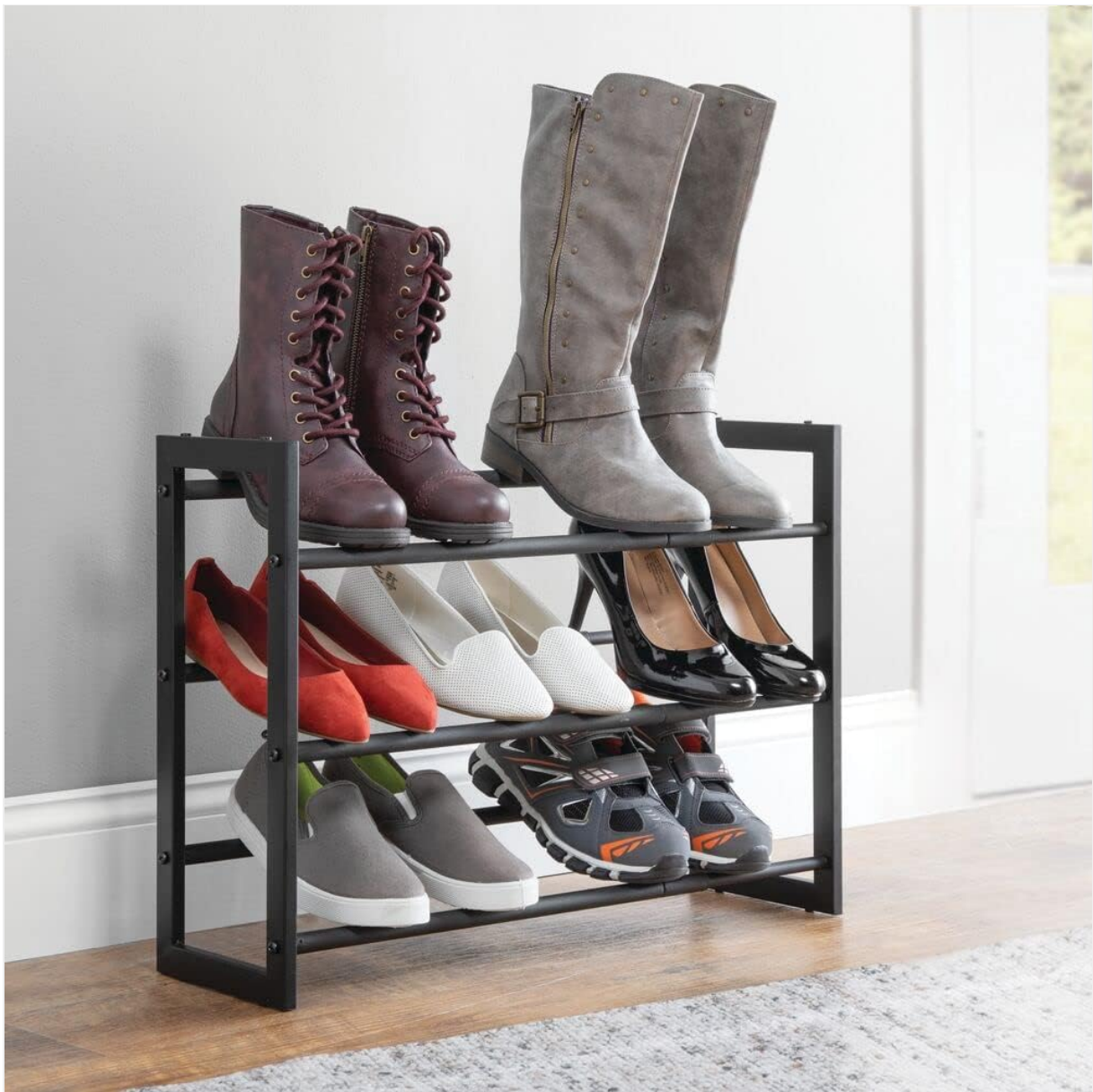
Image: The shoe rack effectively storing multiple pairs of boots on its tiers.