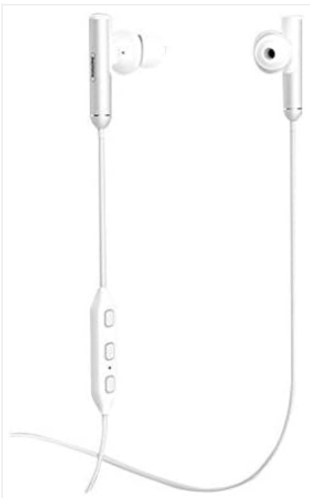
Image: Front view of the white Remax RB-S9 wireless earphones, showing the earbuds and inline control panel.

Familiarize yourself with the components of your Remax RB-S9 earphones.