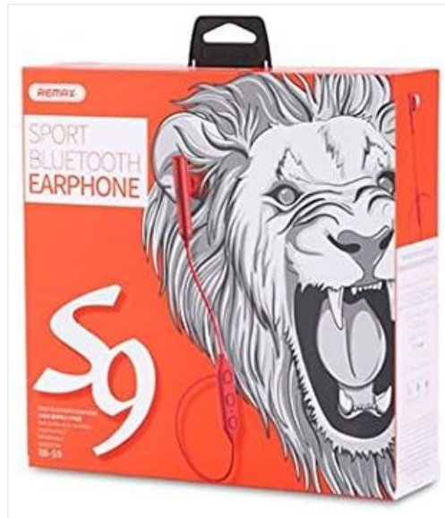
Image: The retail packaging for the Remax Sport Bluetooth Earphone S9, showing the product name and a lion graphic.