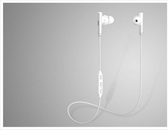
Image: The white Remax RB-S9 earphones displayed on a neutral grey background, highlighting their design.