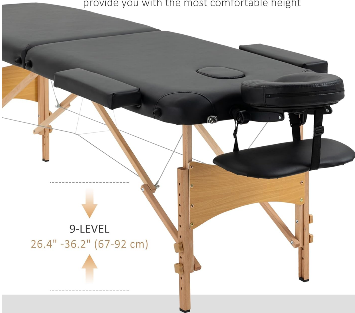
Image: Detail of the massage table leg, illustrating the 9-level height adjustment feature from 26.4" to 36.2" (67-92 cm).

9 changeable height levels from 26.4" -36.2" (67-92 cm) to provide you with the most comfortable height