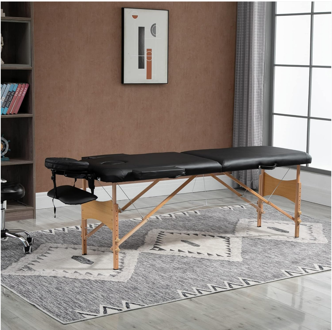
Image: The HOMCOM Portable Folding Massage Table set up in a room, showcasing its full form and accessories.