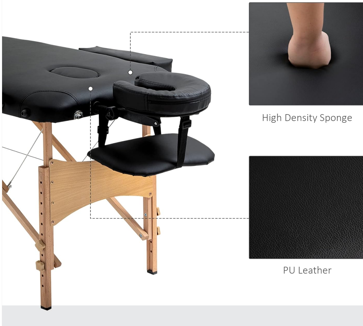
Image: A detailed view illustrating the high-density sponge padding and durable PU leather covering for enhanced comfort.