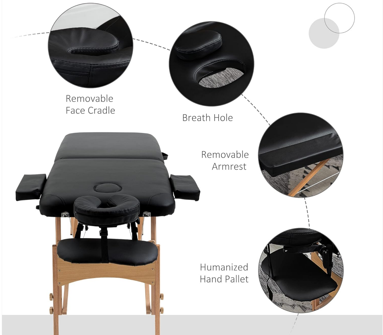
Image: An exploded view highlighting the removable face cradle, breath hole, removable armrests, and the humanized hand pallet for flexible configuration.