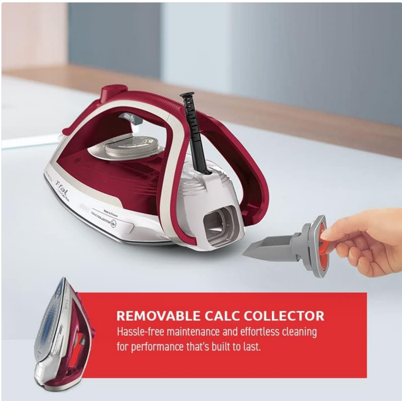
Image: A hand demonstrating the removal of the calc collector from the back of the T-Fal Ultraglide Steam Iron.