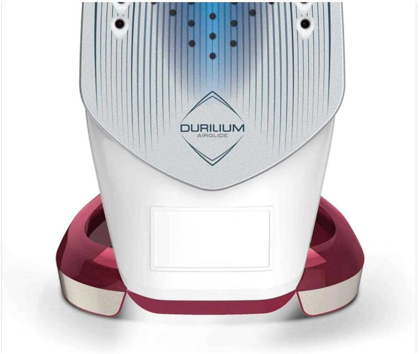
Image: Underside view of the iron, highlighting the Durilium Airglide soleplate with its numerous steam holes and precision tip.