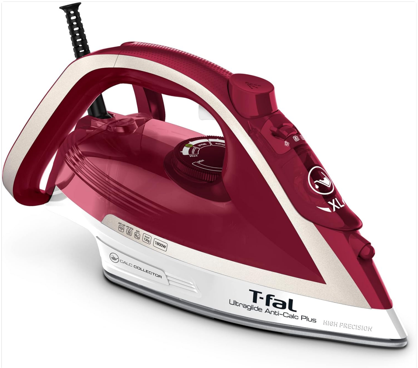
Image: Front view of the T-Fal Ultraglide Steam Iron in red and white, showcasing its sleek design and handle.