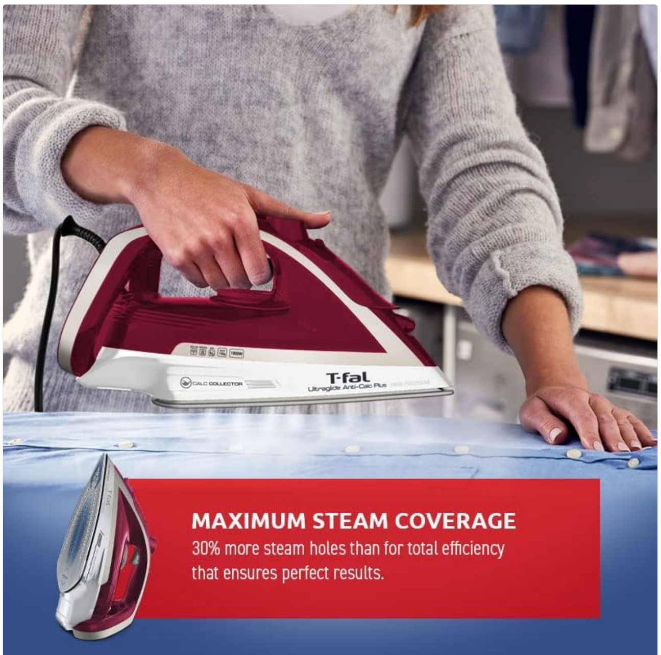
Image: A person's hands guiding the T-Fal Ultraglide Steam Iron over a blue shirt on an ironing board, demonstrating steam coverage.