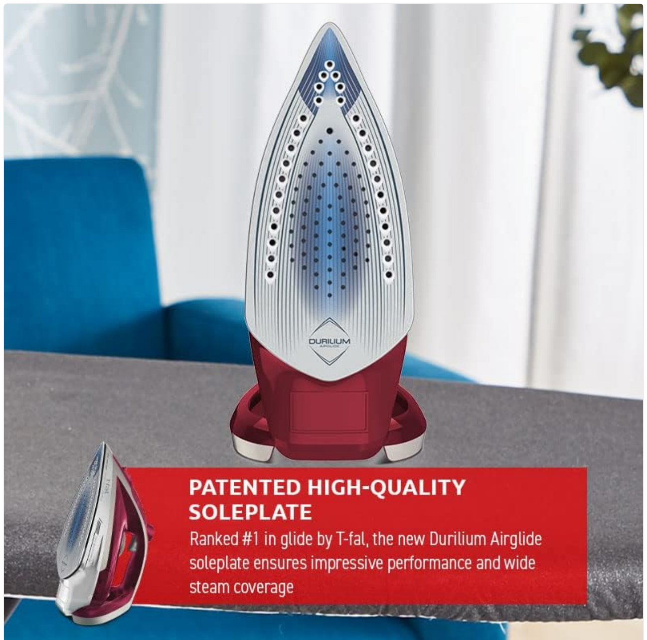
Image: Detailed view of the Durilium Airglide soleplate, emphasizing its smooth surface and steam hole pattern.