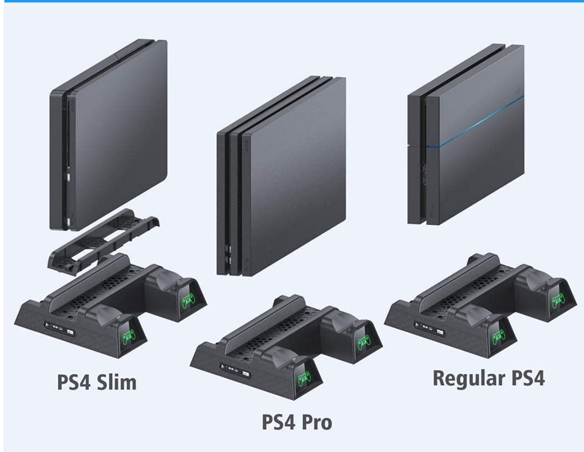
Figure 2: This diagram illustrates how the OIVO PS4 Stand accommodates different PlayStation 4 models: PS4 Slim (with adapter), PS4 Pro, and the original Regular PS4. Each console type is shown vertically mounted on the stand.