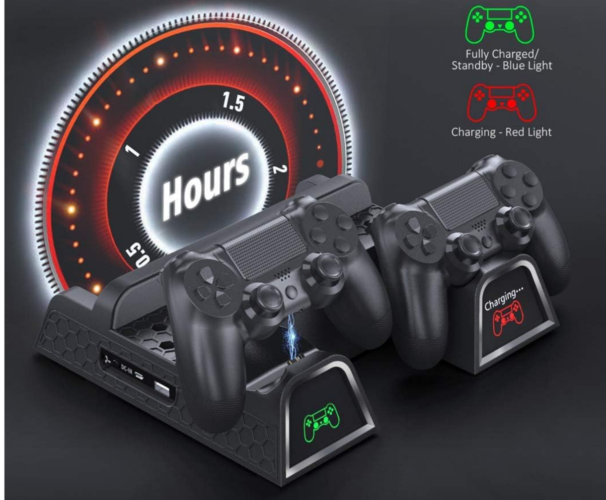
Figure 6: This image illustrates the LED indicators on the OIVO PS4 Stand's charging docks. It shows a timer indicating 2 hours for dual controller charging, with red light for charging and green light for fully charged/standby.

2 hours for charging done dual controllers, saving your time and have more fun.