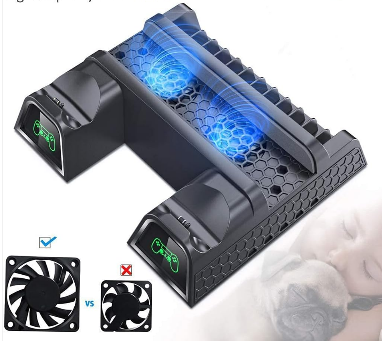
Figure 5: This image highlights the "Improved Cooling System" of the OIVO PS4 Stand, showing blue airflow arrows indicating the cooling effect from the fans. It emphasizes higher speed and lower noise operation, with a comparison of fan types.