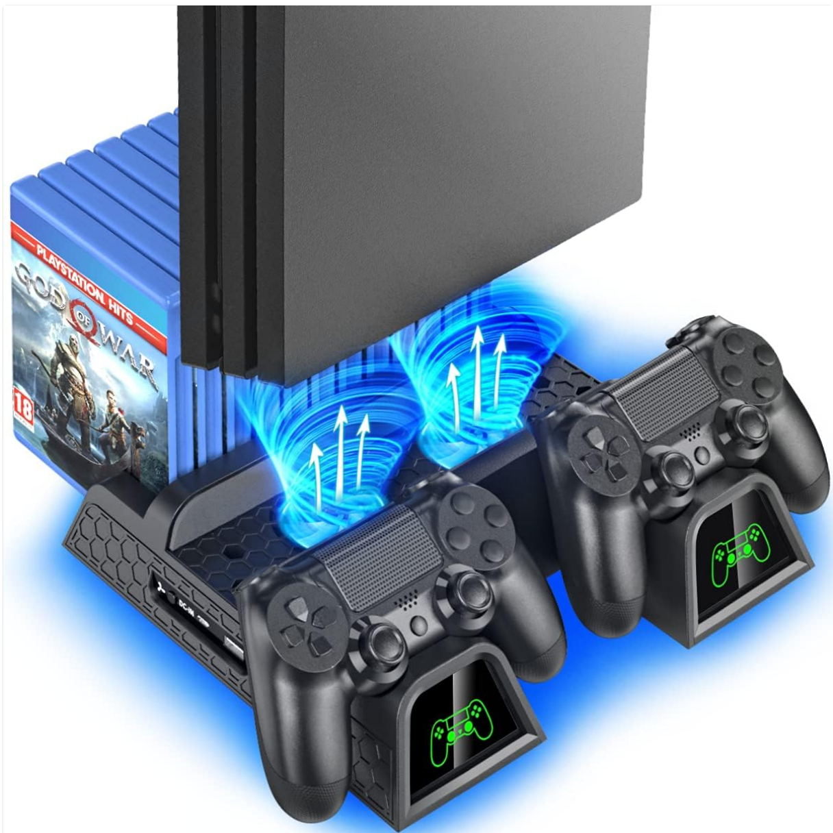
Figure 1: The OIVO PS4 Stand with a PlayStation 4 console and two controllers docked for charging. The image highlights the vertical orientation of the console and the integrated controller charging stations.