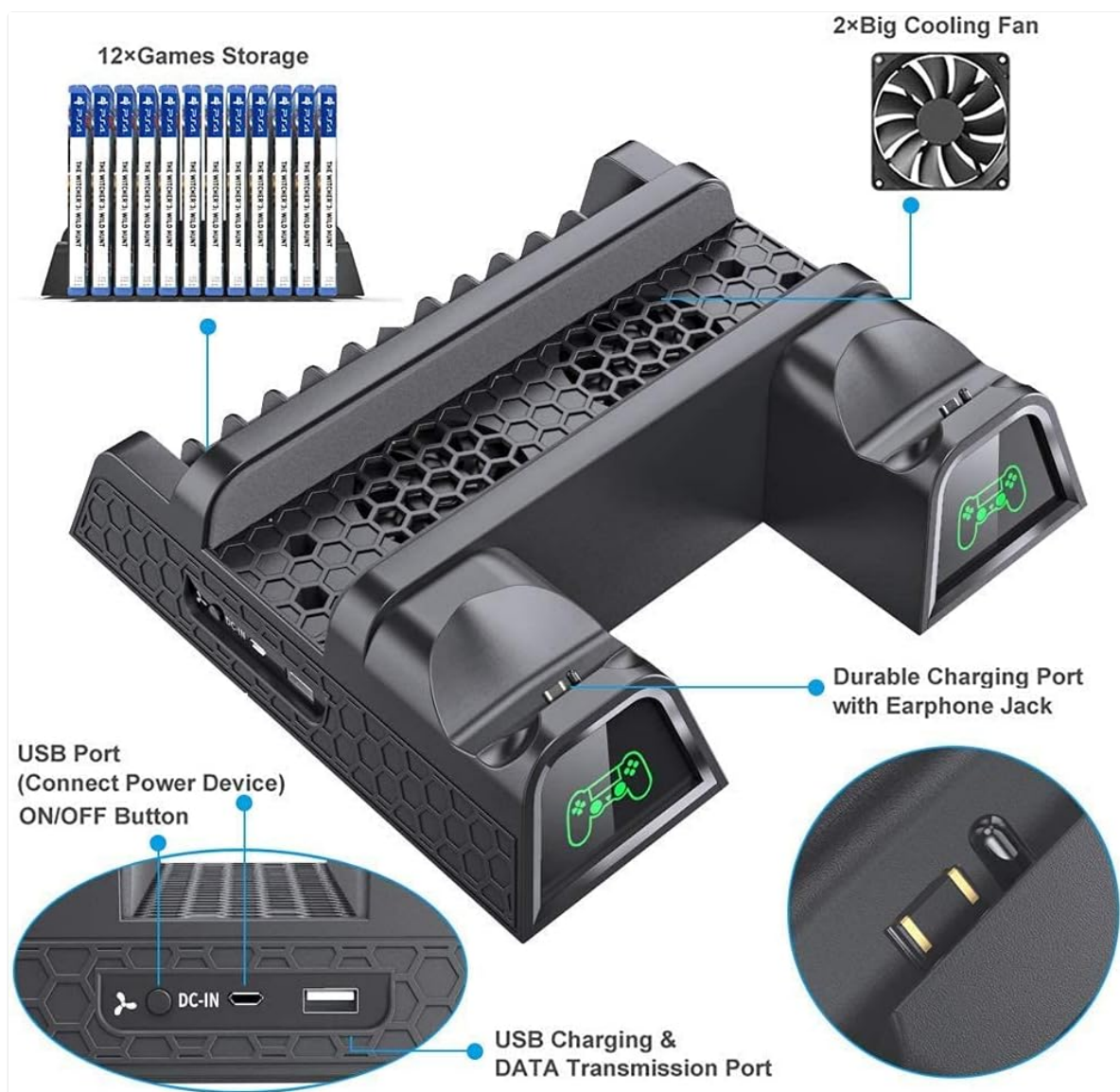
Figure 4: A detailed view of the OIVO PS4 Stand, highlighting its various components: 12 game storage slots, two cooling fans, a durable charging port with earphone jack, a USB port for power, an ON/OFF button, and a USB charging & data transmission port.