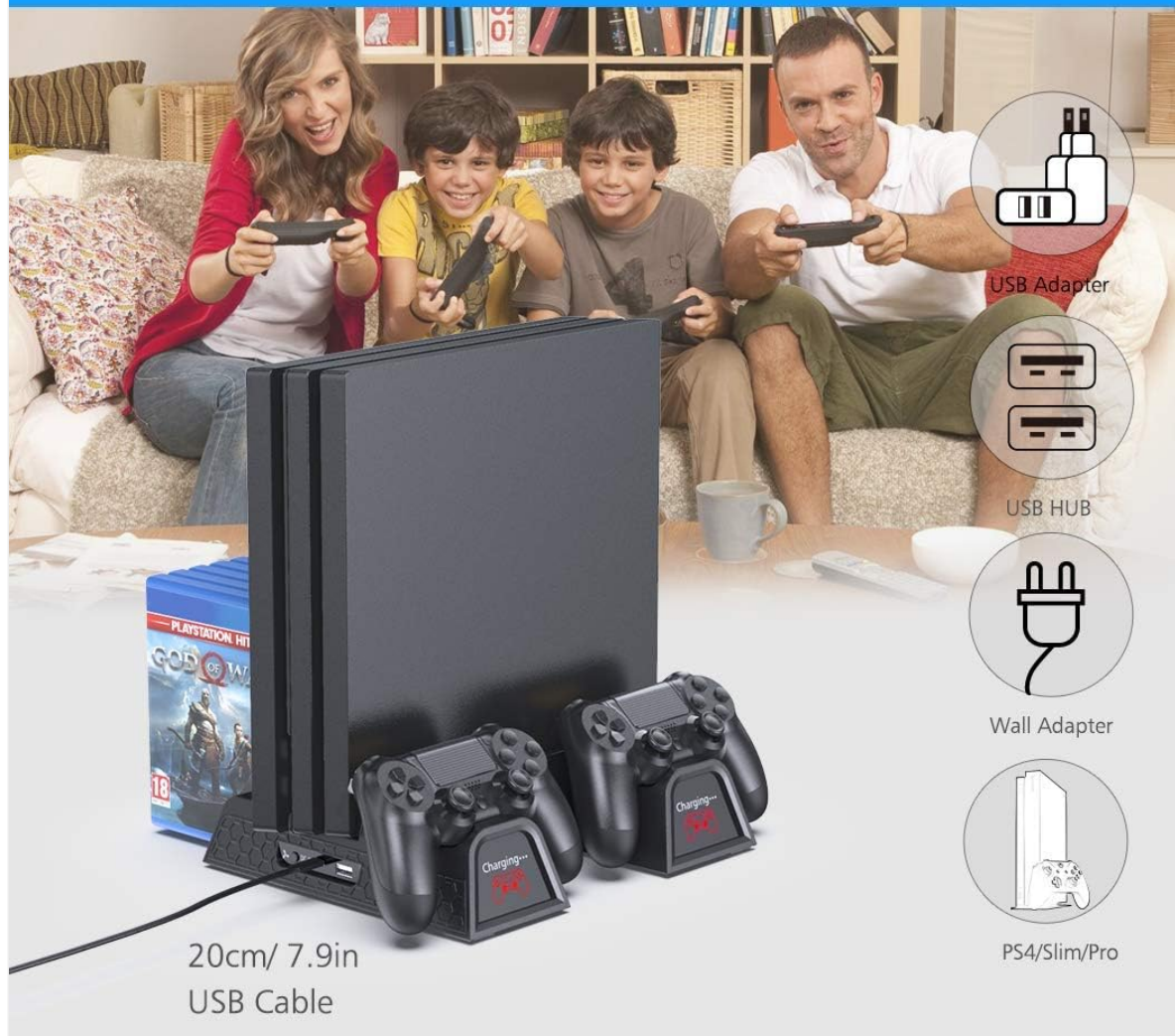
Figure 3: This image displays the different methods to power the OIVO PS4 Stand, including connecting to a USB adapter, USB HUB, wall adapter, or directly to the PS4 console. A 20cm/7.9in USB cable is shown.