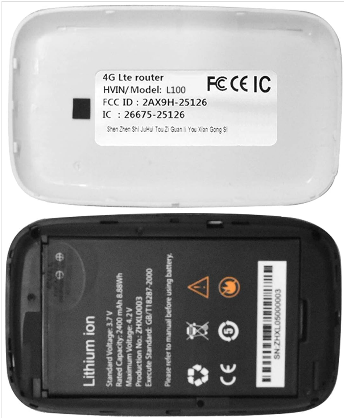
Figure 2.2: Rear view of the KuWiFi Hotspot with the back cover removed, illustrating the Micro SIM card slot and battery compartment.

Video 2.1: Unboxing and initial setup of the KuWiFi Mobile WiFi 4G LTE Hotspot L100. This video demonstrates how to insert the SIM card and battery.