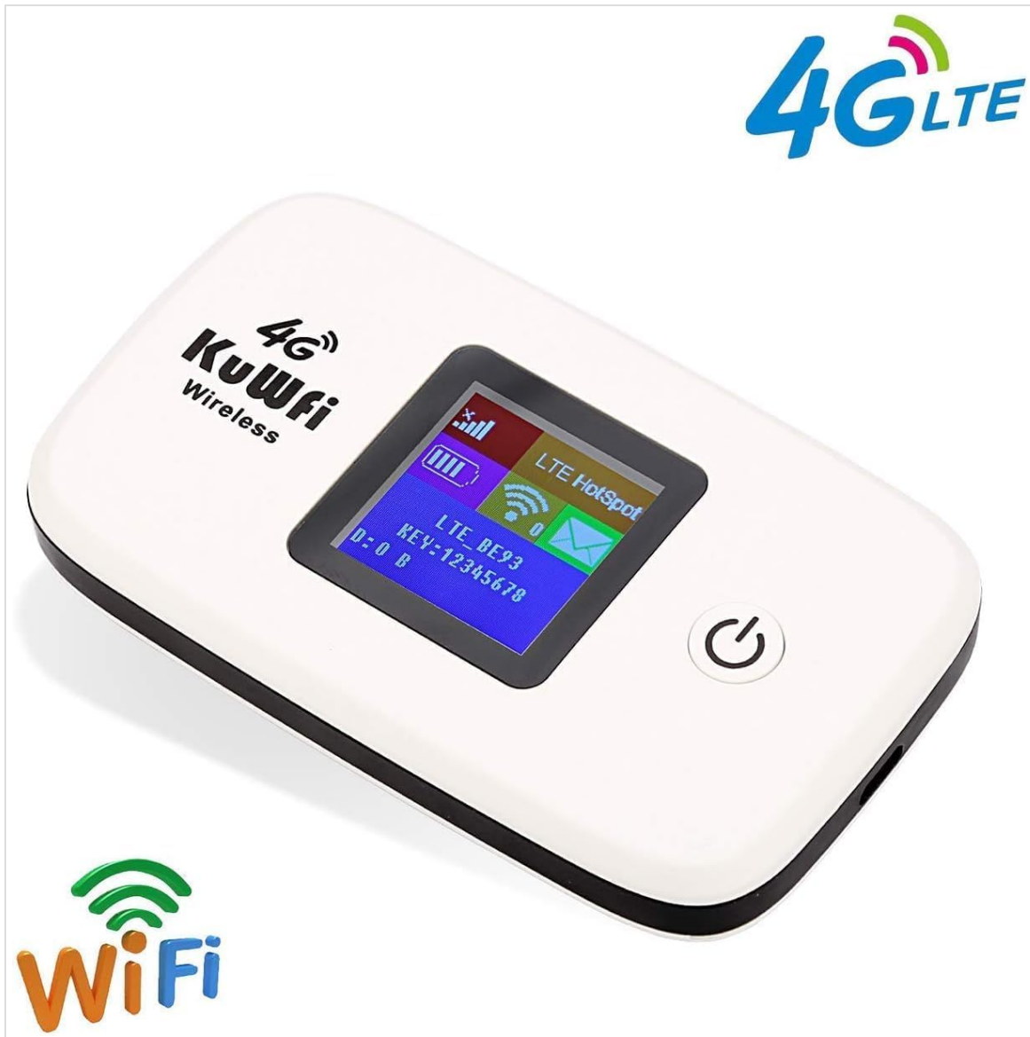
Figure 2.3: The hotspot's screen displaying the network name (SSID) and Wi-Fi key for connection.