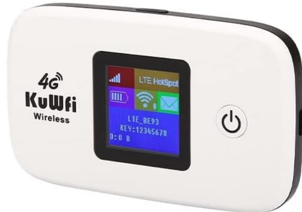
Figure 4.1: Use only the matching charging cable for the KuWFi Hotspot.