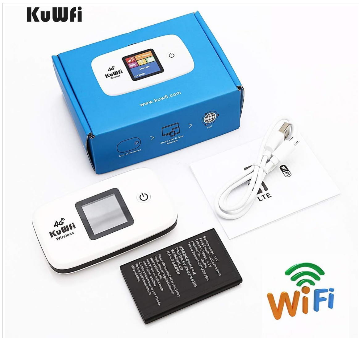
Figure 2.1: Contents of the KuWiFi Hotspot package, including the device, battery, USB cable, and user manual.