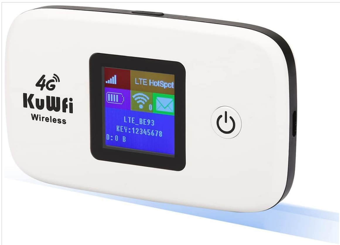
Figure 1.1: KuWiFi 4G LTE Wi-Fi Hotspot Device (Model L100US)

The KuWiFi L100US is a portable 4G LTE Wi-Fi hotspot travel router designed to provide internet access via a HSPA/LTE Data SIM Card. It features a screen display and a 2400mAh lithium battery, making it suitable for both indoor and outdoor use without the need for a broadband connection. This device allows up to 10 users to share Wi-Fi within a 50-meter distance.