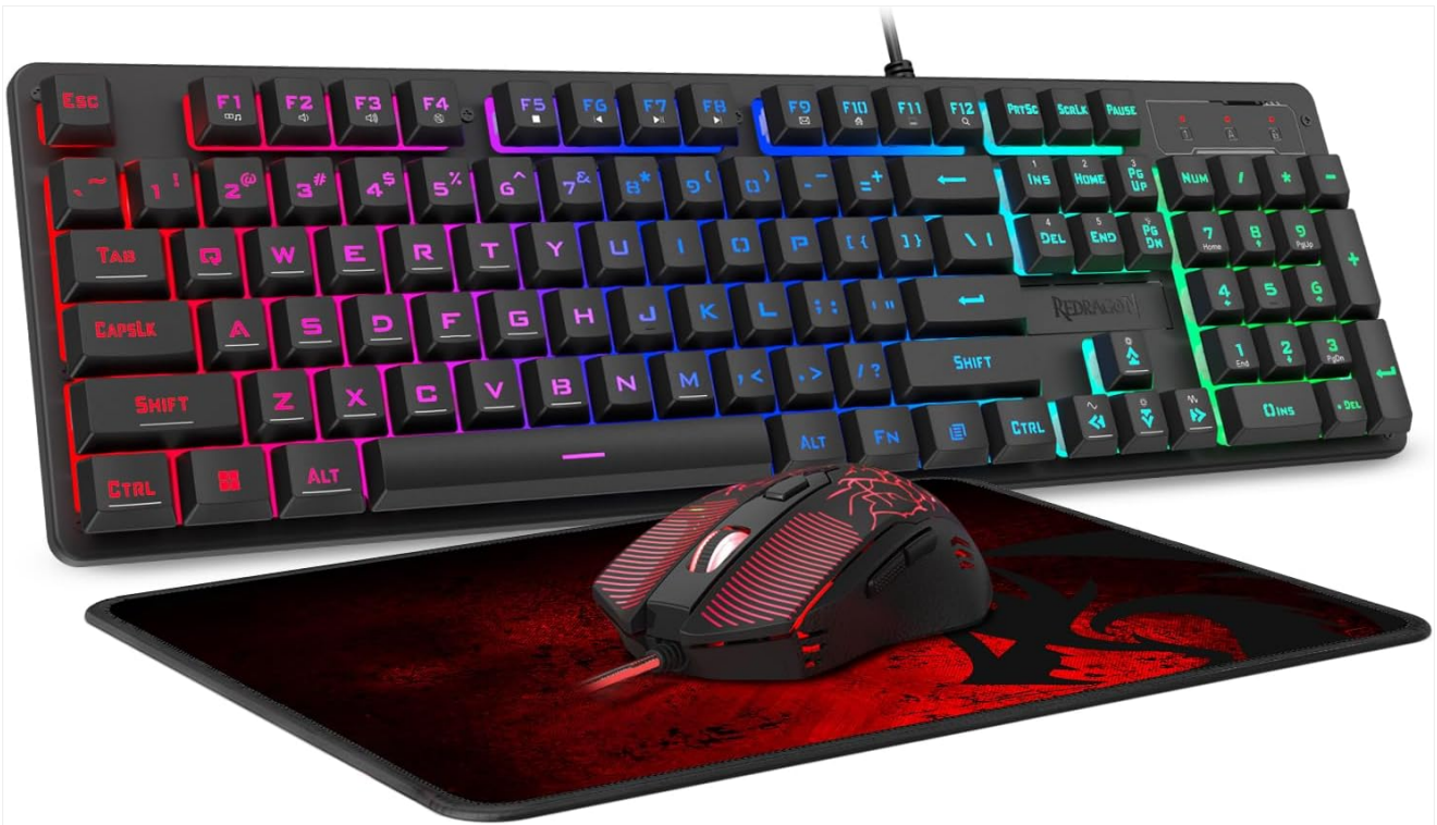
Image 2.1: Redragon S107 Wired Gaming Keyboard, Mouse, and Mouse Pad.