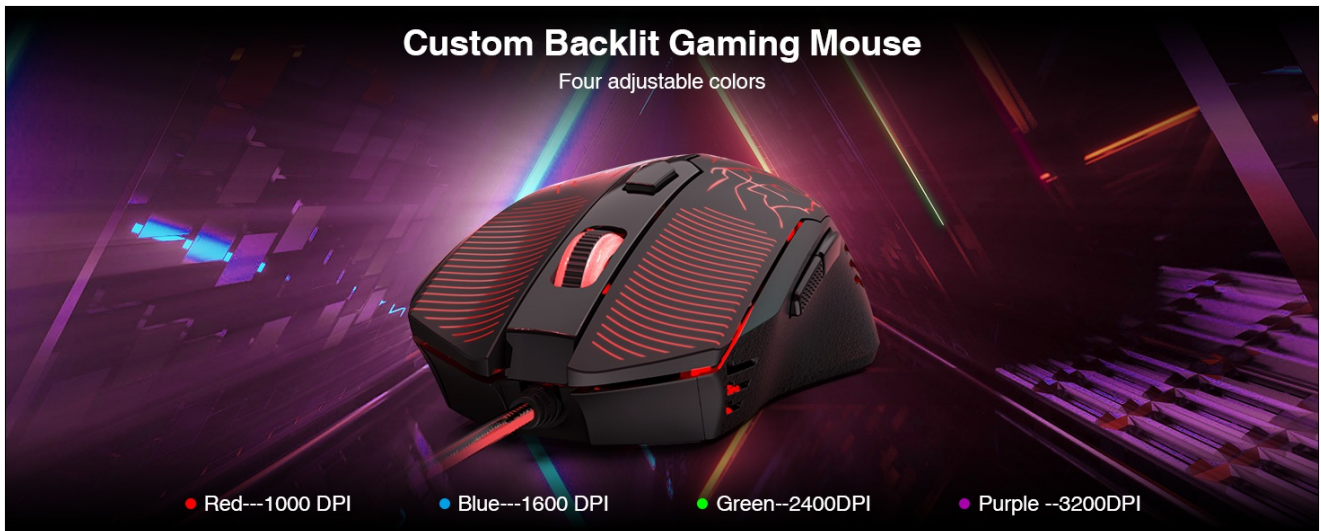
Image 4.4: Mouse illustrating the 4-color adjustable DPI settings.