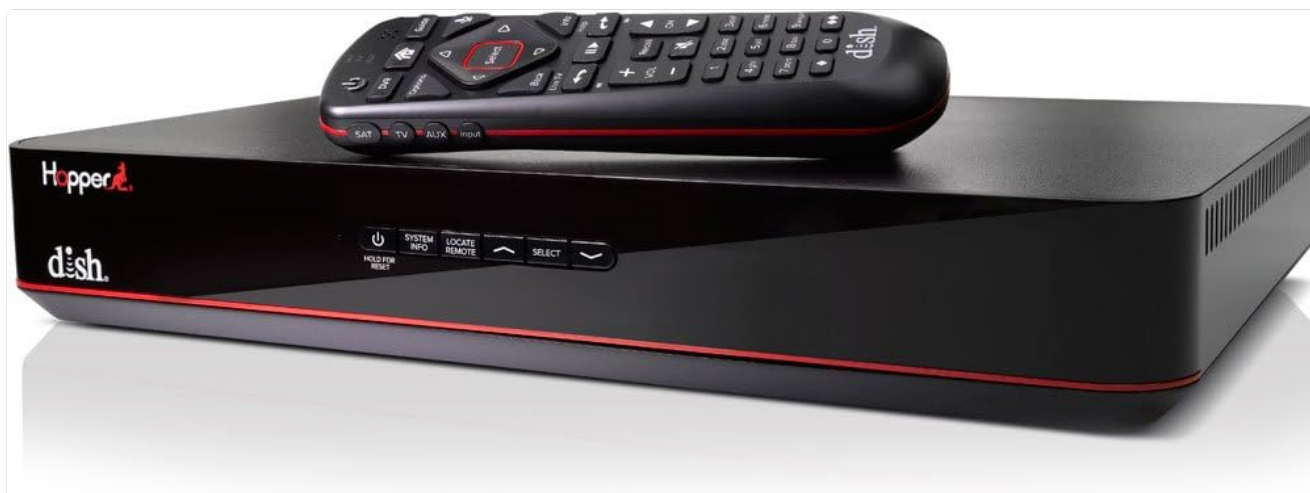
Image: The DISH Hopper Duo Smart DVR unit, a sleek black rectangular device with a red accent line, is shown with its accompanying black voice remote control resting on top. The remote features a prominent red 'Select' button and various other controls.

The DISH Hopper Duo Smart DVR is designed to provide a comprehensive and intuitive television viewing and recording experience. It delivers faster performance and a modern user interface, capable of supporting up to two high-definition televisions in your home when integrated with a Joey receiver. This system includes a voice-activated remote control with a convenient remote finder function, allowing for easy navigation and control. The Hopper Duo can record and store up to 125 hours of high-definition programming. Its advanced features enable users to manage recordings remotely via a smartphone, watch two programs simultaneously using Picture-in-Picture (PiP), and seamlessly continue watching content from one room to another. The device also integrates popular smart TV applications such as Netflix and Pandora directly into its interface, eliminating the need to switch inputs.