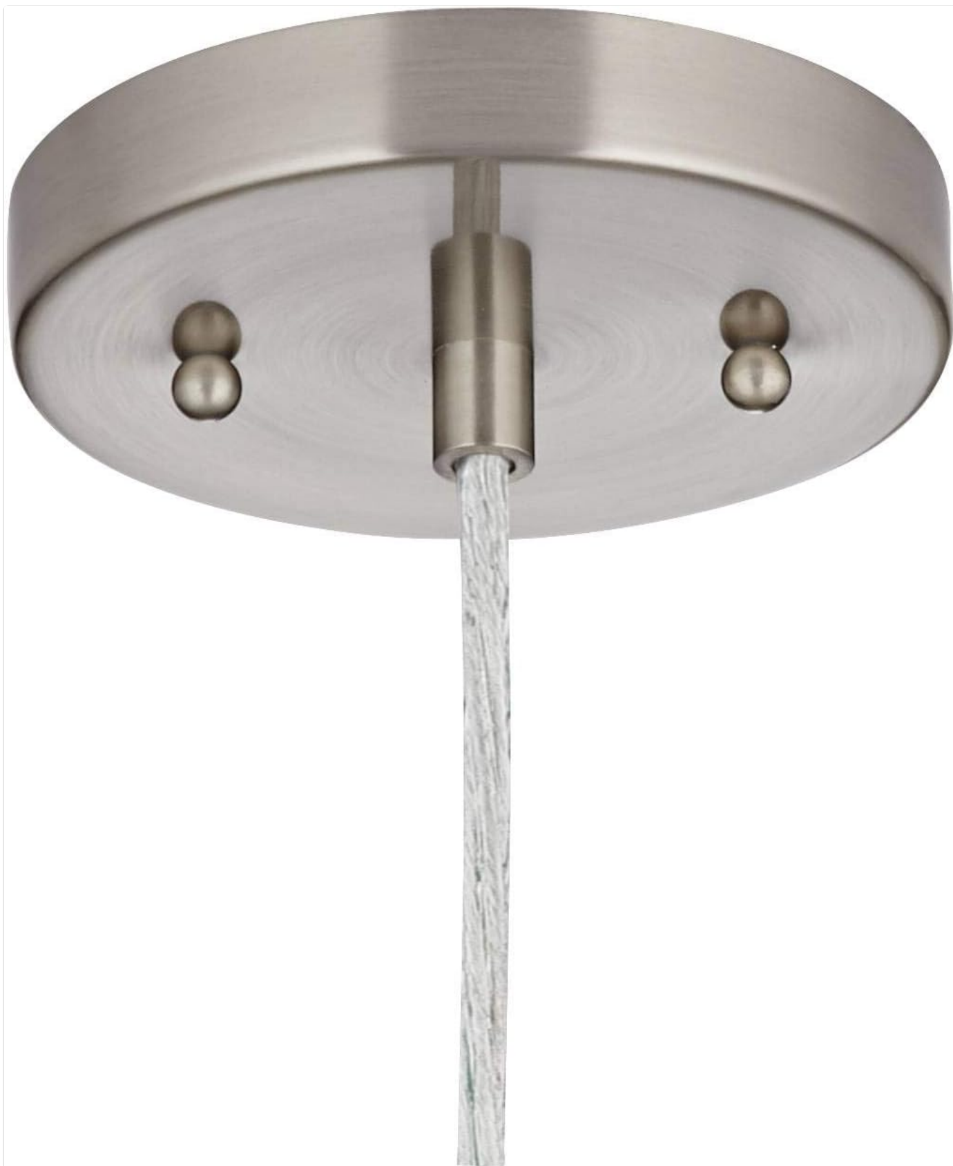
Image: Close-up view of the brushed nickel canopy and mounting hardware, showing the cord entry point.