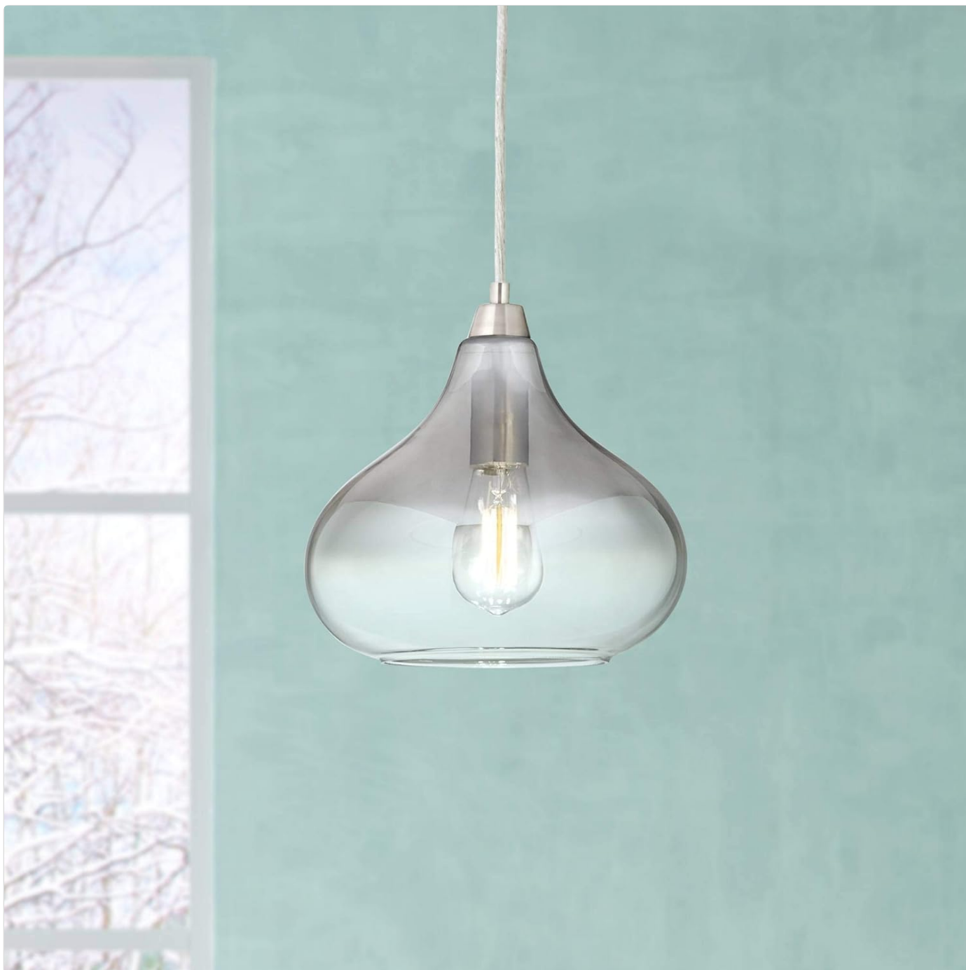
Image: The Possini Euro Design Eun Mini Pendant Lighting Fixture featuring a smoked graded glass shade and brushed nickel finish.