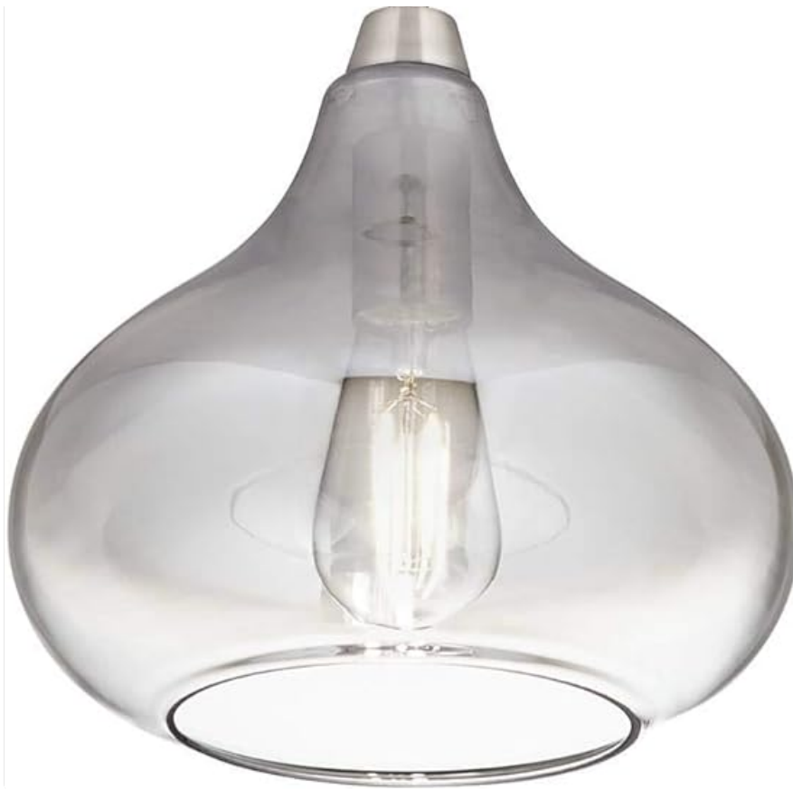
Image: Close-up of the included 7-watt Edison style LED bulb, which is dimmable and has an E26 base.