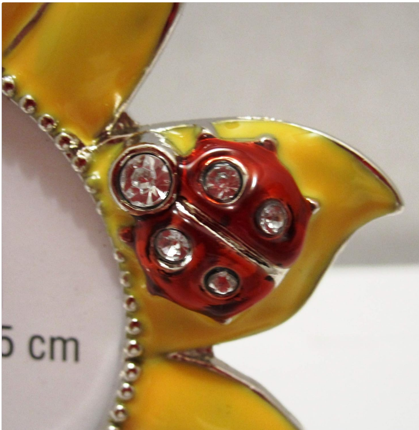
Figure 2: A detailed close-up of the red jeweled ladybug accent, highlighting its intricate design and embedded jewels.