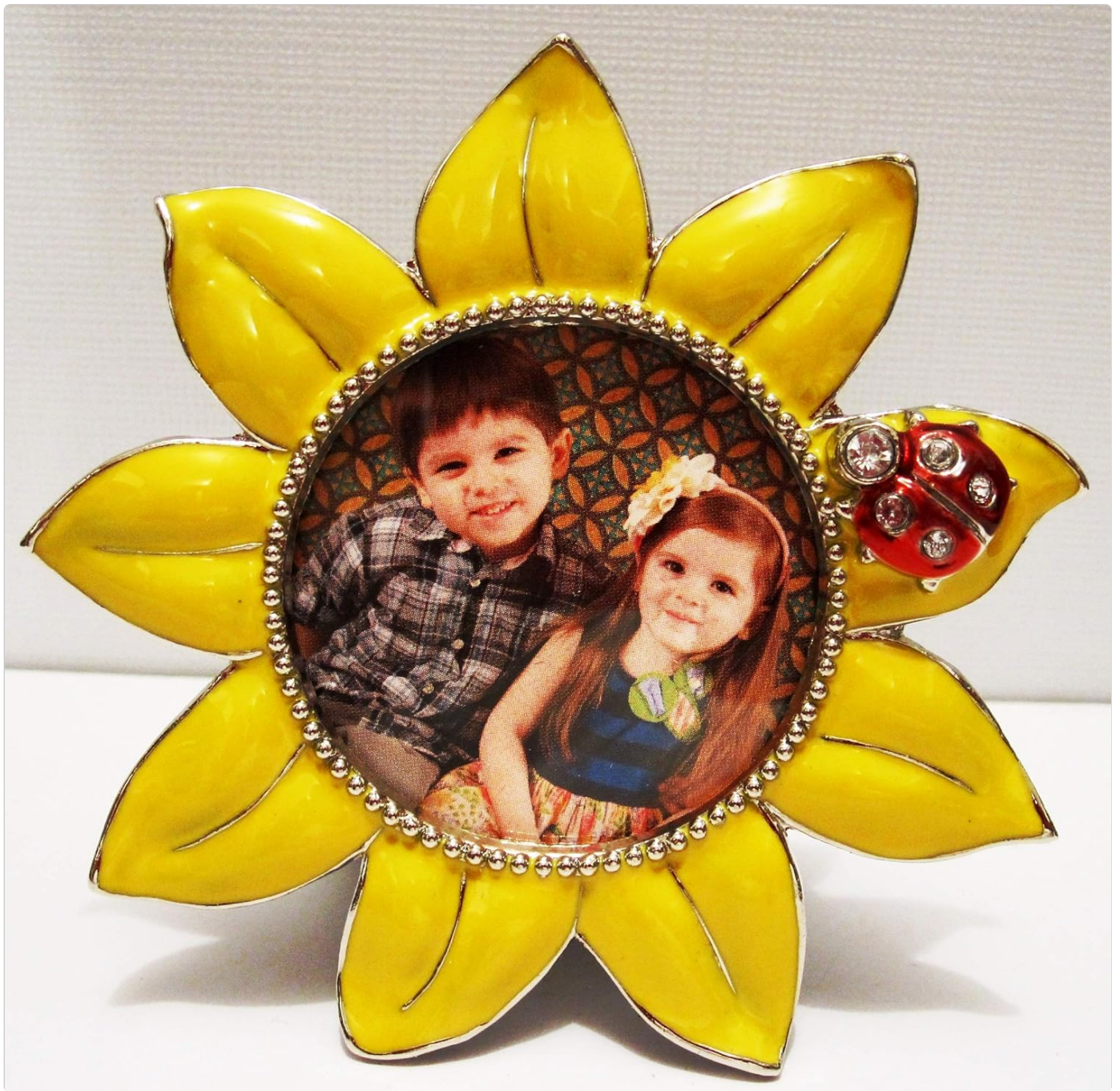
Figure 1: Front view of the Sunflower Frame, showcasing its yellow petals, round photo opening, and red jeweled ladybug. A sample photo of two children is displayed within the frame.