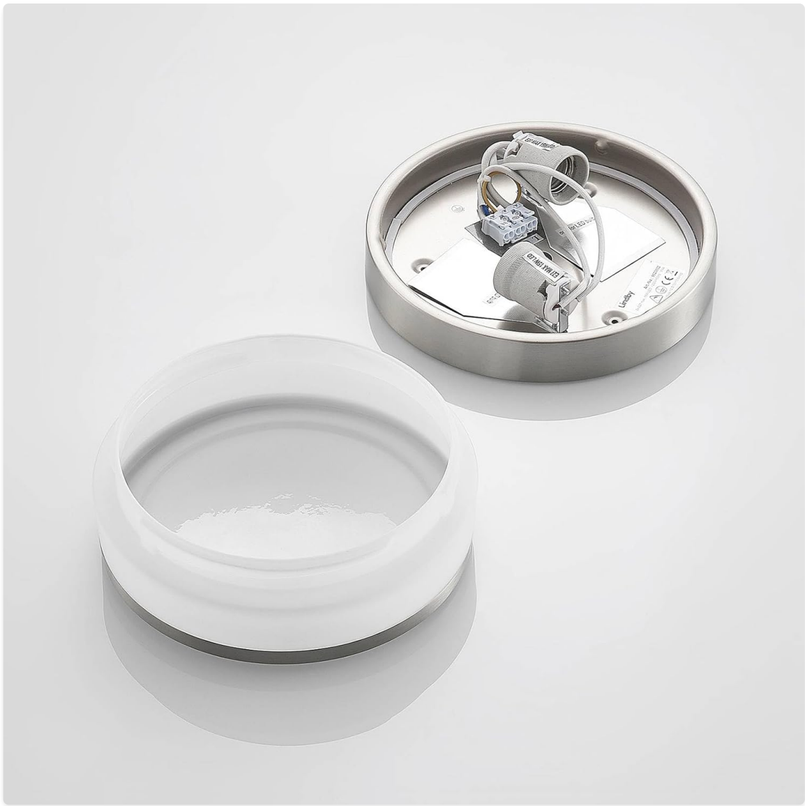
Image: The Lindby Flavi fixture disassembled, illustrating the metal base with two E27 bulb holders and the separate glass diffuser.