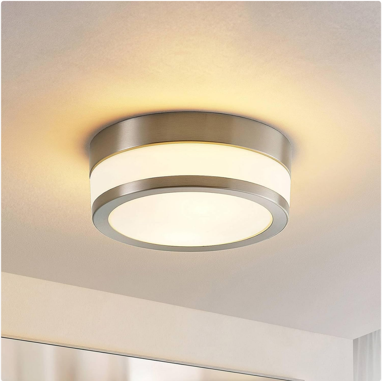
Image: The Lindby Flavi ceiling light, showcasing its modern design and warm illumination in a bathroom setting.