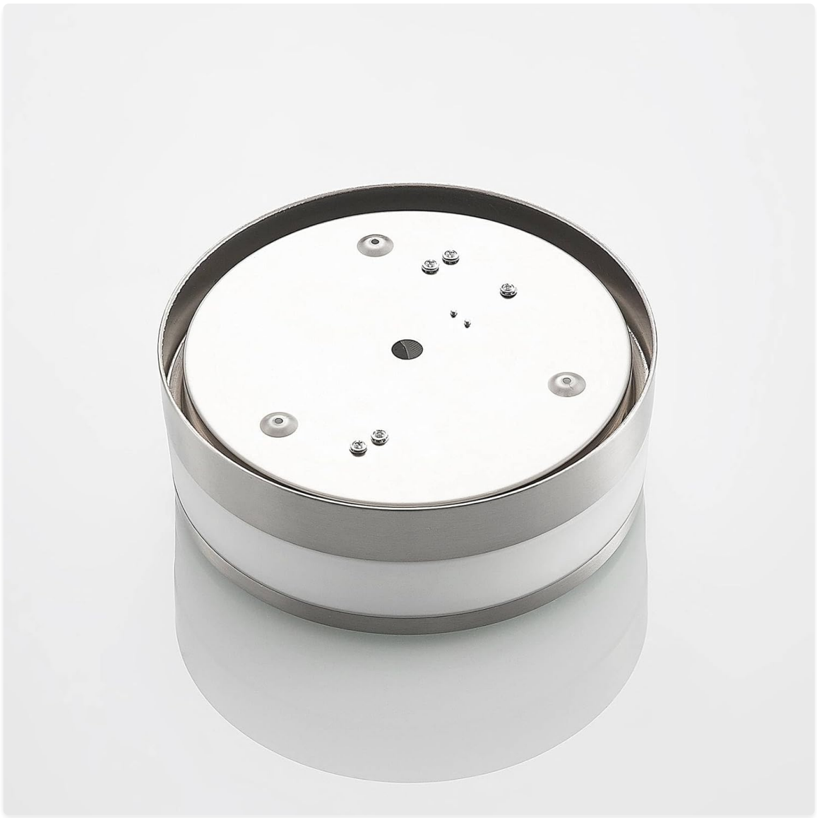
Image: The internal mounting plate of the Lindby Flavi fixture, showing the electrical connections and screw points for ceiling attachment.