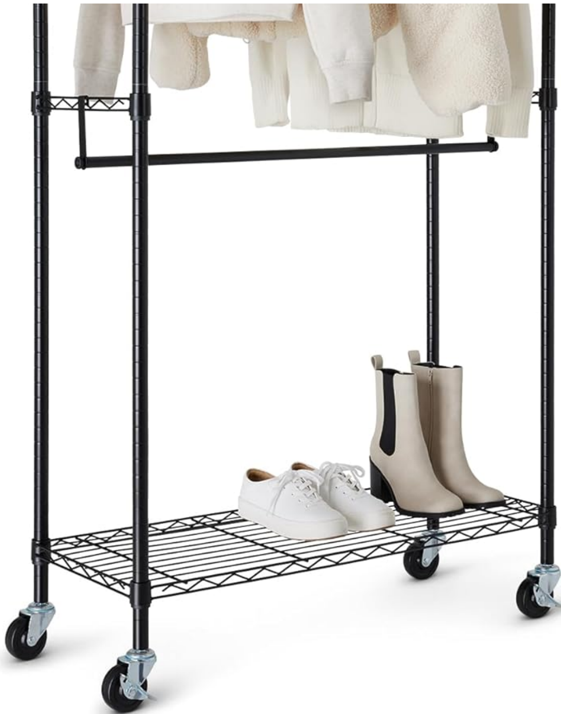
Image 1: The Amazon Basics Double Hanging Rod Garment Rack, fully assembled and in use, showcasing its double hanging rods, top and bottom shelves, and rolling casters. Various garments and shoes are displayed on the rack.