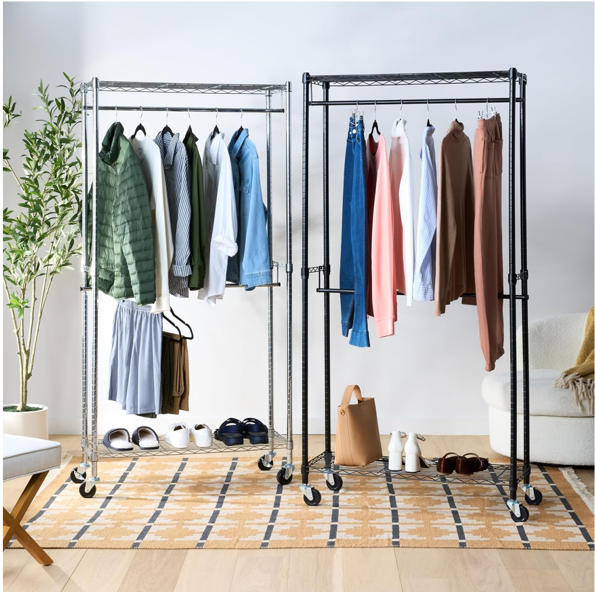
Image 3: An angled view of the Amazon Basics Double Hanging Rod Garment Rack, showcasing its capacity with various clothing items and shoes. This perspective highlights the dual hanging rods and the utility of the top and bottom shelves.