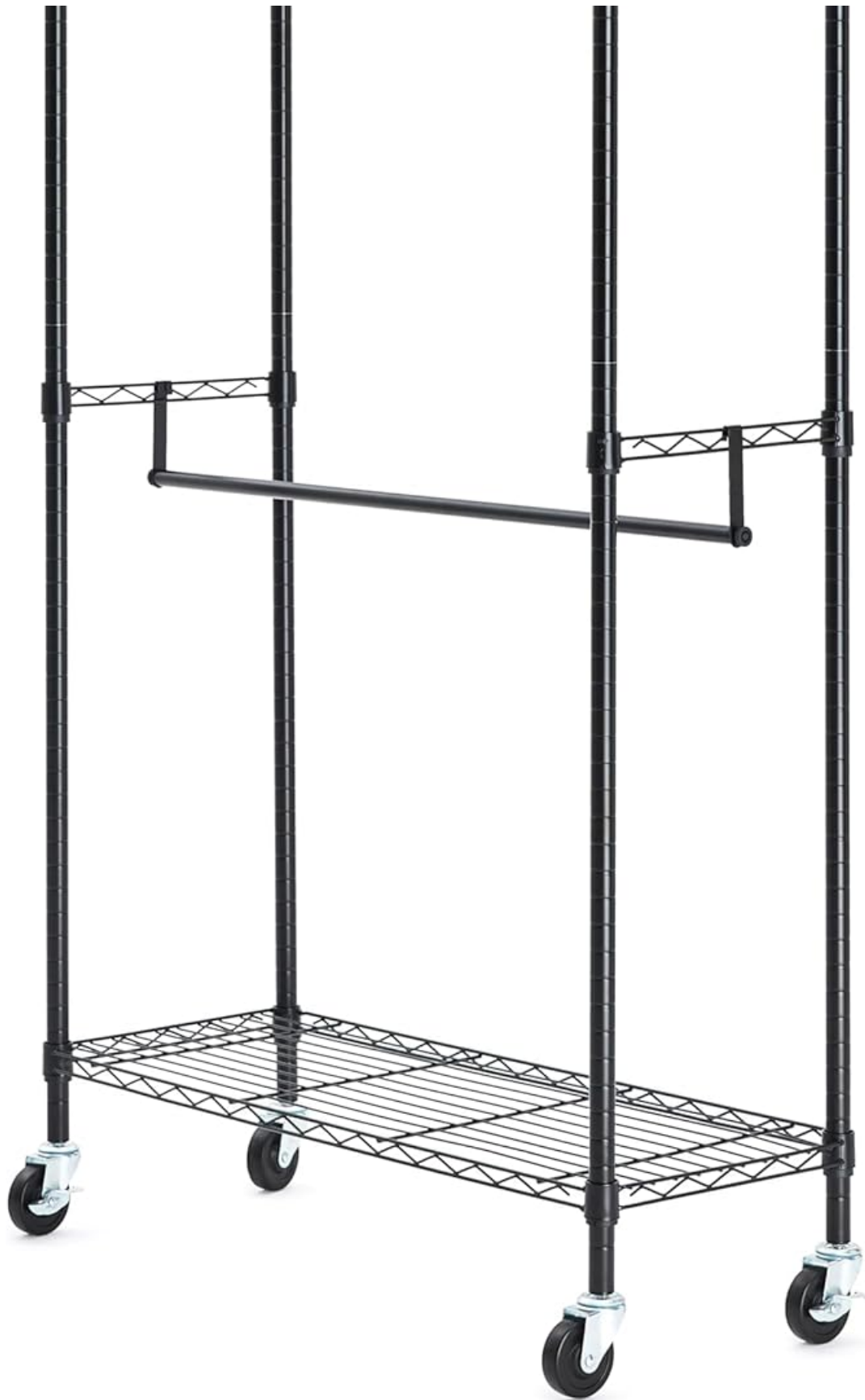
Image 2: The Amazon Basics Double Hanging Rod Garment Rack, empty and viewed from the front, highlighting its two hanging rods and two shelves. This view demonstrates the rack's structure before items are placed on it.