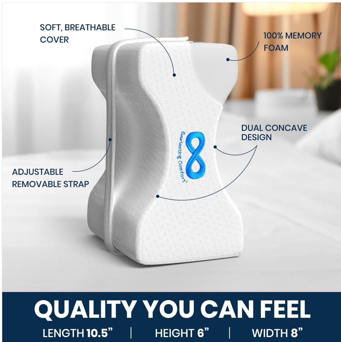
Figure 1: Key features of the Everlasting Comfort Memory Foam Leg & Knee Pillow, highlighting its 100% memory foam, soft breathable cover, dual concave design, and adjustable removable strap. Dimensions are 10.5" Length, 6" Height, and 8" Width.