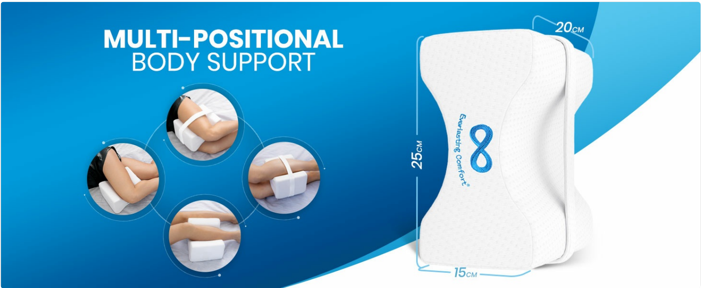
Figure 5: Detailed dimensions of the Everlasting Comfort Knee Pillow, showing its length, width, and height.