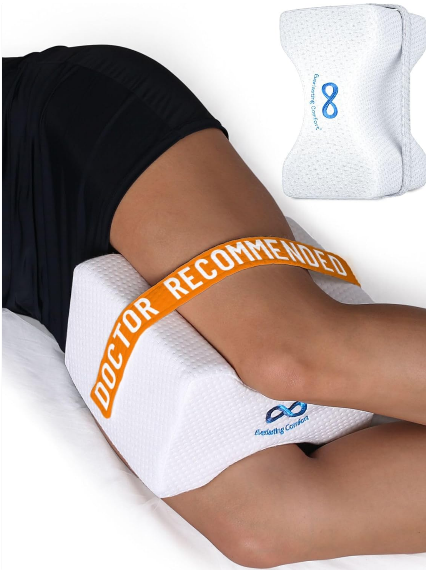
Figure 2: Proper usage of the knee pillow for side sleepers, demonstrating placement between the knees with the adjustable strap secured around the upper leg for stability.