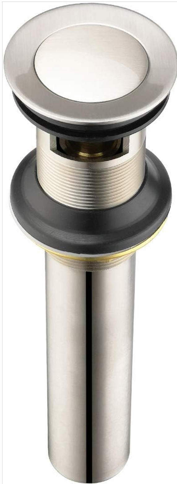
Figure 3.1: The Purelux pop-up drain assembly with the top rubber washer correctly positioned for installation.