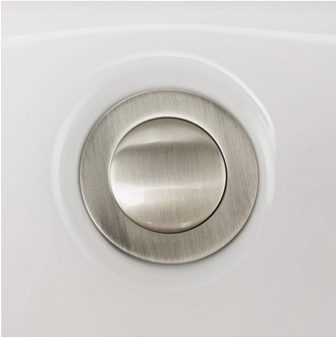
Figure 4.1: The drain stopper in its closed position, effectively sealing the sink.