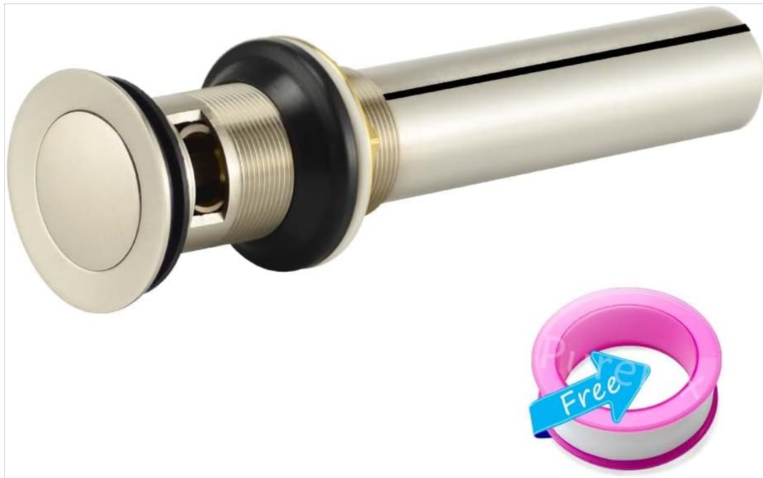
Figure 2.2: The Purelux pop-up drain assembly shown alongside the complimentary roll of plumber's tape.