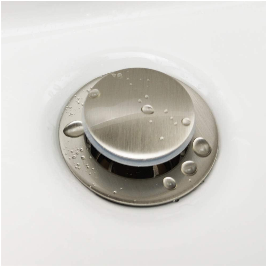
Figure 4.2: The drain stopper in its open position, allowing water to drain freely from the sink.