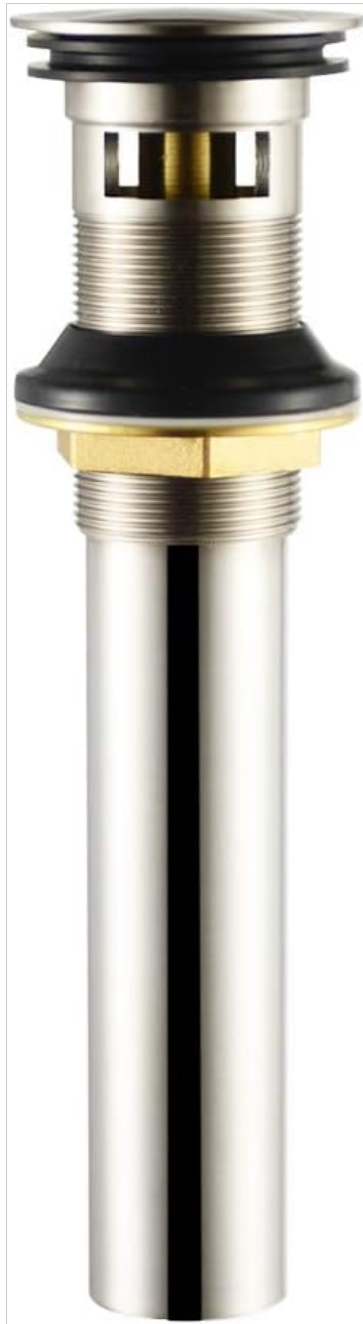
Figure 2.1: Exploded view of the Purelux pop-up drain assembly, showing the drain body, washers, and mounting nut.