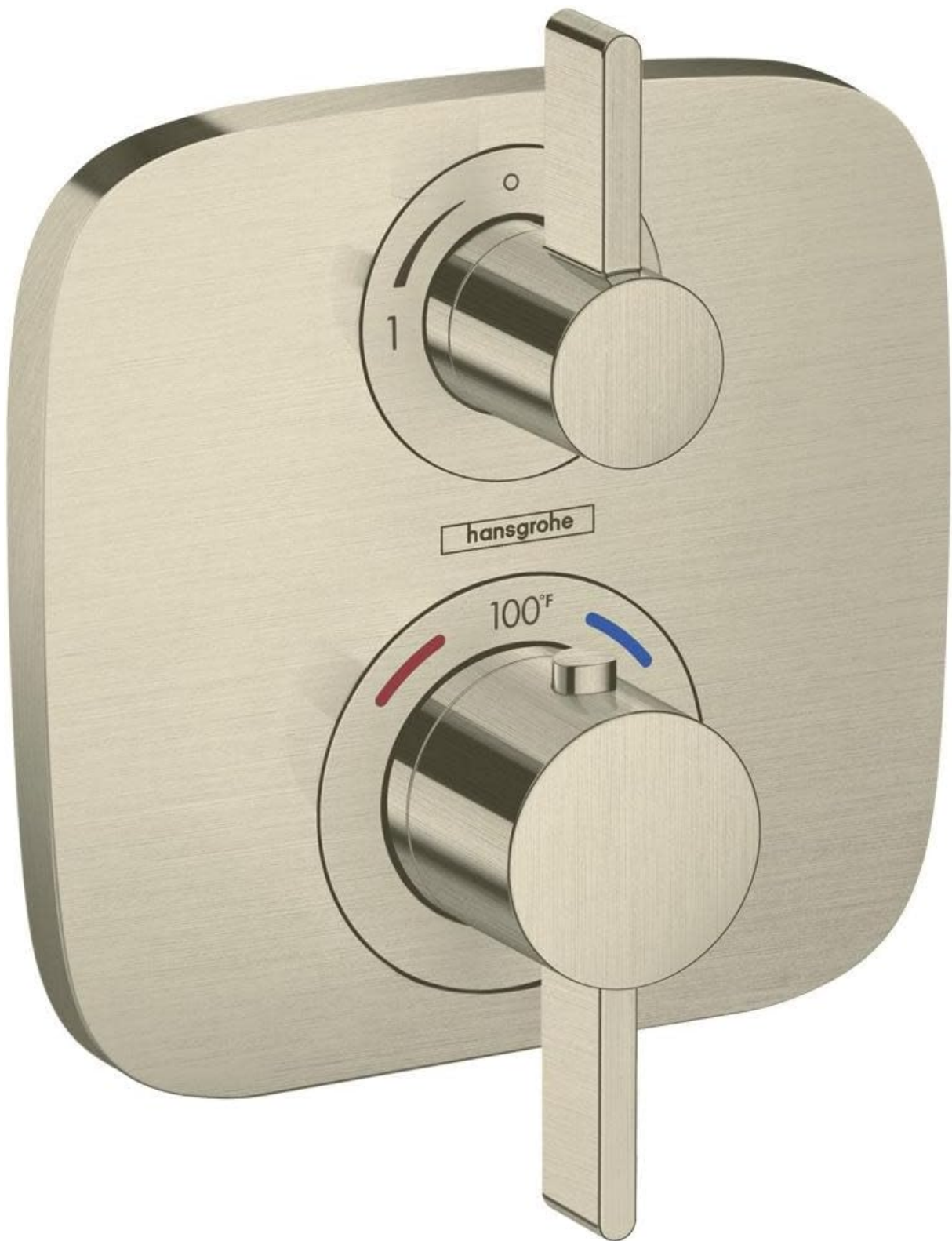
Image: hansgrohe Ecostat E Thermostatic Shower Valve Trim in Brushed Nickel, showing the two control handles and the trim plate.