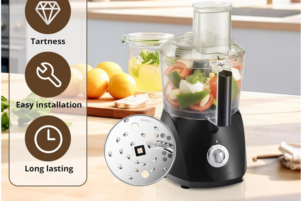
Image: The SuperDi blade shown alongside a food processor, illustrating its key features.

PLEASE NOTE When using this product, use caution or wear gloves to prevent cuts