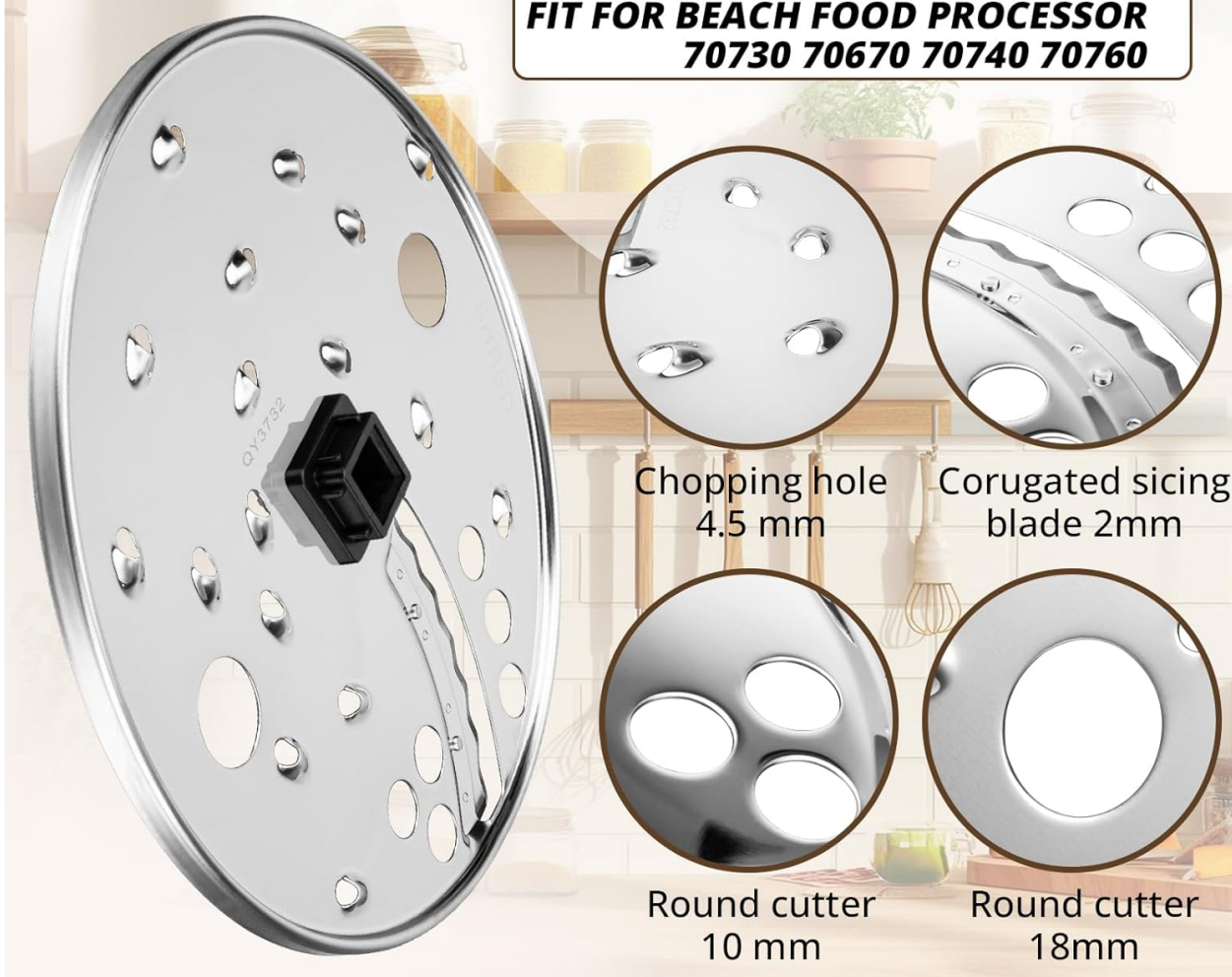
Image: Detailed view of the blade's cutting surfaces and central attachment point.

FIT FOR BEACH FOOD PROCESSOR 70730 70670 70740 70760