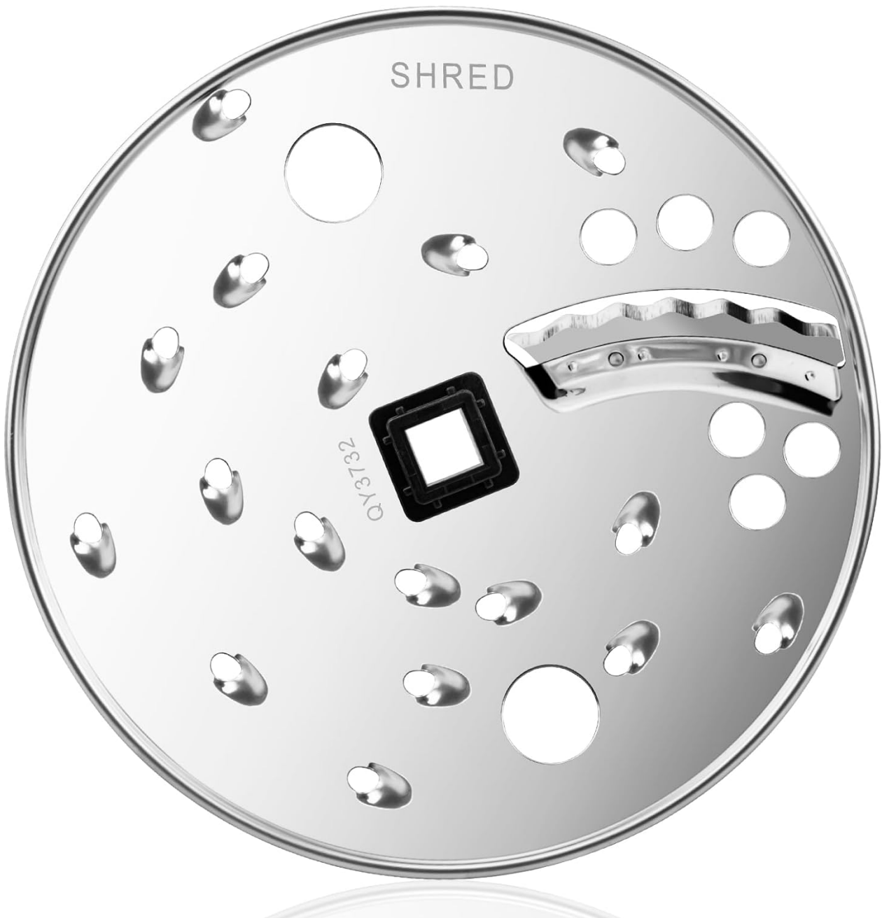
Image: The SuperDi Food Processor Slice/Shred Disc Blade, a stainless steel disc with various cutting surfaces.