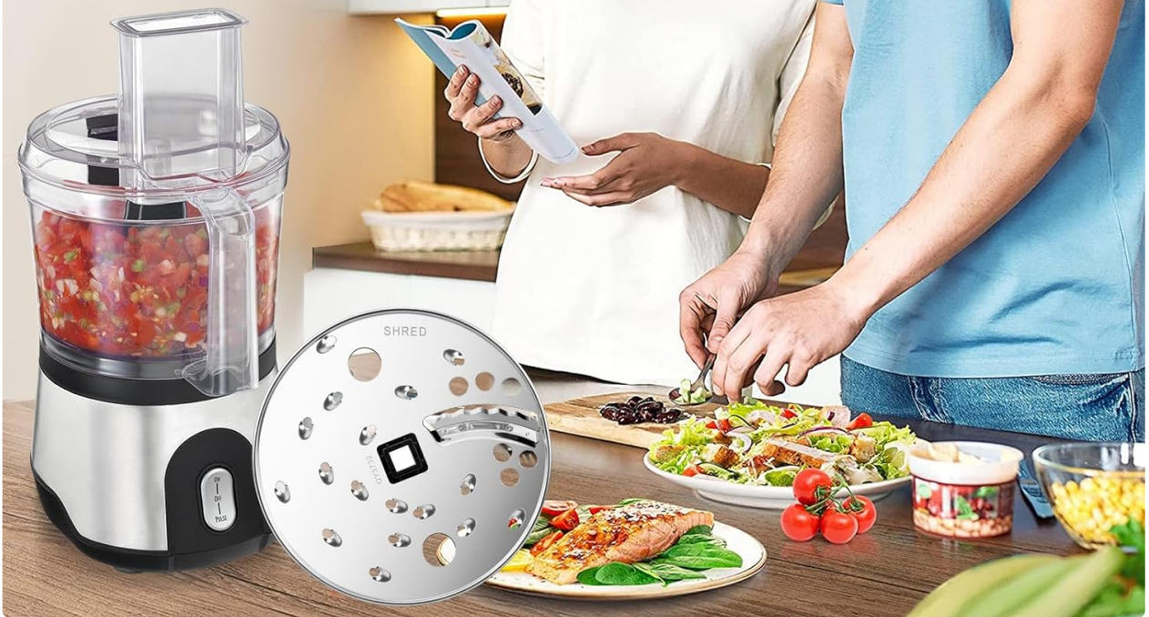
Image: The blade actively processing food, demonstrating its efficient cutting capability.

Food Processor Slice are able to evenly cut vegetables, fruits, cheese and other ingredients into thin slices or julienne.