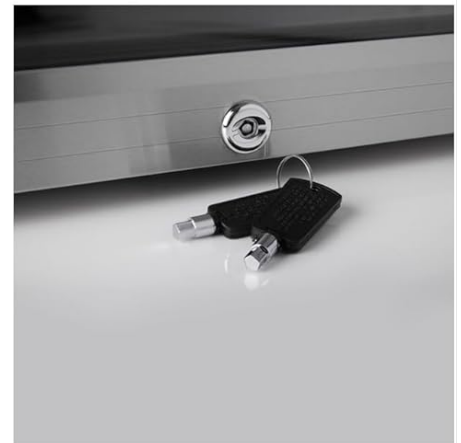
Lock & Key