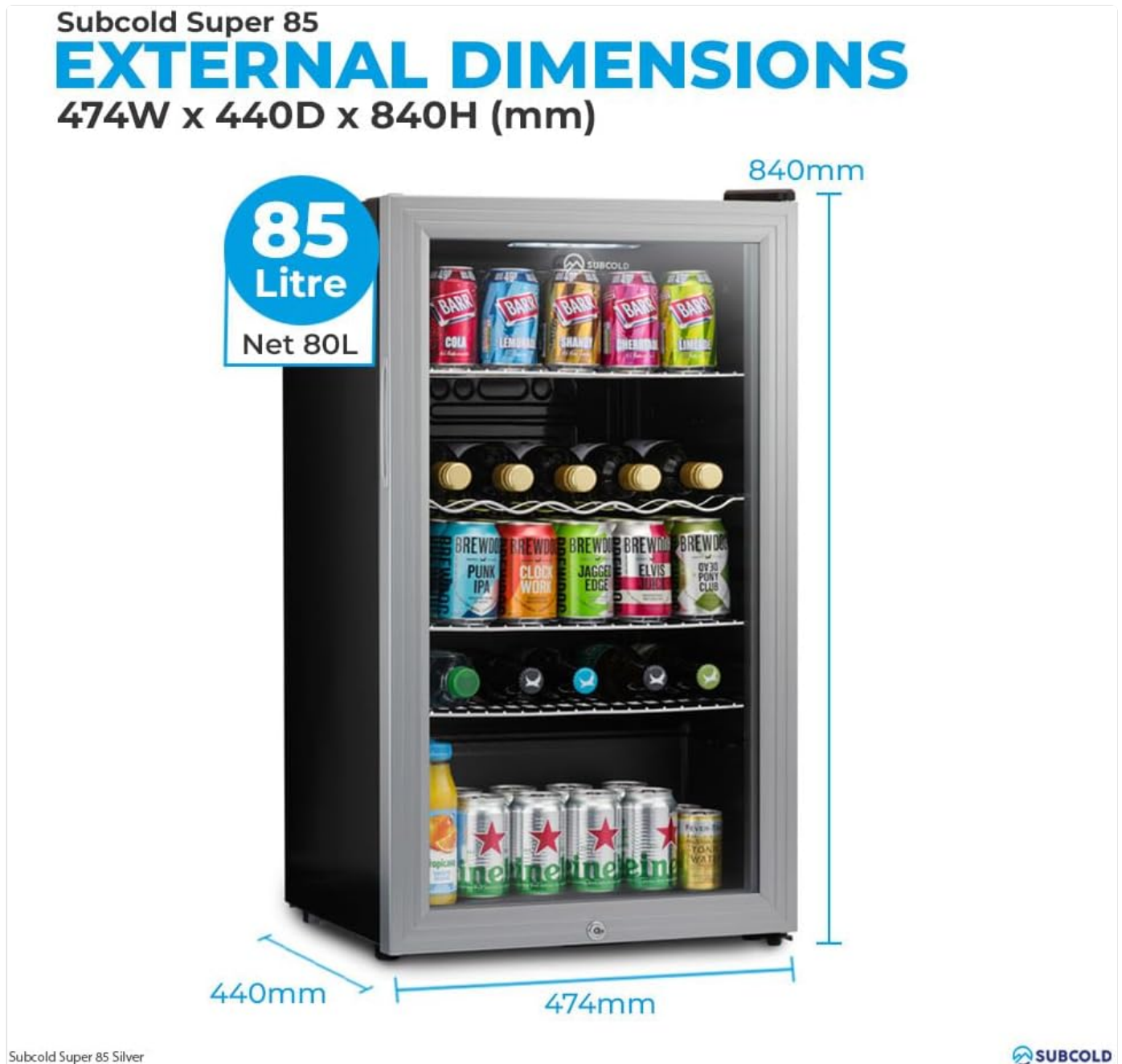
Figure 1: External Dimensions of the Subcold Super85 LED Fridge. Dimensions are 474mm (W) x 440mm (D) x 840mm (H).

Place the fridge on a firm, level surface away from direct sunlight, heat sources (e.g., ovens, radiators), and moisture. Ensure adequate ventilation around the unit. Maintain a minimum clearance of 10 cm (4 inches) from walls and other objects to allow for proper air circulation and heat dissipation. This appliance is designed for freestanding installation.