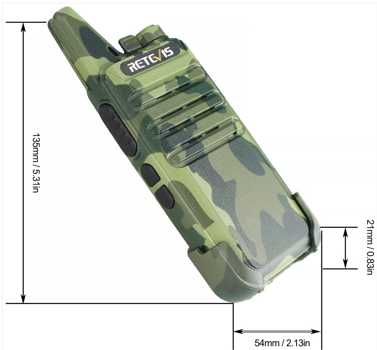
Image 8.1: Visual representation of the Retevis RT22 radio's dimensions.