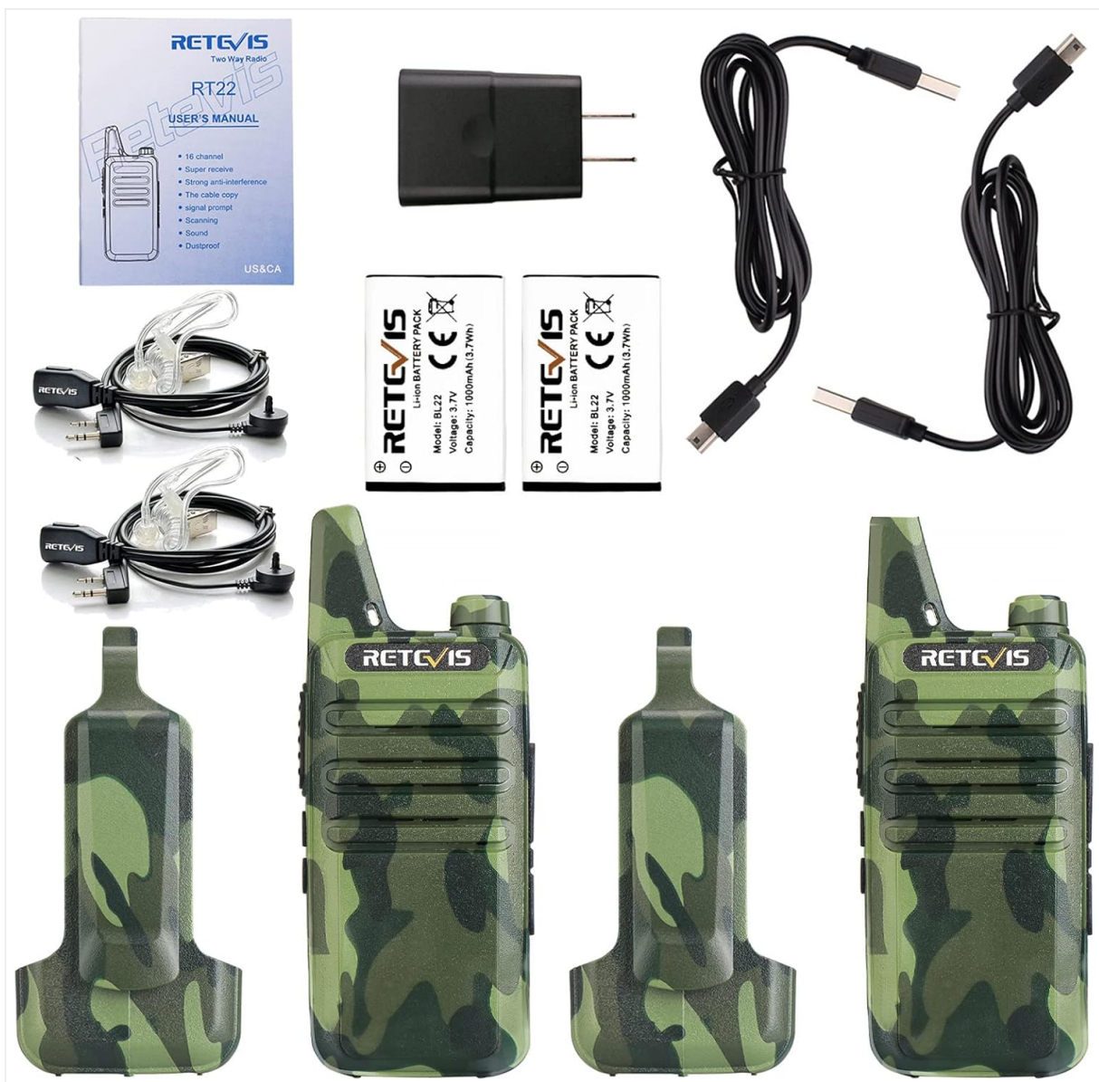
Image 2.1: The complete package contents for the Retevis RT22 Walkie Talkies, including two radios, batteries, charging cables, power adapter, earpieces, and belt clips.