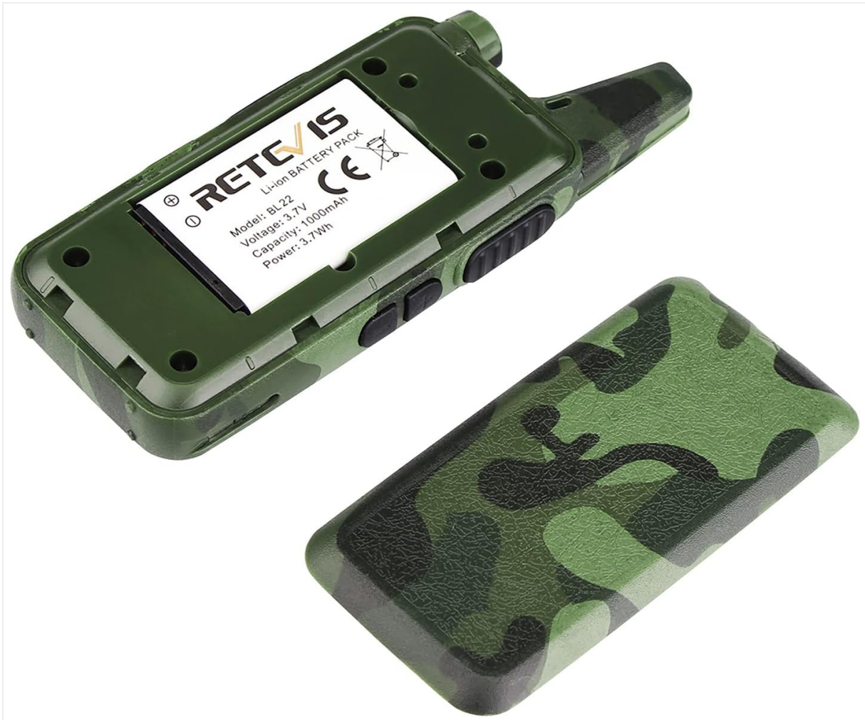
Image 4.1: View of the Retevis RT22 radio with the battery cover removed, showing the battery and compartment.