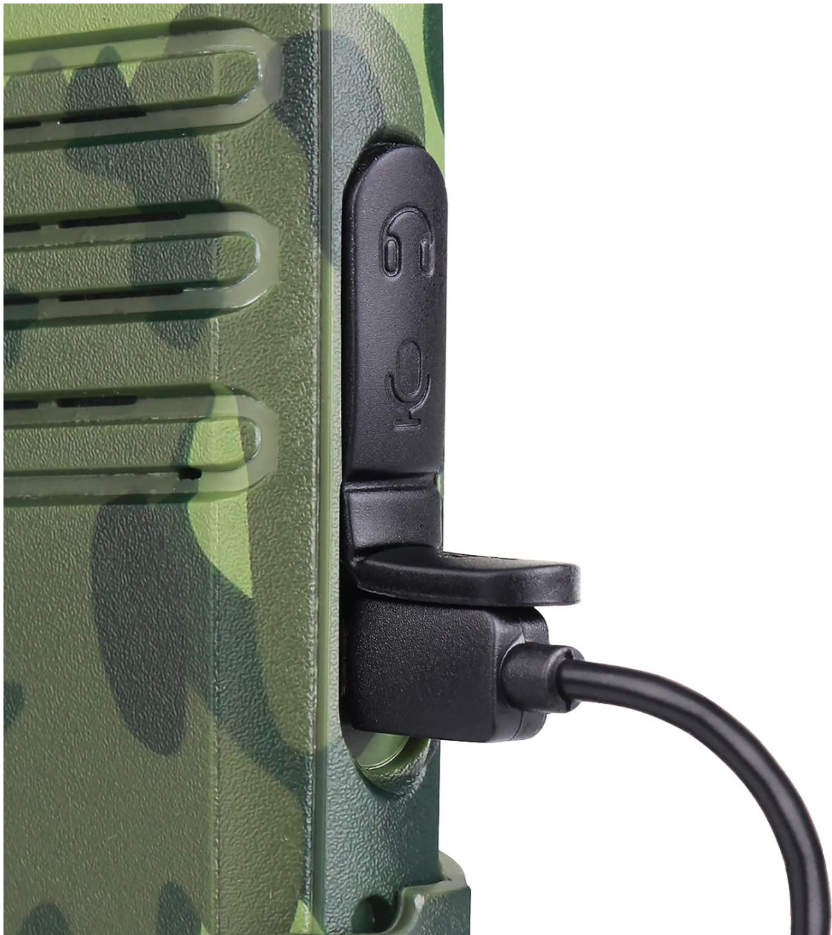
Image 4.2: A close-up view of the USB charging port on the Retevis RT22 radio with a charging cable inserted.