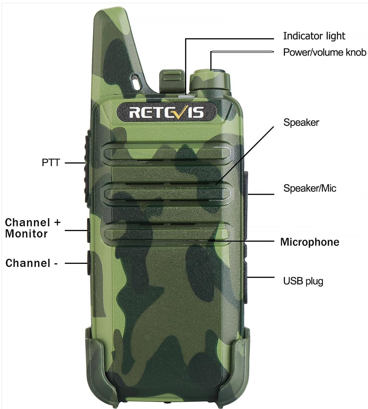
Image 3.1: Front view of the Retevis RT22 radio, indicating the indicator light, power/volume knob, speaker, PTT button, channel selection buttons, microphone, and USB plug.

Indicator Light: Displays radio status (e.g., transmitting, receiving, charging).