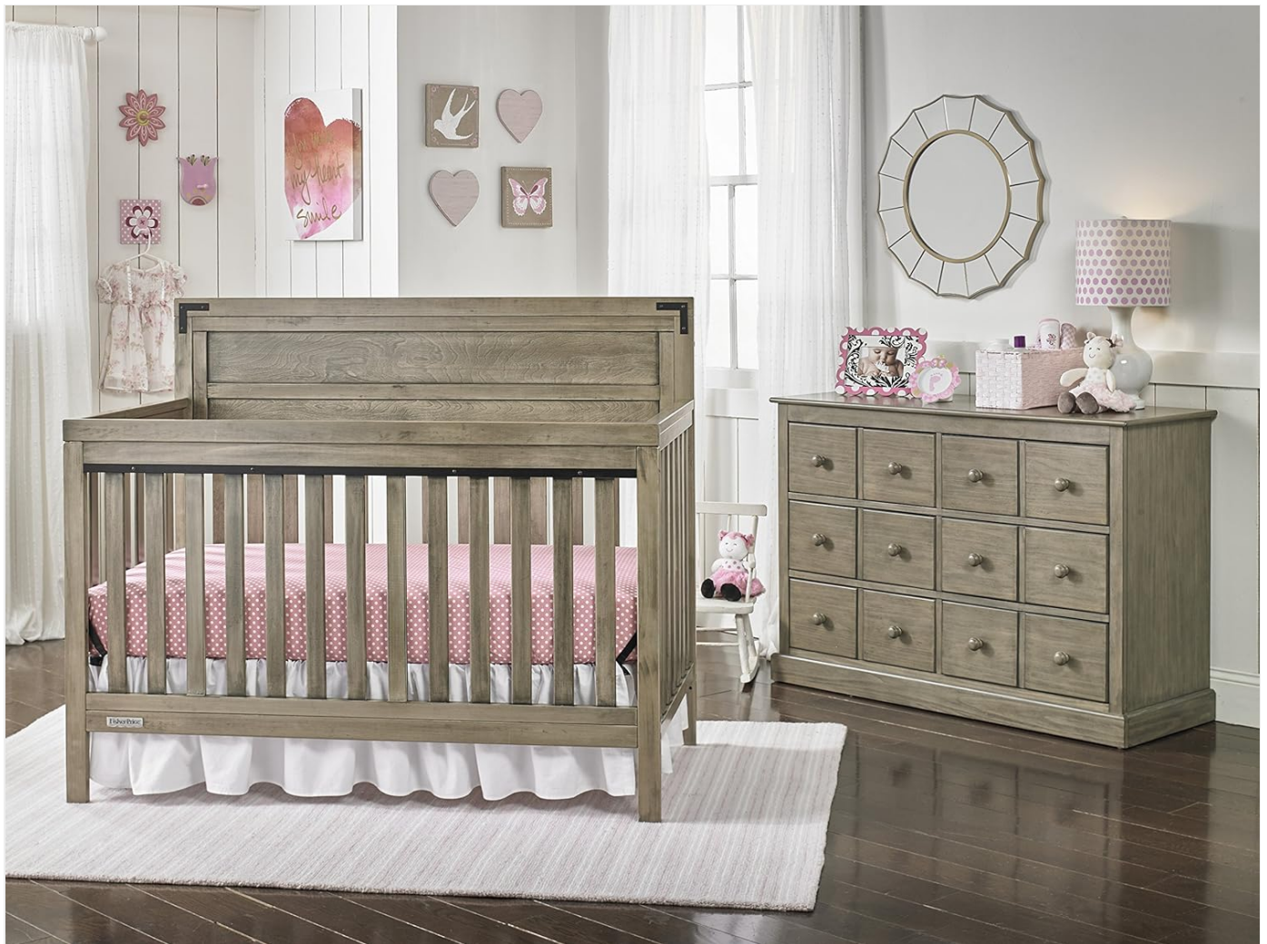
Image: The Fisher-Price Paxton crib positioned within a nursery, demonstrating its aesthetic integration with other furniture, including a matching dresser.