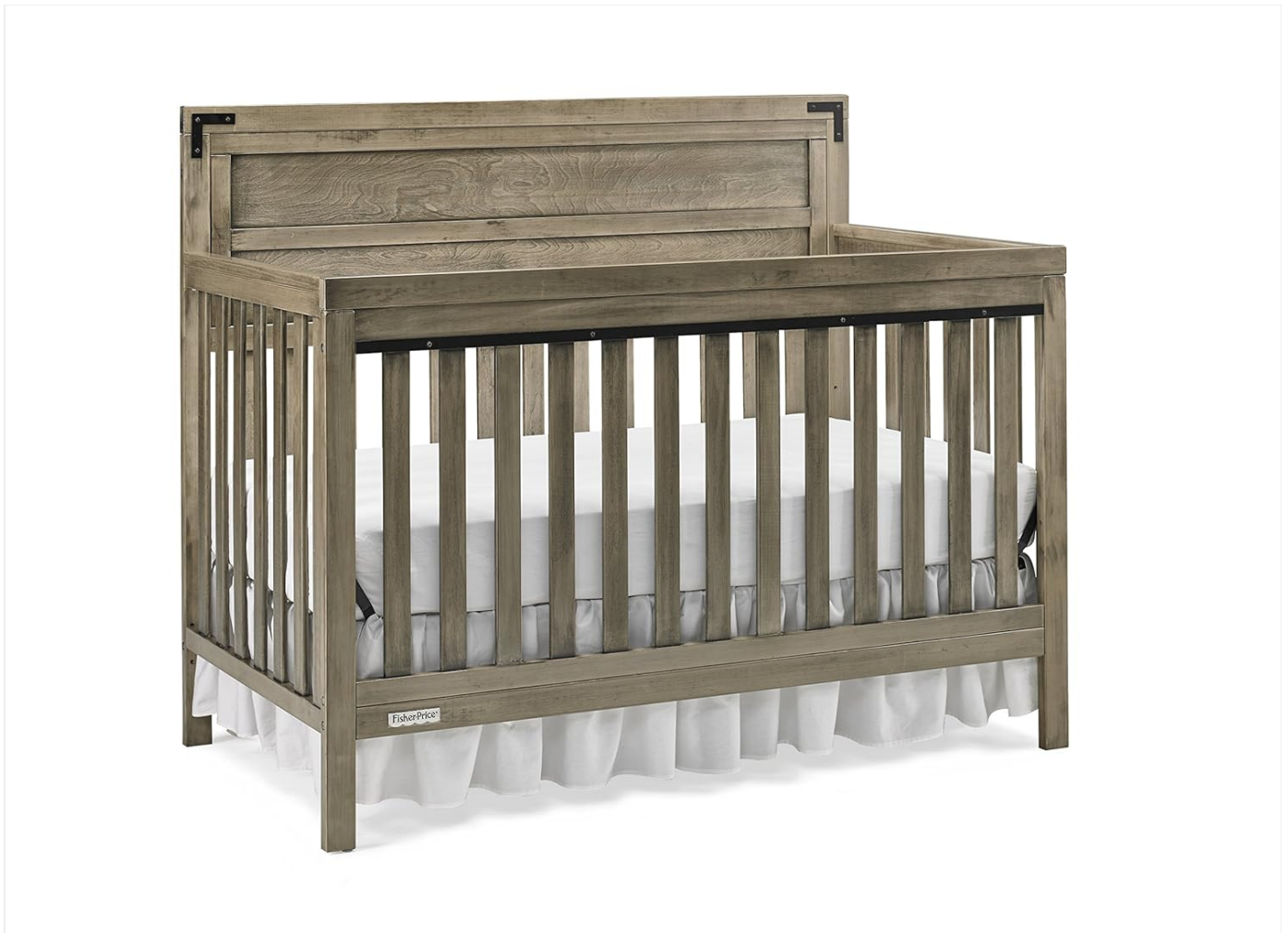
Image: An angled view of the Fisher-Price Paxton crib, illustrating its full structure and the placement of the mattress, useful for assembly reference.