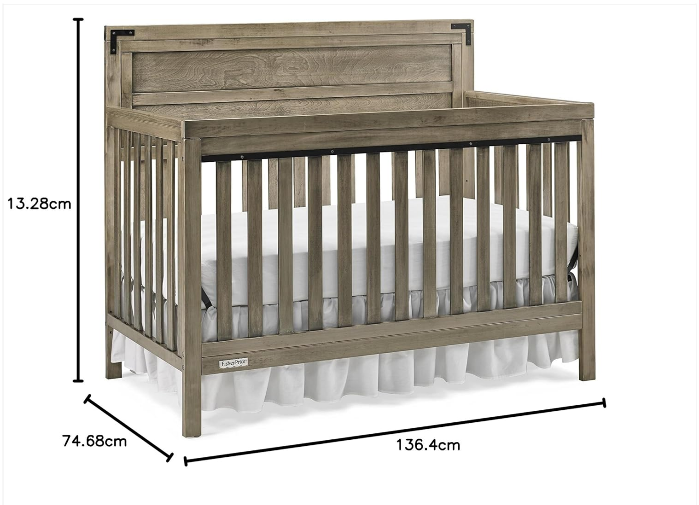
Image: A diagram illustrating the key dimensions of the Fisher-Price Paxton crib, including length, width, and height, for reference during setup and space planning.