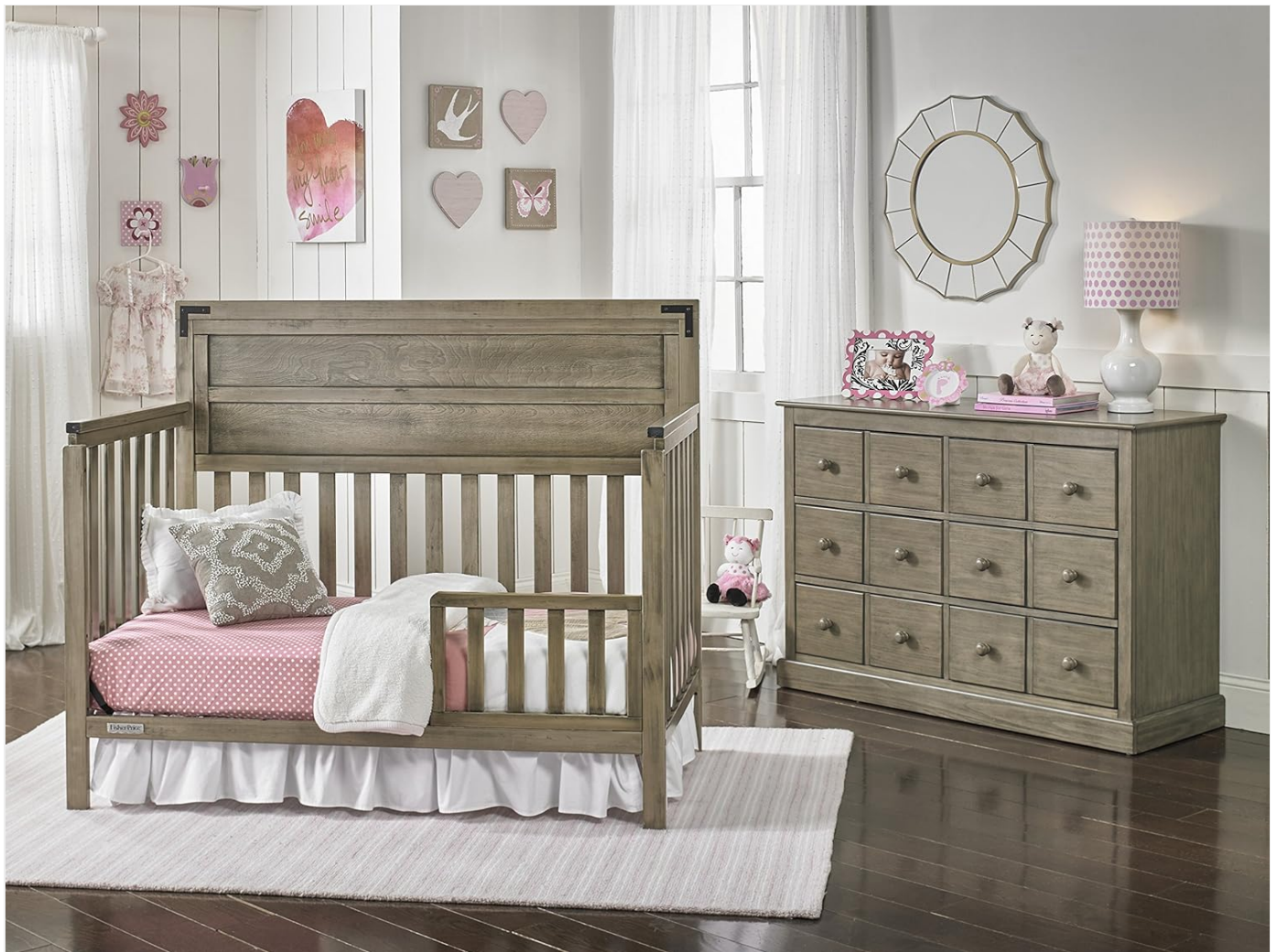
Image: The Fisher-Price Paxton crib converted into a toddler bed, featuring a low side rail for easy access and a child-friendly design.