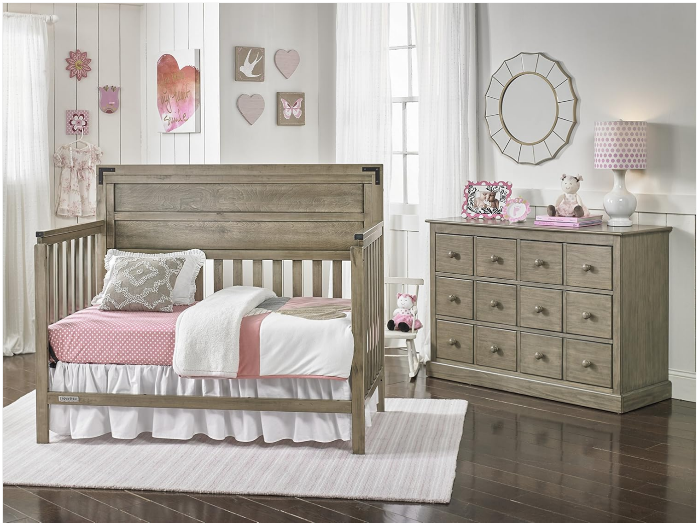
Image: The Fisher-Price Paxton crib configured as a daybed, showing an open front for easy access and a more mature appearance suitable for a child's room.