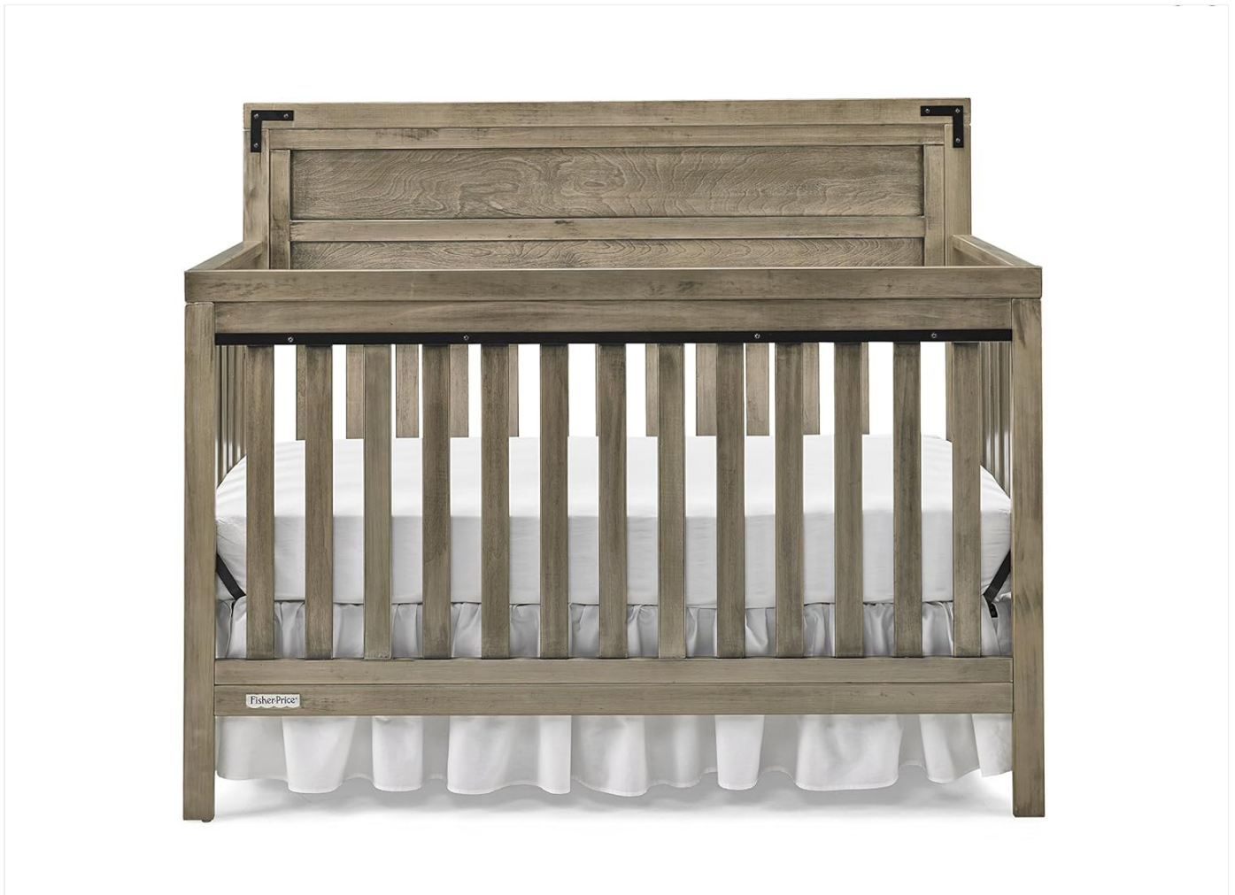
Image: The Fisher-Price Paxton 4-in-1 Convertible Crib in its standard crib configuration, showcasing its Vintage Grey finish and sturdy wooden construction.