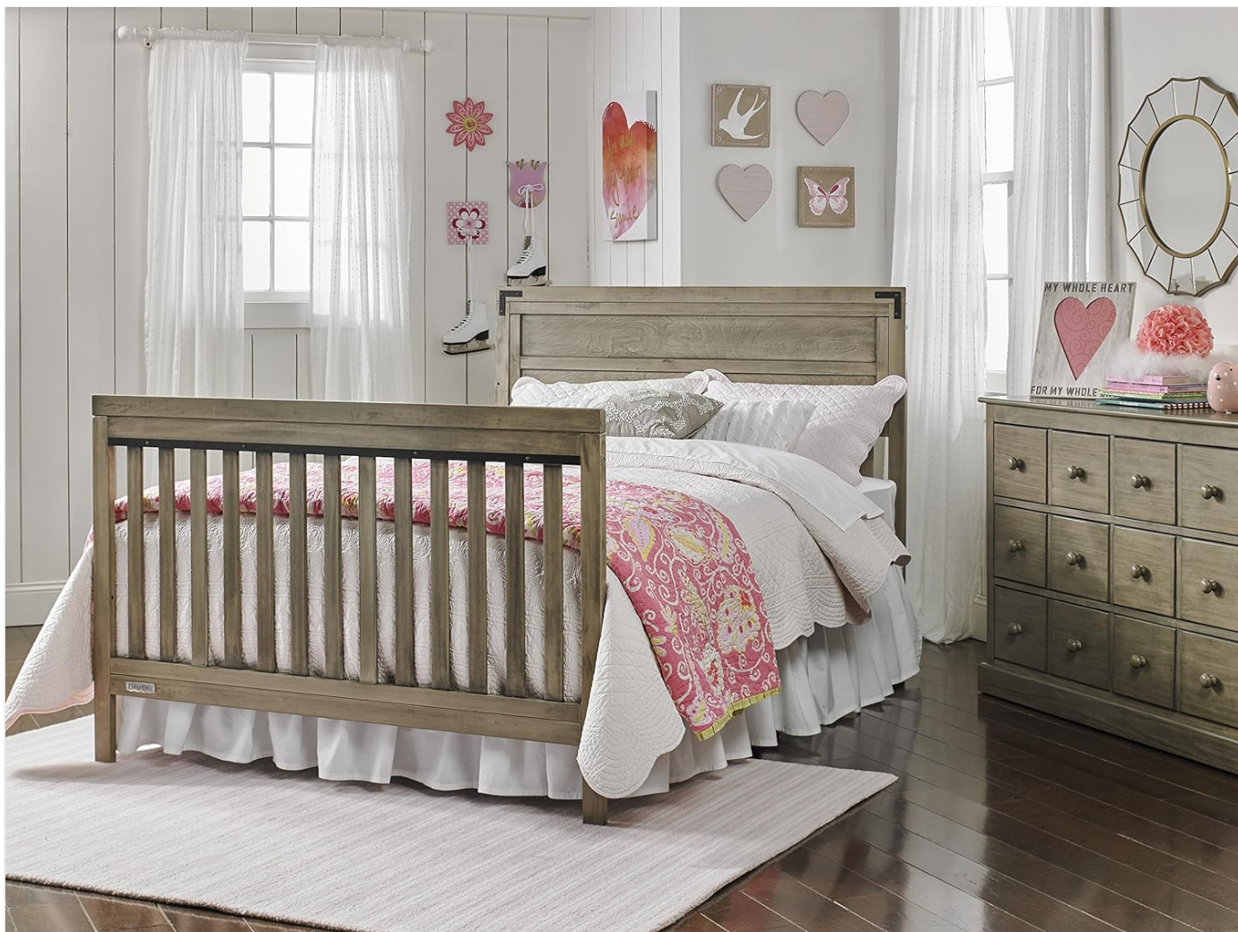
Image: The Fisher-Price Paxton crib components used to form a full-size bed, demonstrating the long-term usability and adaptability of the furniture.