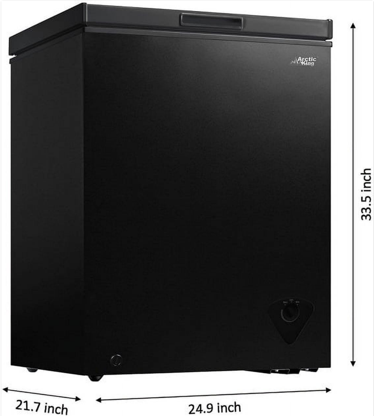
Image: Diagram showing the dimensions of the Arctic King 5.0 Cu.ft Chest Freezer. Height is 33.5 inches, width is 24.9 inches, and depth is 21.7 inches.