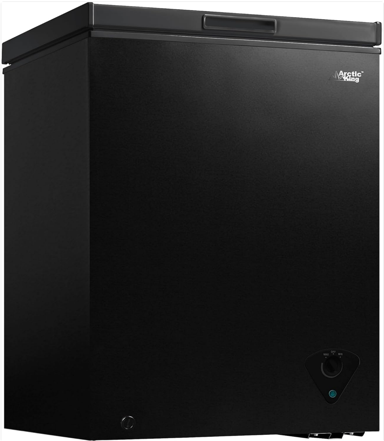
Image: Front view of the Arctic King 5.0 Cu.ft Chest Freezer with the lid closed, showcasing its compact black design and the thermostat dial on the lower right.