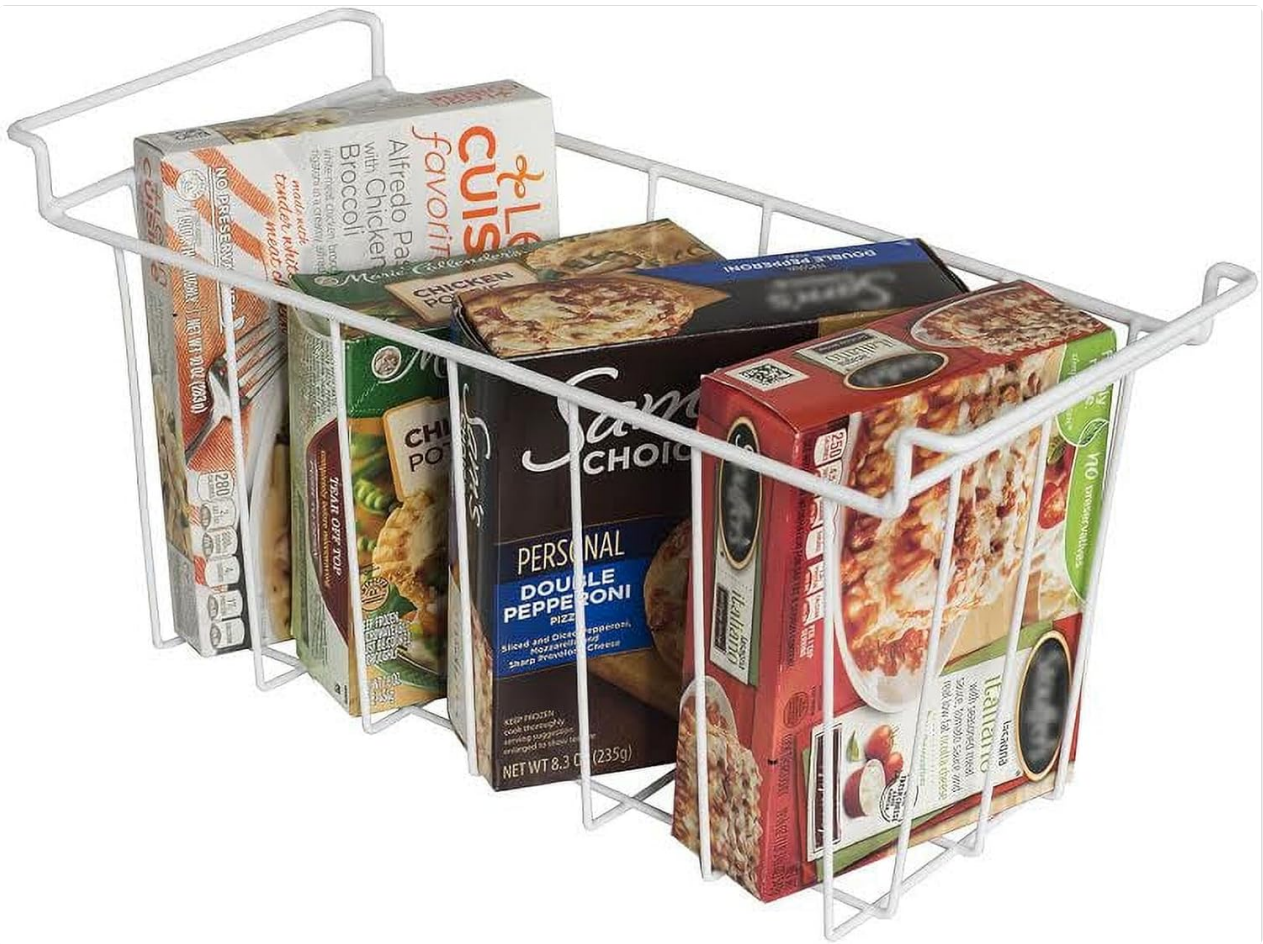
Image: A white wire storage basket filled with various frozen food packages, demonstrating its utility for organizing contents within the freezer.