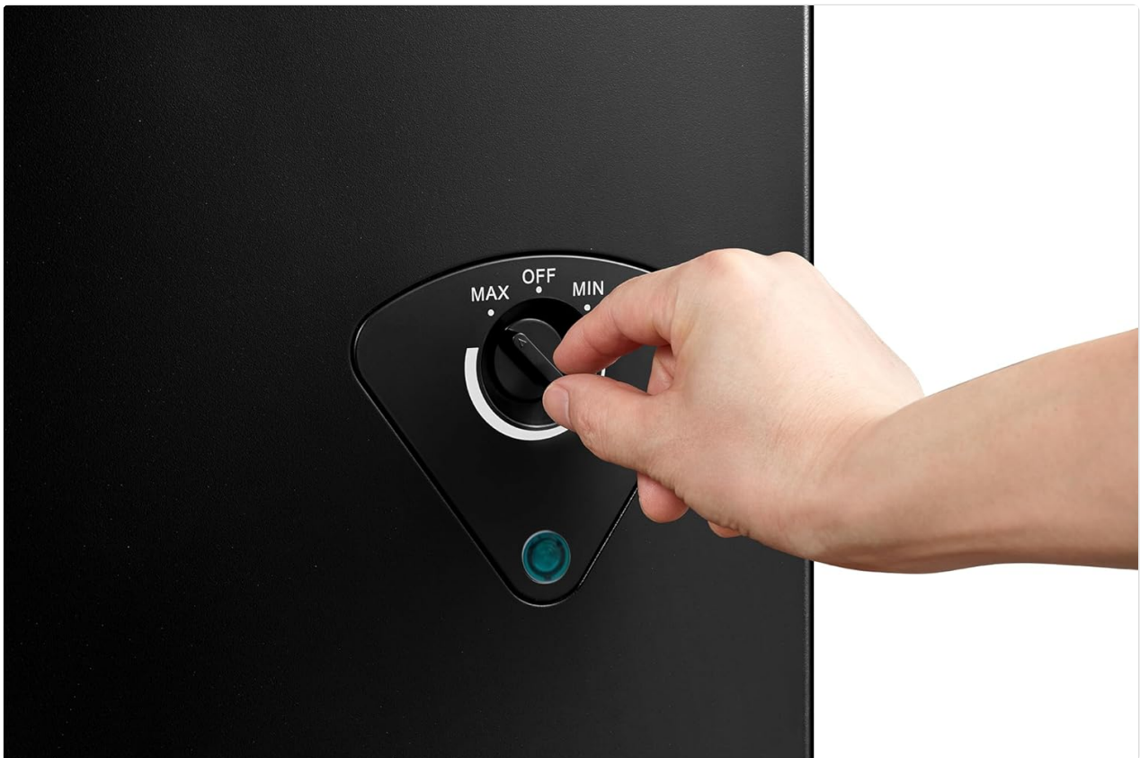
Image: A hand turning the thermostat dial on the front of the Arctic King Chest Freezer, showing the "MIN", "OFF", and "MAX" settings.

The recommended operating temperature range is approximately -10.4°F to -11.2°F (-12°C to -24°C).