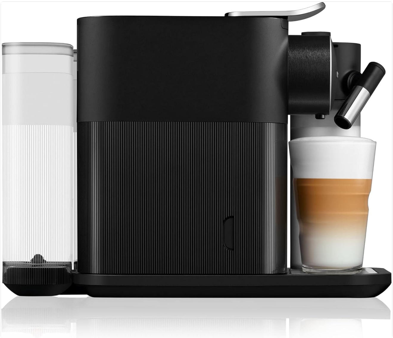
Image: A side view of the Nespresso Lattissima EN560.B machine, highlighting the transparent water tank on the left and the detachable milk frother on the right, ready for use.