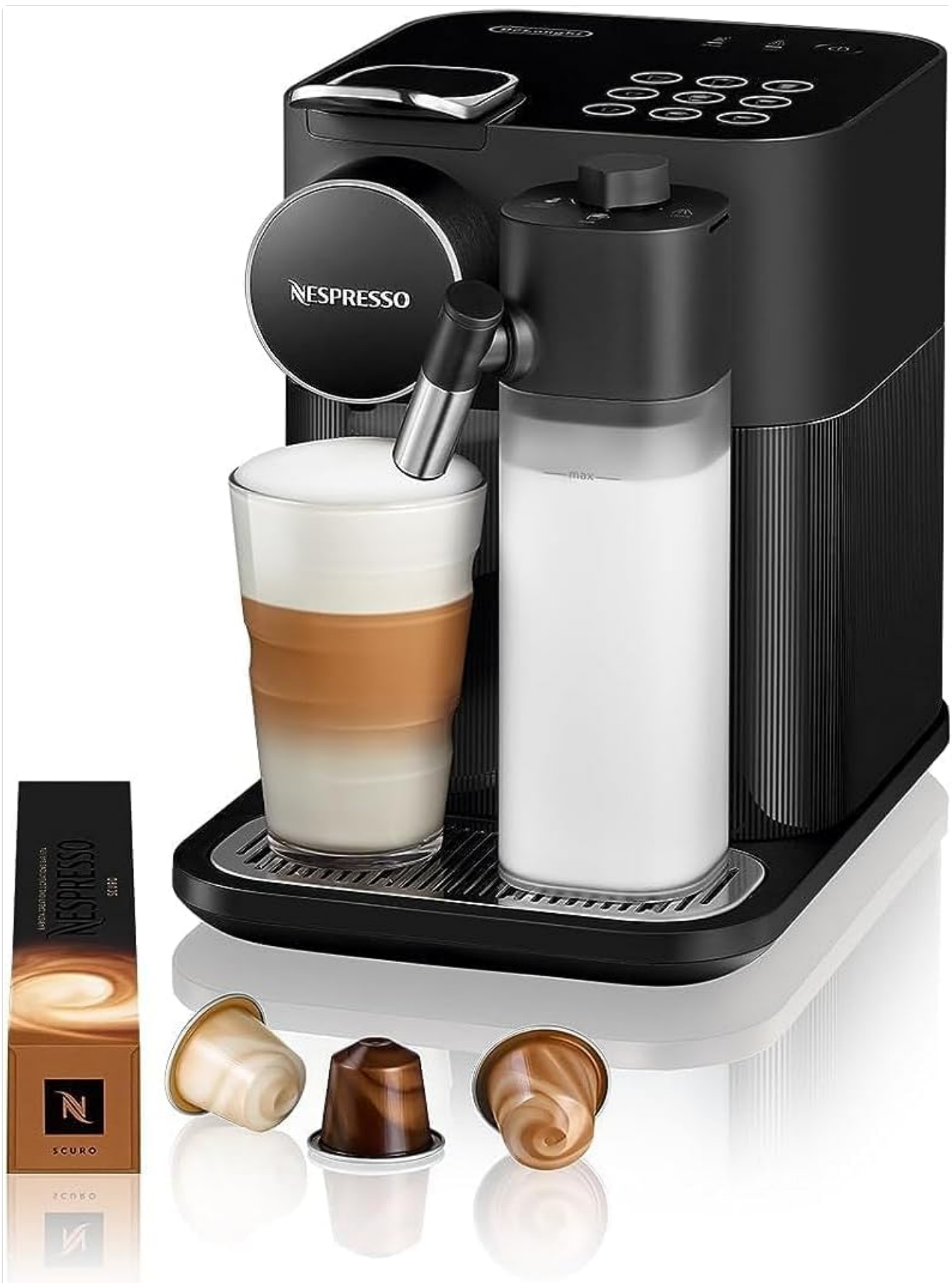
Image: The Nespresso Lattissima EN560.B machine in black, showcasing its sleek design, milk frother, and a prepared latte macchiato. Various Nespresso capsules are displayed in the foreground.