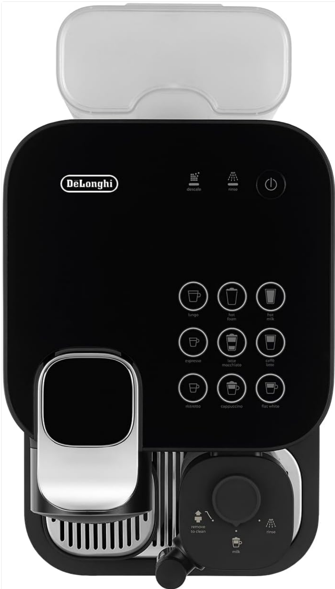
Image: An overhead view of the Nespresso Lattissima EN560.B's control panel, clearly showing the power button, descaling and rinse indicators, and the six tactile buttons for various coffee and milk recipes.