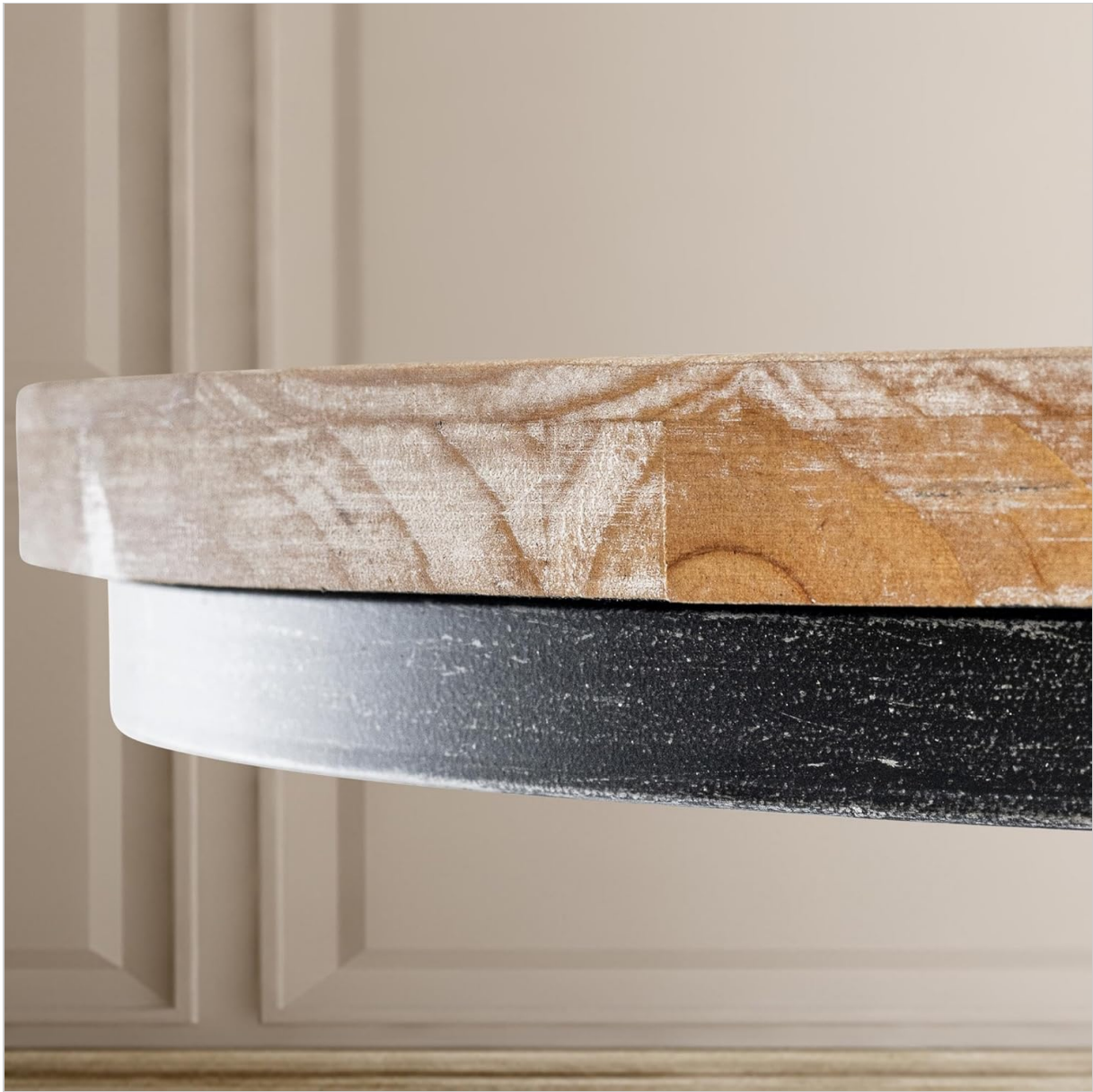
Figure 7: Detail of the pine wood tabletop, highlighting its texture and finish.