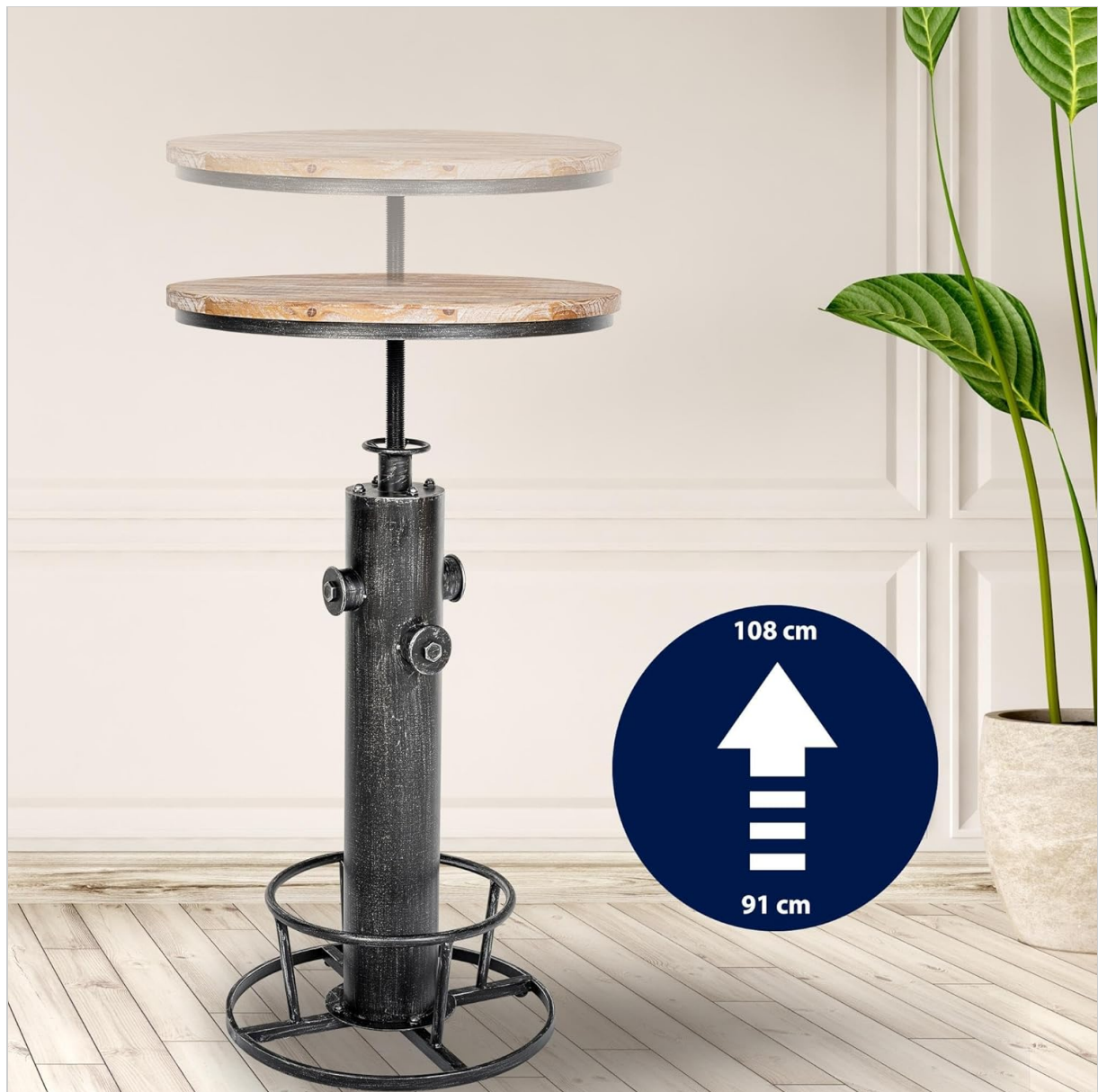
Figure 5: Visual representation of the table's adjustable height feature.