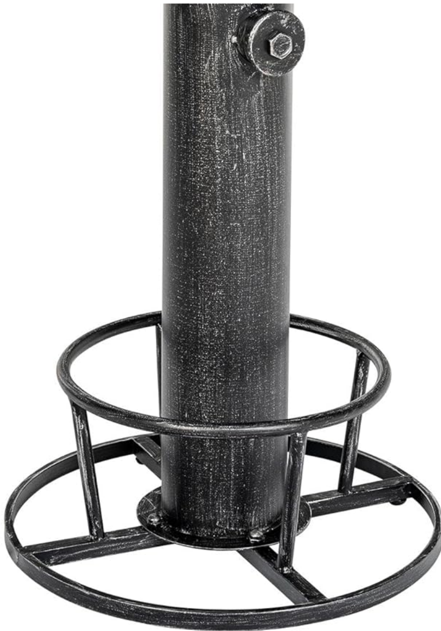
Figure 1: CLP Ruhr Bar Table in Argent Antique finish.