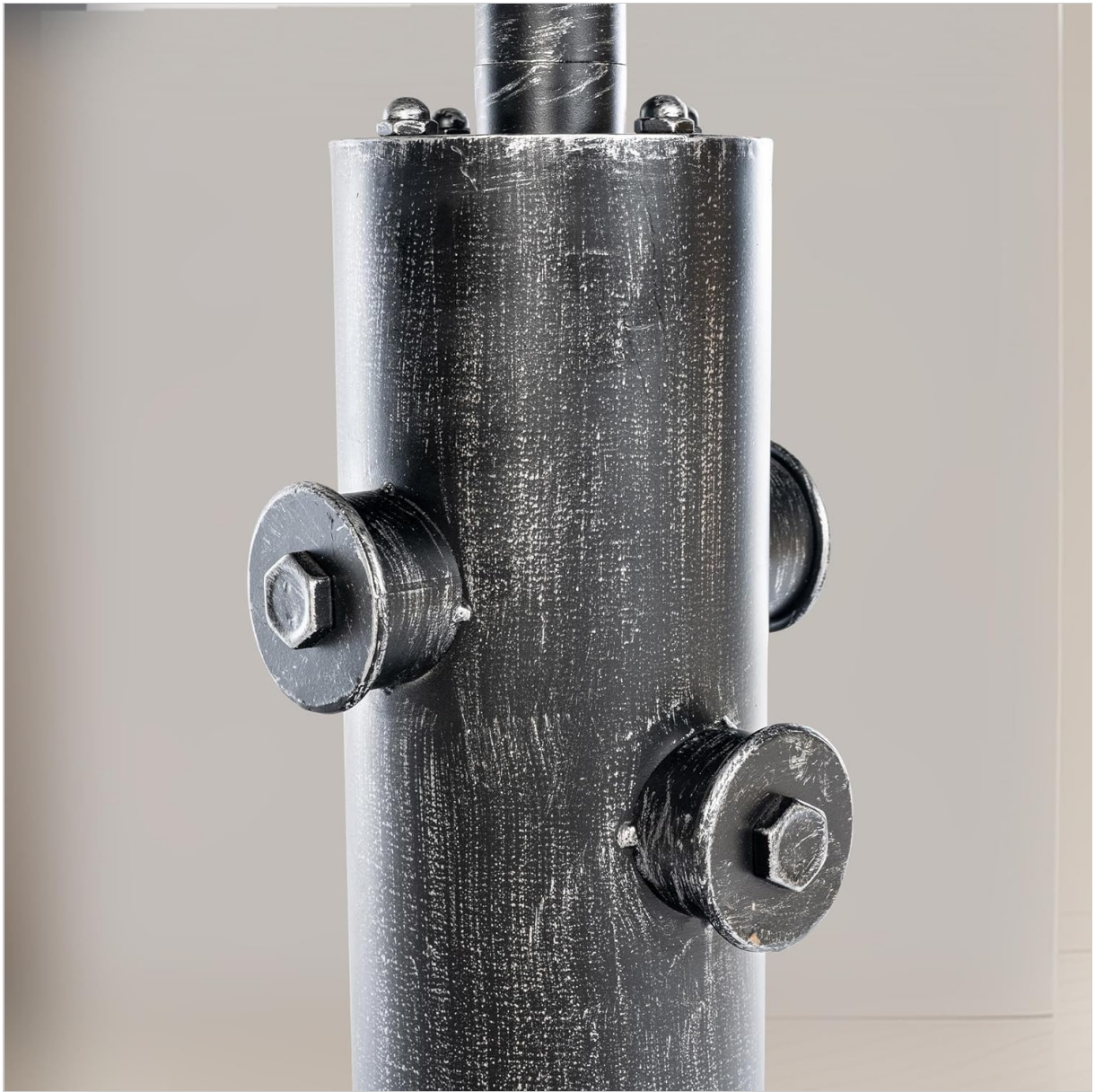
Figure 3: Detail of the robust metal base and integrated footrest.