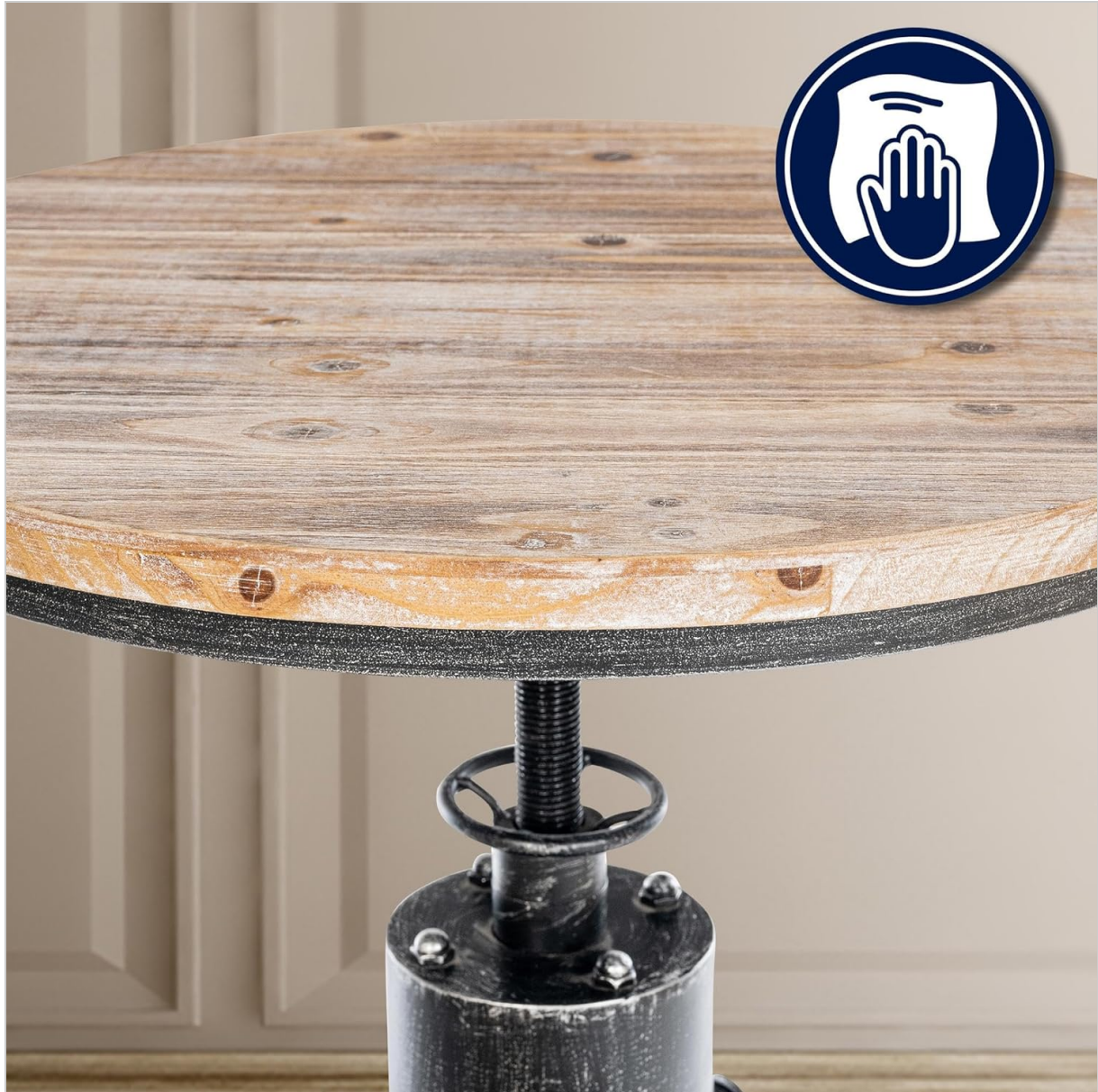
Figure 6: Cleaning recommendation for the tabletop.