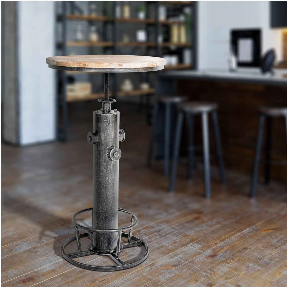
Figure 2: The CLP Ruhr Bar Table integrated into a modern interior.