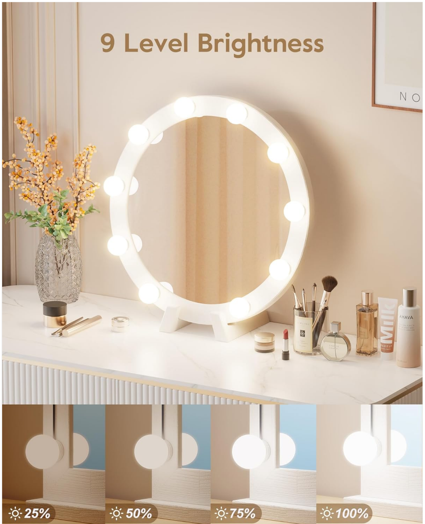
Image 5.1: Visual representation of the 9-level brightness adjustment feature, demonstrating varying light intensities.