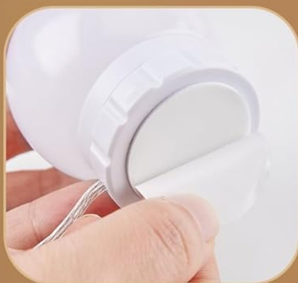
High quality tapes