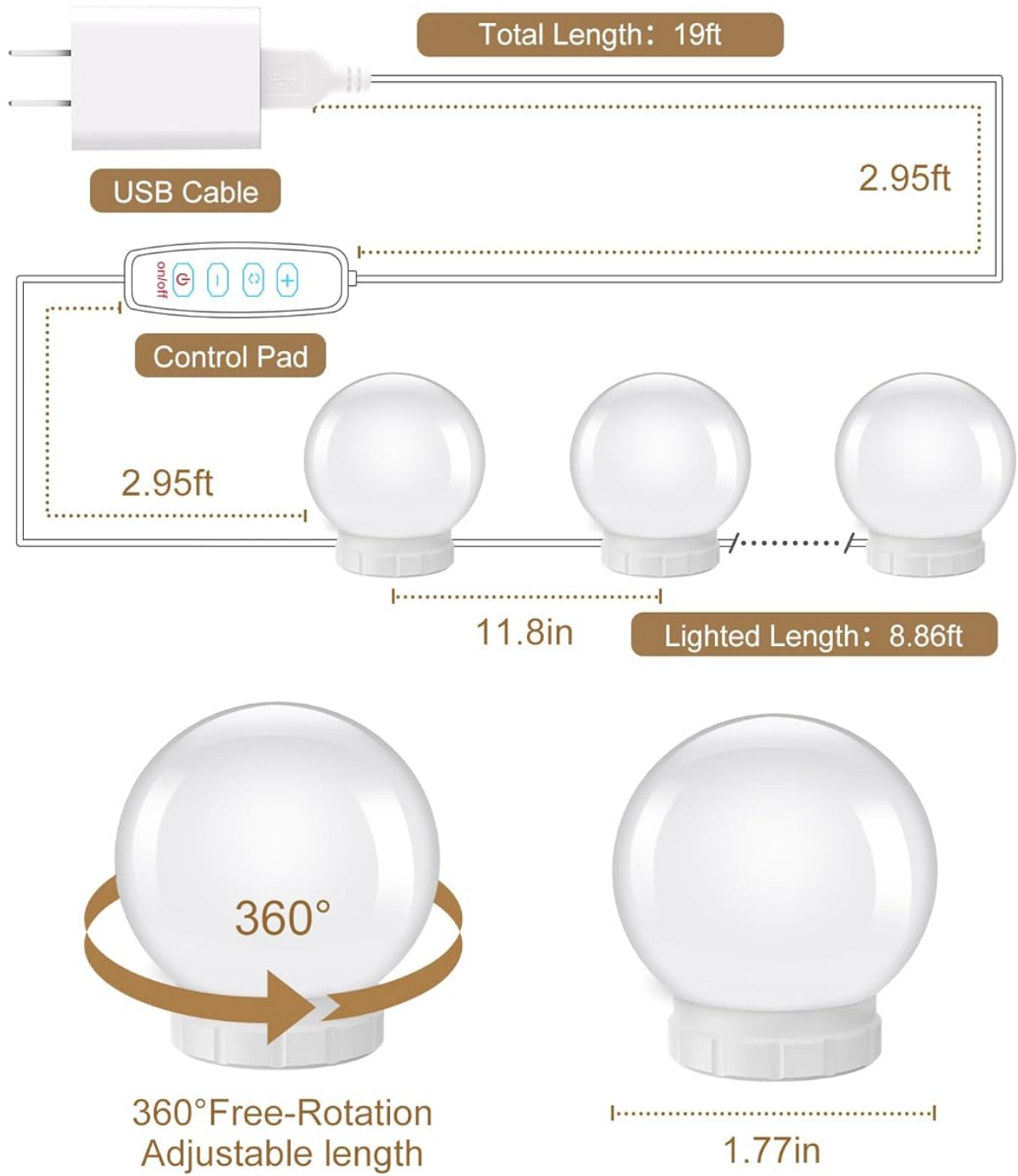
Image 8.1: Technical diagram illustrating key dimensions and components of the Brighttown LED Vanity Lights Kit.