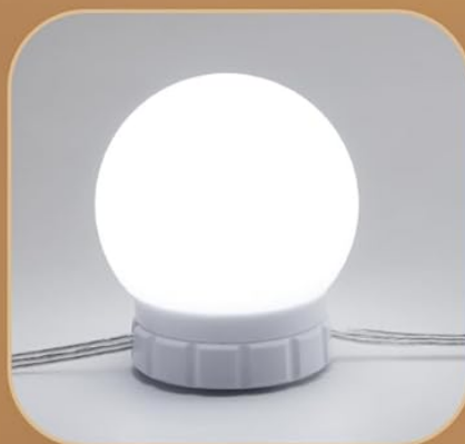
Low temperature surface