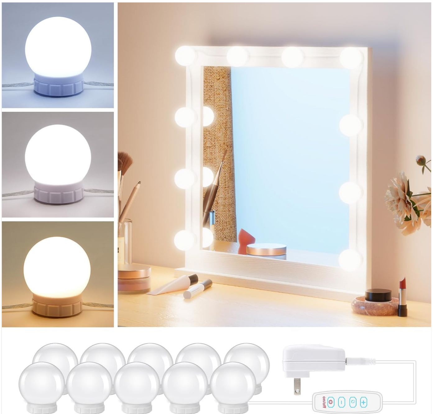
Image 1.1: Brighttown Hollywood Style LED Vanity Mirror Lights Kit components, including 10 bulbs, power adapter, and control pad. The image also shows the lights installed on a mirror and different light color options.