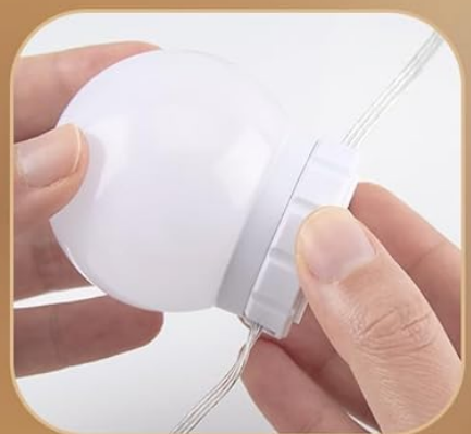
Wires can be hidden