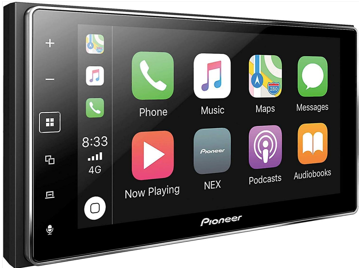
Image 4.1.1: Front view of the Pioneer MVH-1400NEX Digital Multimedia Receiver, showcasing its 6.2-inch touchscreen display with the Apple CarPlay interface active. The screen shows icons for Phone, Music, Maps, Messages, Now Playing, NEX, Podcasts, and Audiobooks, along with volume controls and other function buttons on the left bezel.