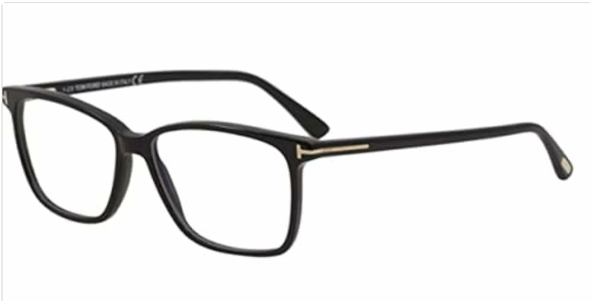
Image: Front view of the Tom Ford FT 5478-B 001 Shiny Black Eyeglasses, showcasing the square frame and blue light block lenses.

The Tom Ford FT 5478-B 001 Shiny Black Eyeglasses are designed for comfort and style, featuring a square shape and a full-rim acetate frame. These eyeglasses are equipped with blue light block lenses, intended to reduce eye strain from digital screens. This manual provides essential information for the proper setup, use, and maintenance of your new eyeglasses.