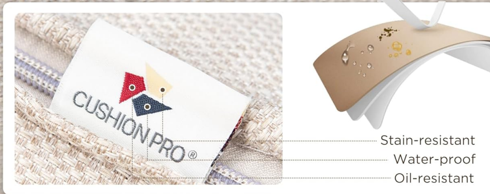
Image: Close-up of the cushion fabric highlighting its waterproof, oil-resistant, and stain-resistant features.