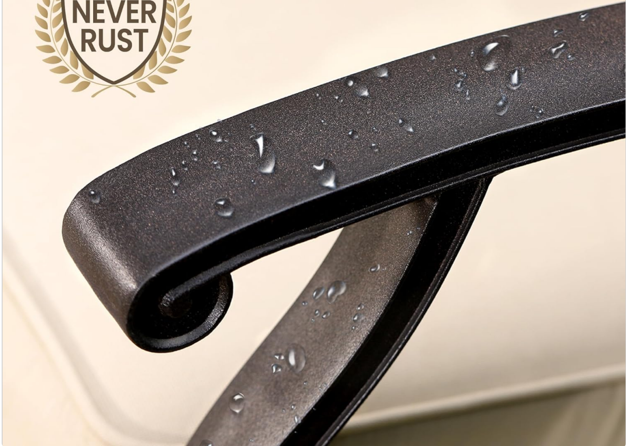
Image: Detail of the cast aluminum frame, emphasizing its waterproof and rust-free construction.