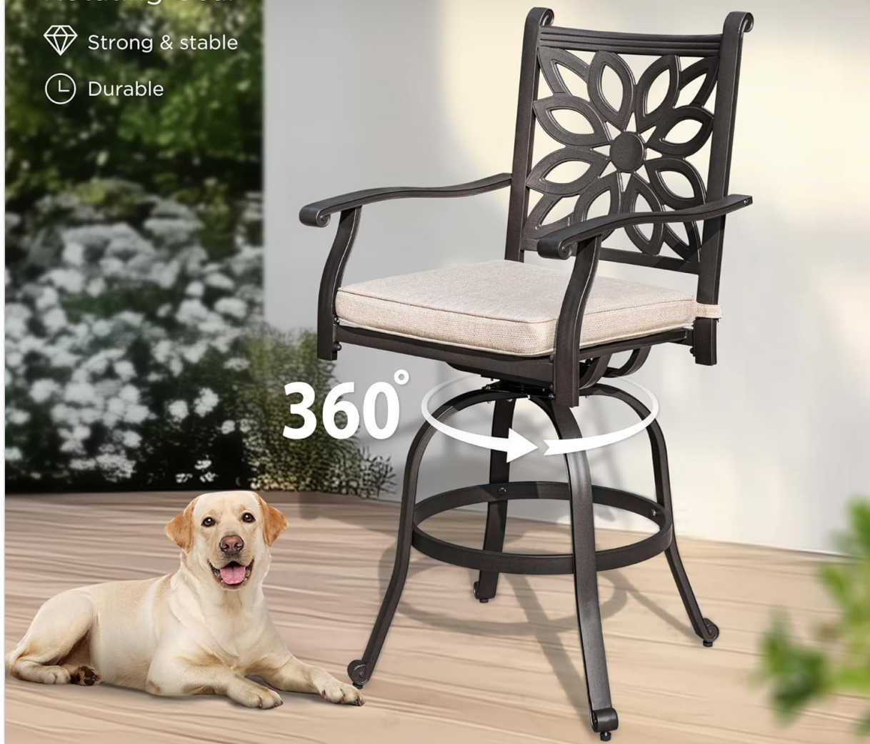
Image: Visual representation of the 360-degree swivel function.