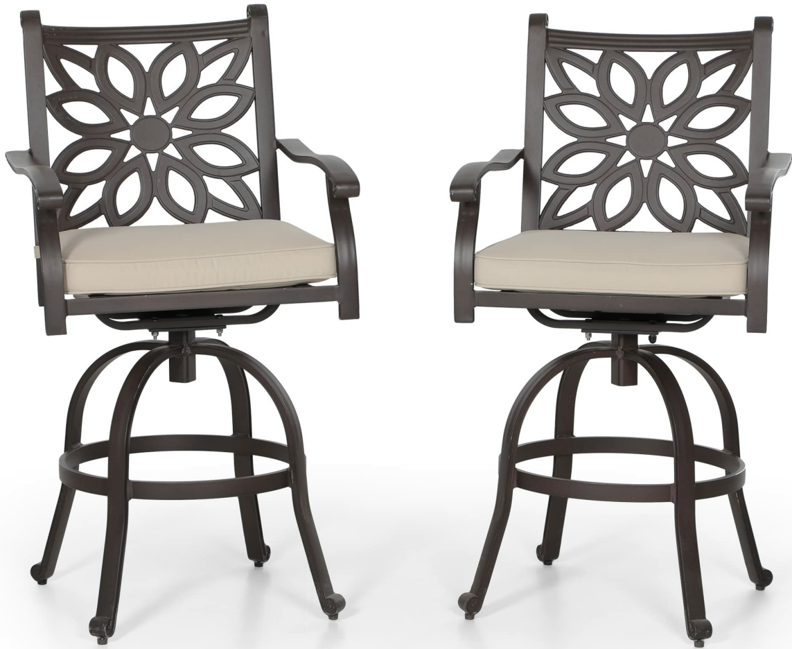
Image: PHI VILLA Outdoor Swivel Bar Stool with cushion, showing the complete product.