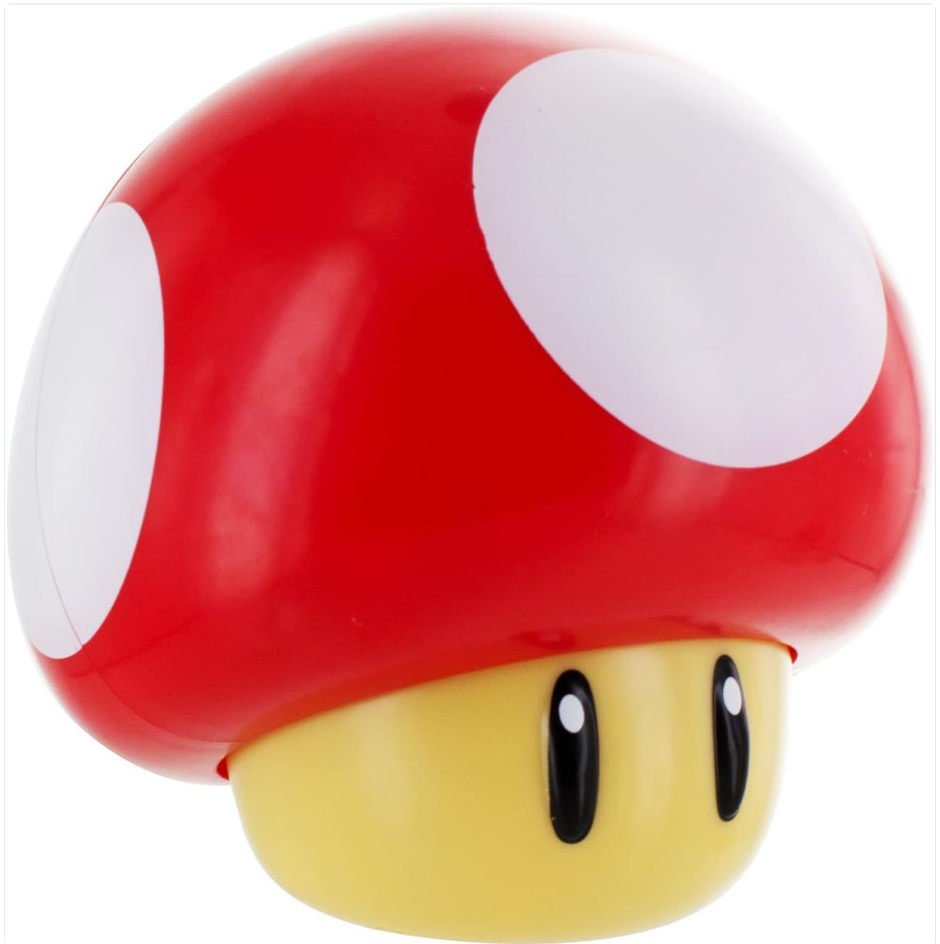
Image: The Paladone Super Mario Bros Mushroom Light, showcasing its classic red and white design.