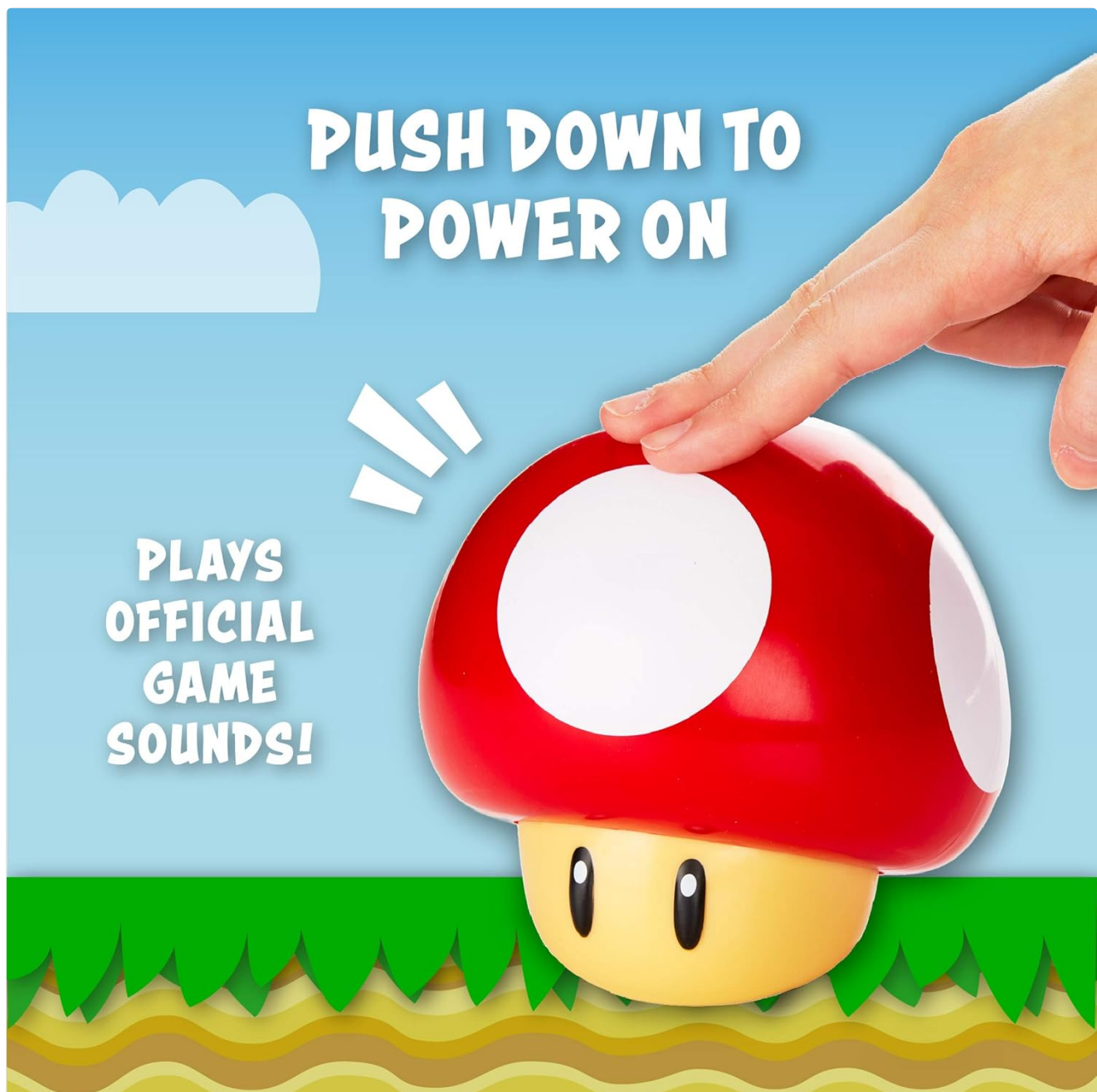
Image: Illustrates the action of pressing the mushroom light to power it on and trigger the sound effect.