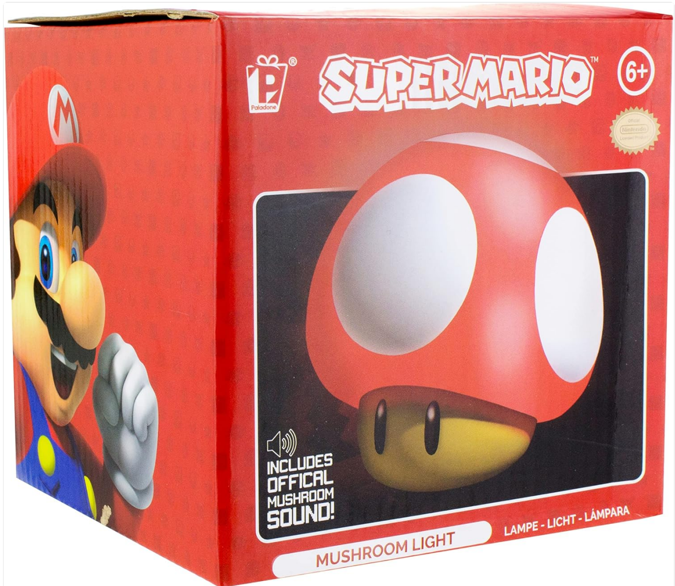
Image: The product packaging, indicating the included mushroom light and official branding.

Note: 2 x AAA batteries are required and are not included in the package.