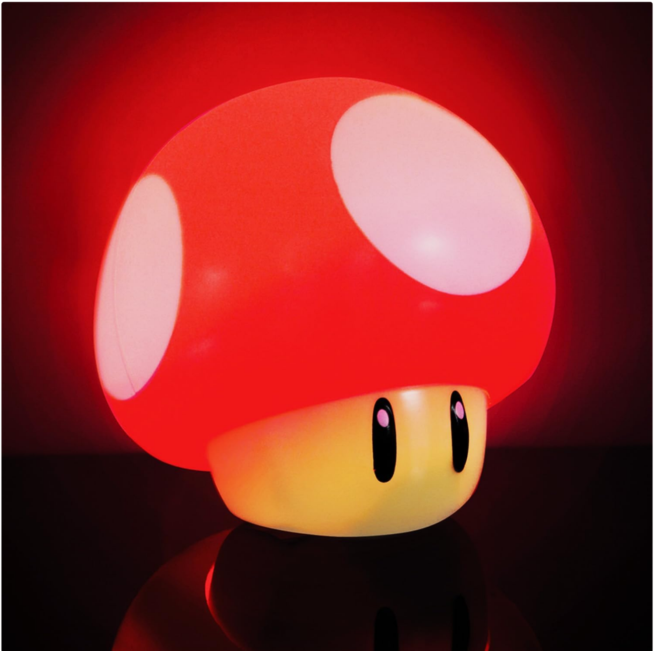
Image: The mushroom light glowing red, demonstrating its function as a night light.