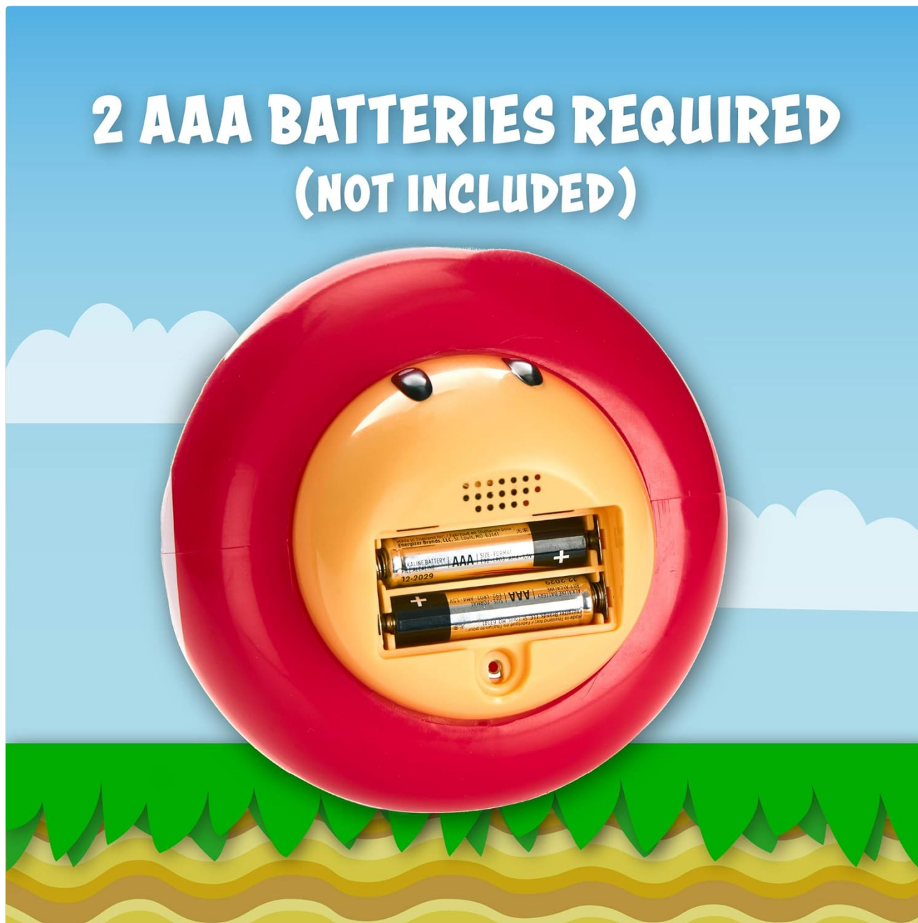
Image: The base of the mushroom light with the battery compartment visible, indicating where to insert AAA batteries.