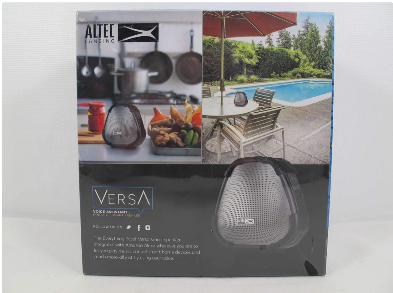
Front of product packaging.