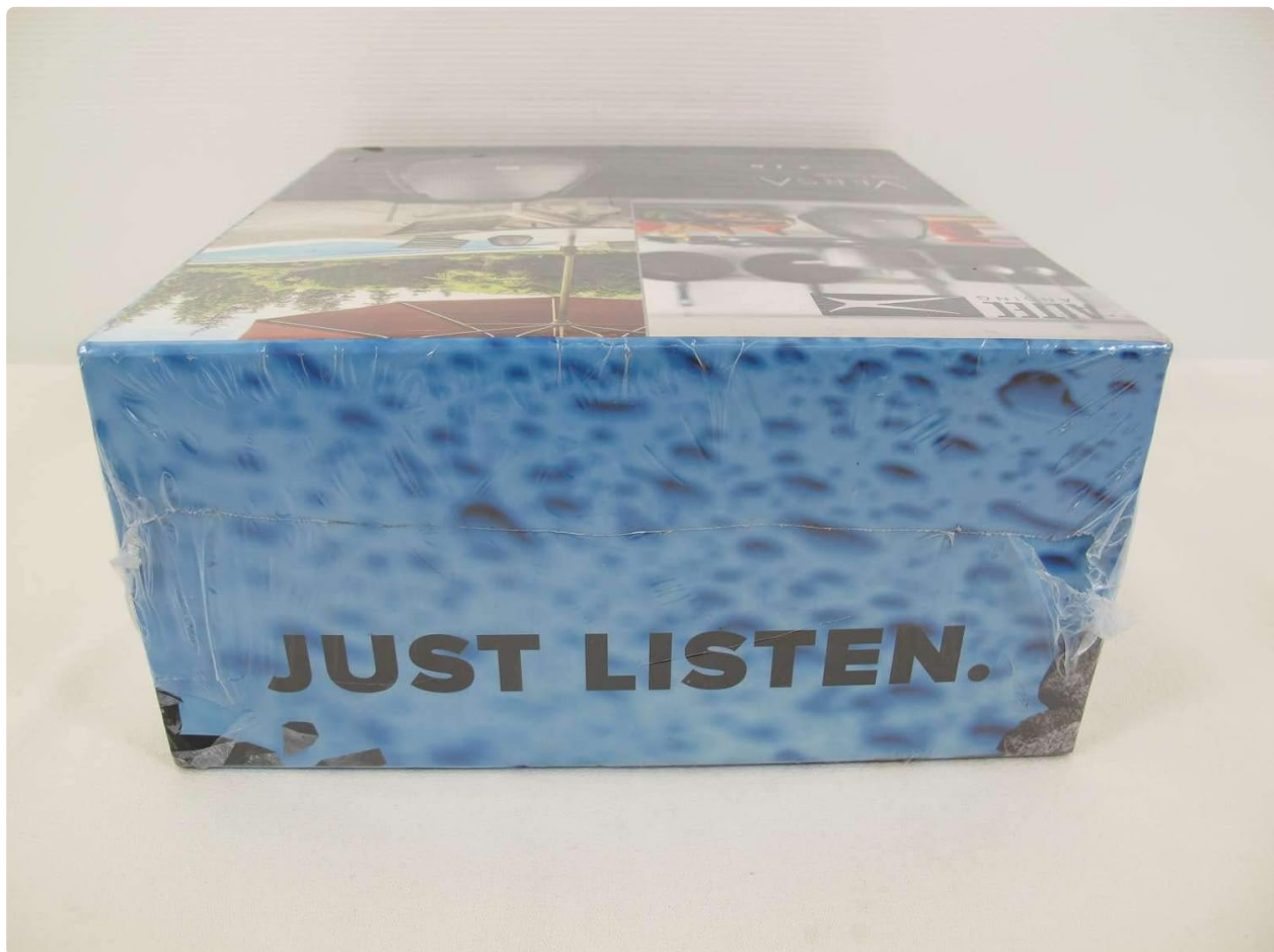
Top view with package contents and contact information.