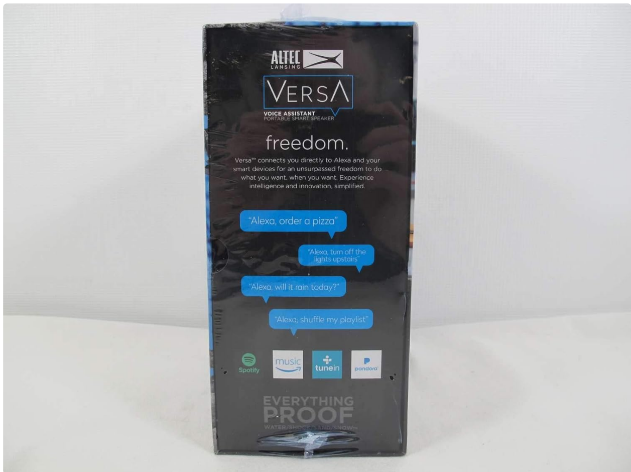
Side view highlighting features.