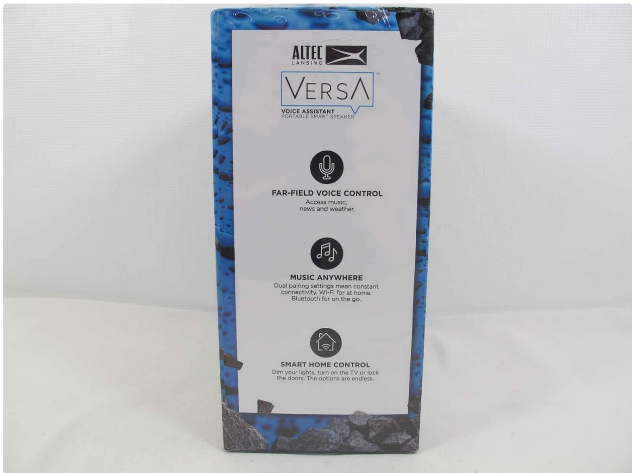
Back of product packaging.