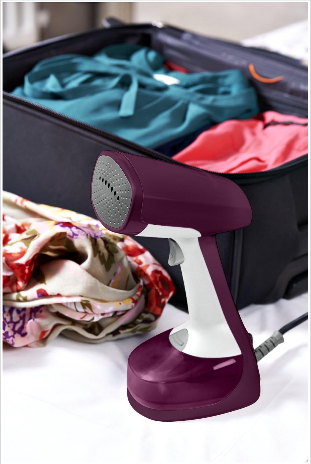
The Rowenta Xcel Steam Travel DR7051 is compact and designed for easy packing, fitting seamlessly into travel bags or suitcases.