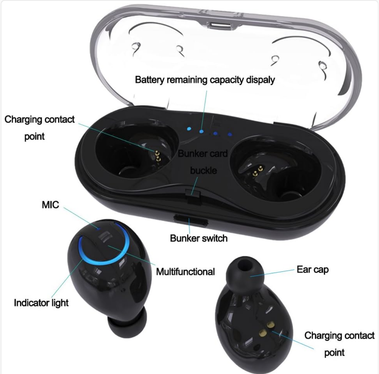
Figure 1: Earbuds and Charging Case Components. This image displays the HBQ-Q18 earbuds and their charging case, with key parts labeled. These include the indicator light, multifunctional button, microphone (MIC), ear cap, charging contact points on the earbuds, and within the case, the battery remaining capacity display, charging contact points, bunker card buckle, and bunker switch.