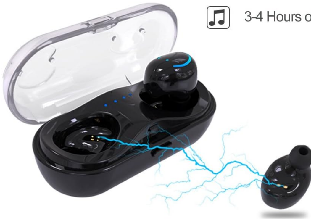
Figure 3: Battery and Charging Information. This graphic illustrates the approximate battery life for calls (4-5 hours), charging time (1-2 hours), and music playback (3-4 hours) for the HBQ-Q18 earbuds.