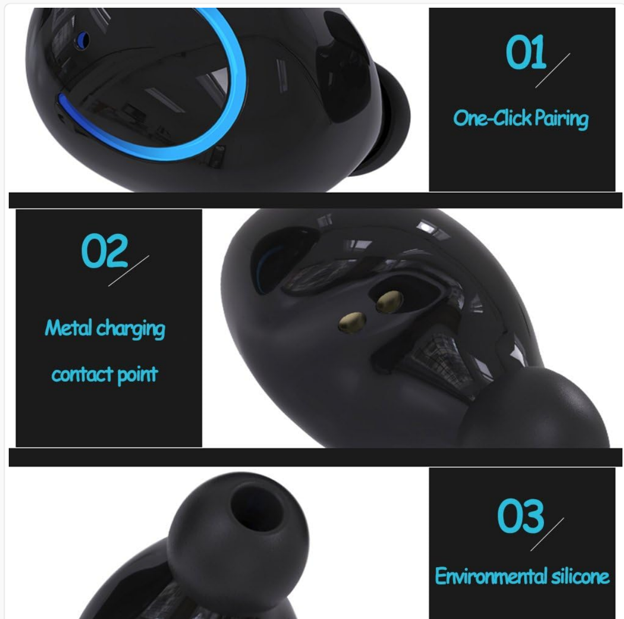
Figure 4: One-Click Pairing. This image highlights the "One-Click Pairing" feature, indicating the simplicity of connecting the earbuds to your device.

The earbuds can be used together for stereo sound or individually (unilateral use). If using only one earbud, simply take one out of the case and pair it as described above.