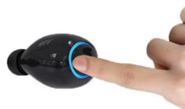
Figure 5: Touch Control Functions. This diagram illustrates the various touch controls available on the HBQ-Q18 earbuds, including Power On/Off, Pairing, Answer/End Call, Reject Call, Start/Pause music, Next track, and Next Song. It also shows icons for Touch, Sports, HiFi audio, and IPX4 Waterproof rating.