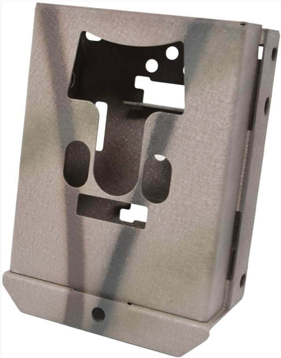
Figure 3.1: Angled view of the security box, highlighting the various mounting holes on the sides and back for flexible attachment options.