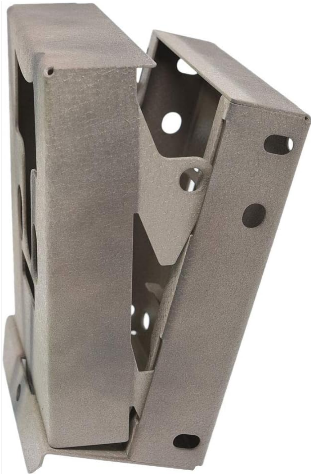
Figure 5.1: Side view of the security box in an open position, illustrating the robust hinge mechanism that allows for easy access to the camera.