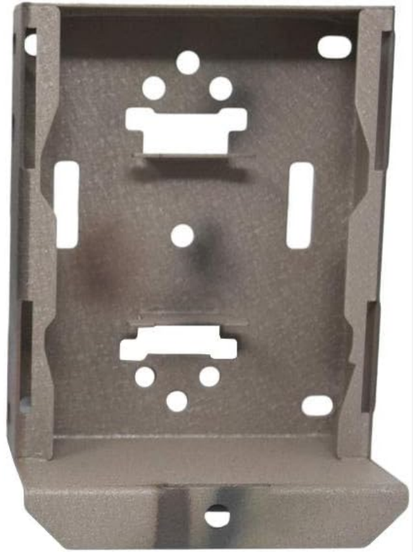
Figure 2.1: The CAMLOCKbox Security Box, shown with its front plate separated from the main body, illustrating the two primary components.