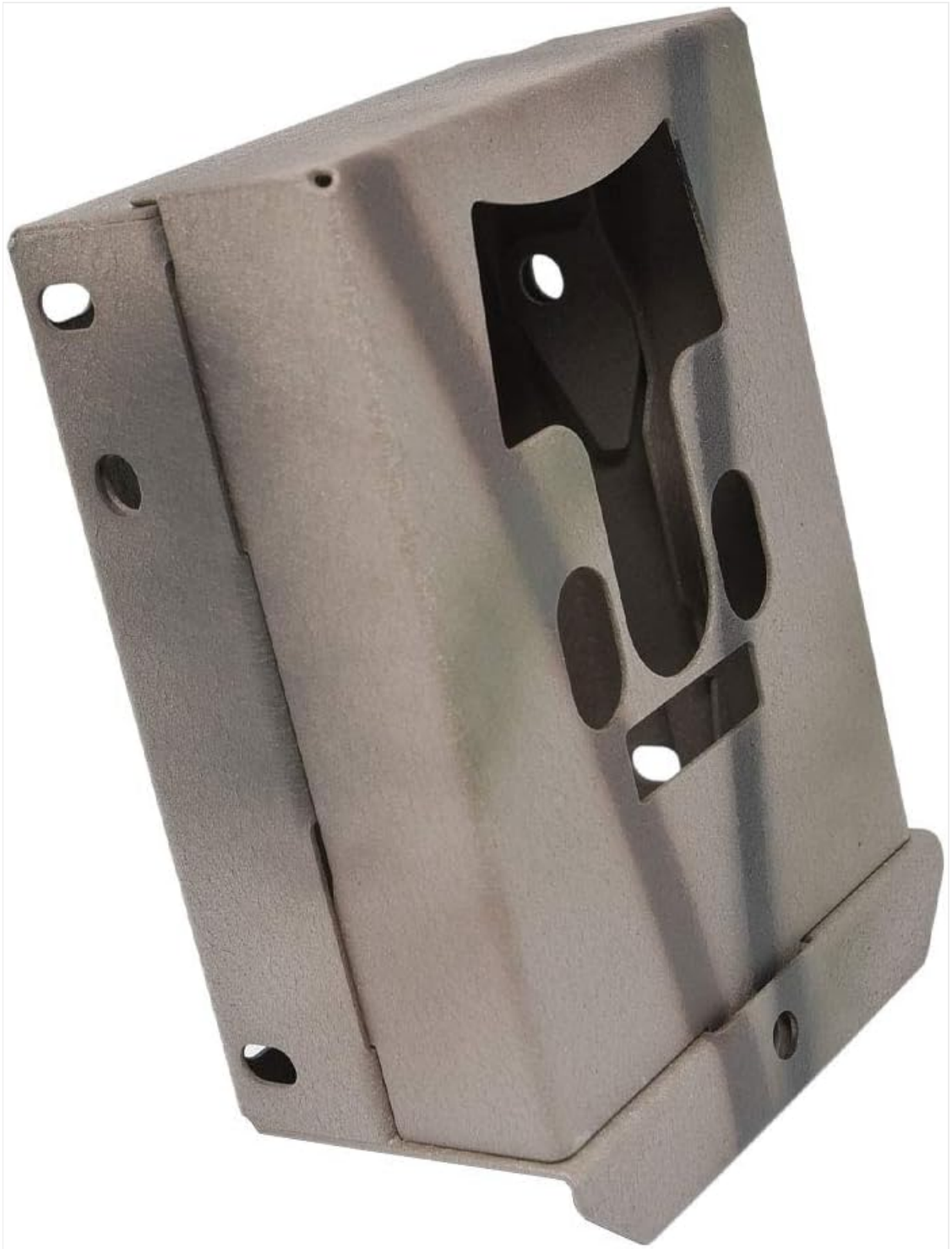
Figure 4.1: The security box shown from an angle, illustrating how it can be mounted to a tree using a strap or bolts.