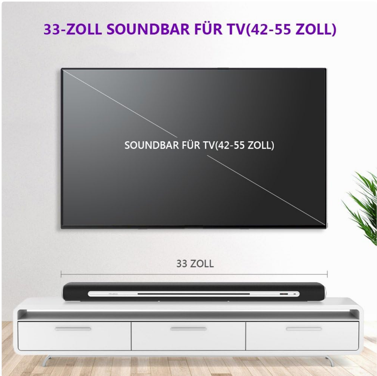
Image 8.1: The 33-inch soundbar is designed to complement TVs ranging from 42 to 55 inches.