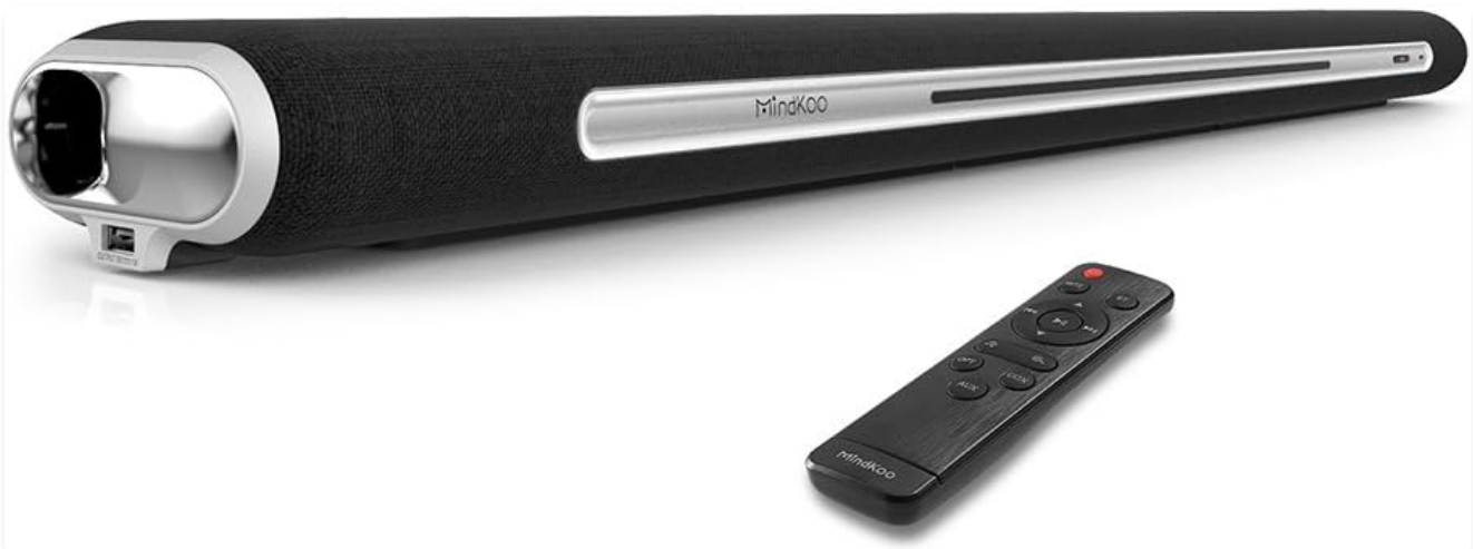
Image 1.1: The MindKoo 33-inch Bluetooth Soundbar and its remote control.

Thank you for choosing the MindKoo 33-inch Bluetooth Soundbar. This powerful 2.0 channel soundbar is designed to enhance your home entertainment experience with rich, clear audio and powerful bass. It offers versatile connectivity options, including Bluetooth for wireless streaming and wired connections via Optical, AUX, and RCA. This manual provides detailed instructions for setup, operation, maintenance, and troubleshooting to ensure you get the most out of your new soundbar.