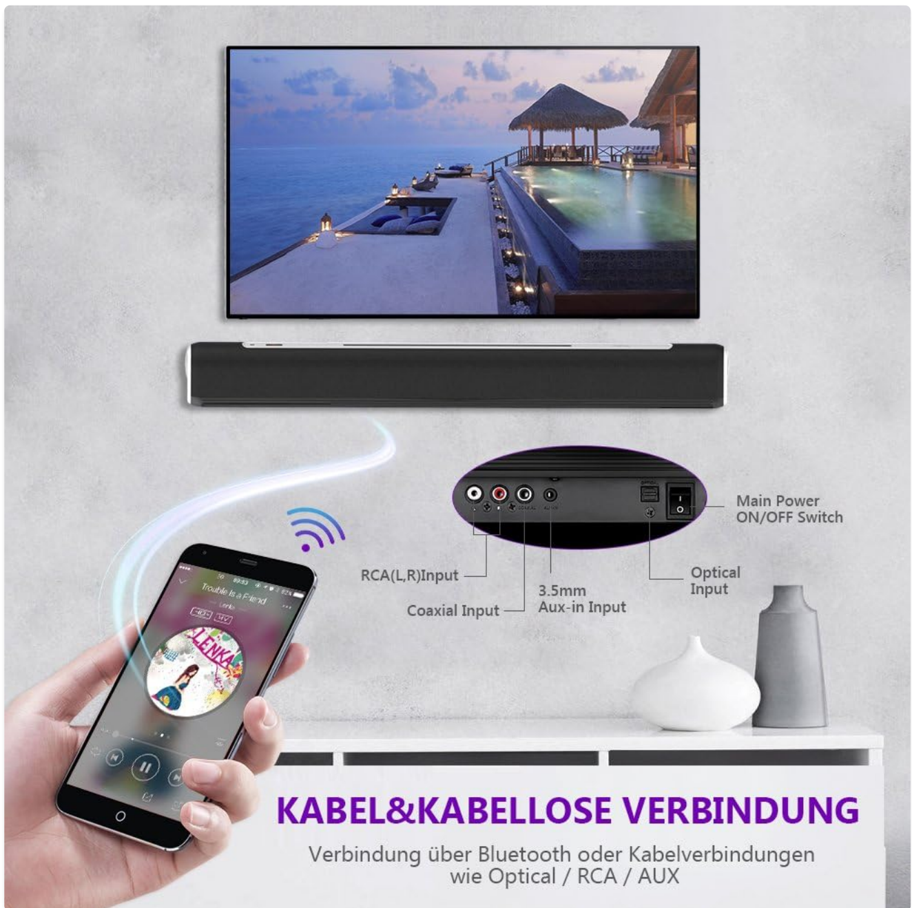
Image 3.1: Rear view of the soundbar showing the Main Power ON/OFF Switch, RCA (L,R) Input, Coaxial Input, 3.5mm Aux-in Input, and Optical Input.