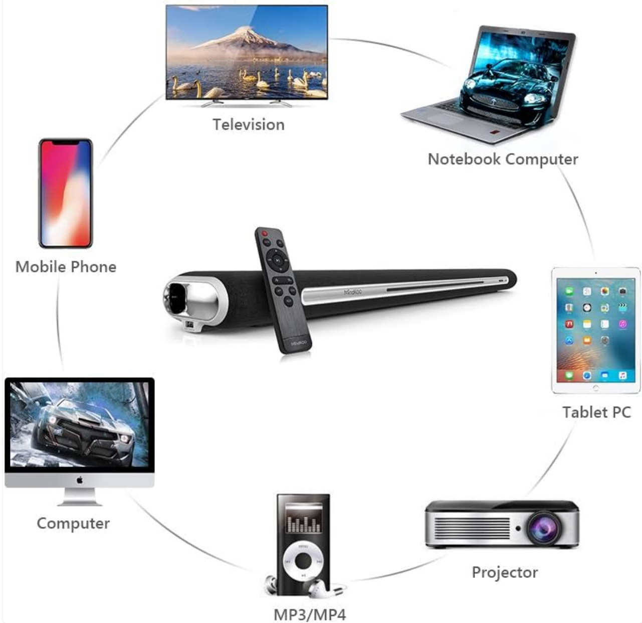
Image 8.2: The soundbar offers broad compatibility with devices such as televisions, notebook computers, mobile phones, tablet PCs, desktop computers, MP3/MP4 players, and projectors.

TV, Computer, MP3, MP4, Notebooks, Tablets, Smartphones, Games consoles