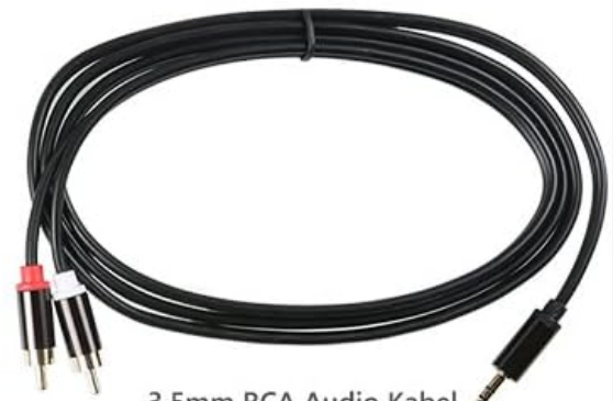
3.5mm RCA Audio Kabel