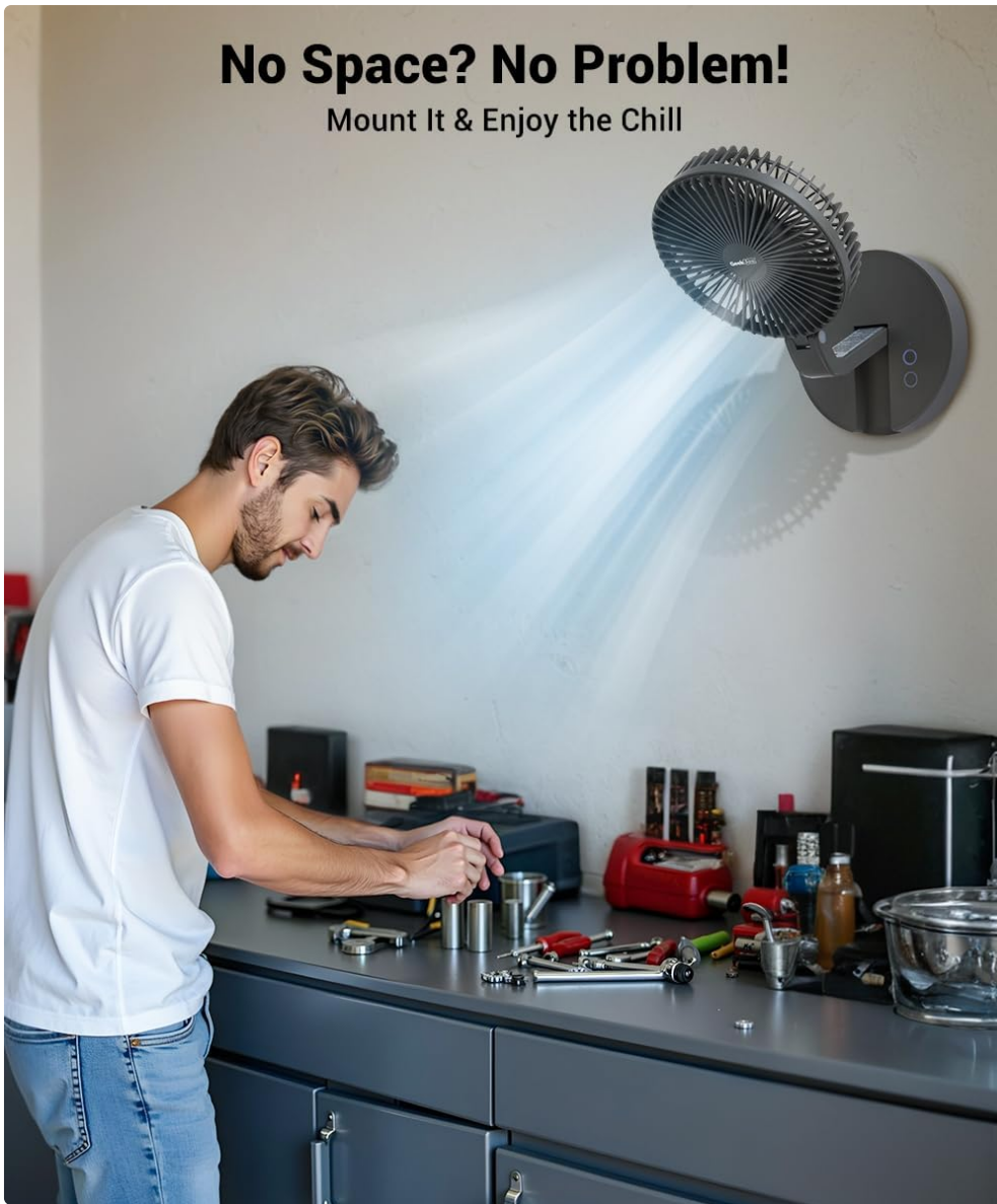
Image 4.1: The fan demonstrated in a wall-mounted configuration, showcasing its versatility for space-saving placement in areas like workshops or kitchens.