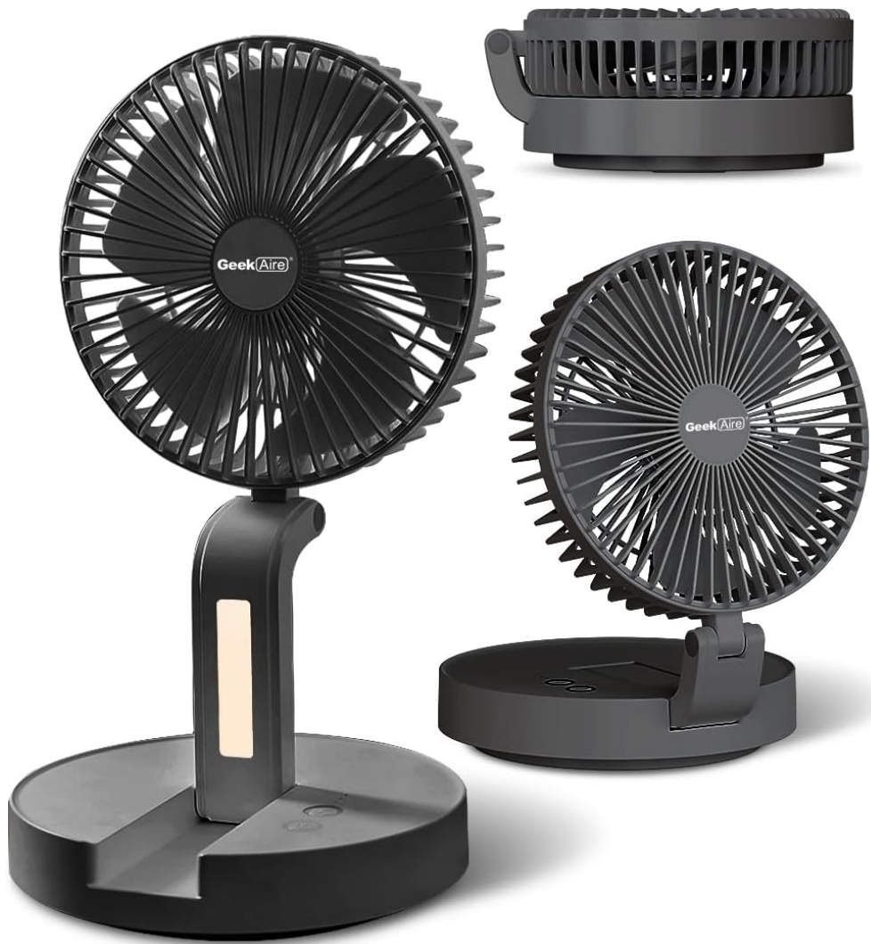
Image 1.1: The Geek Aire Personal Cooling Fan shown in its standing and folded configurations, highlighting its compact and versatile design.