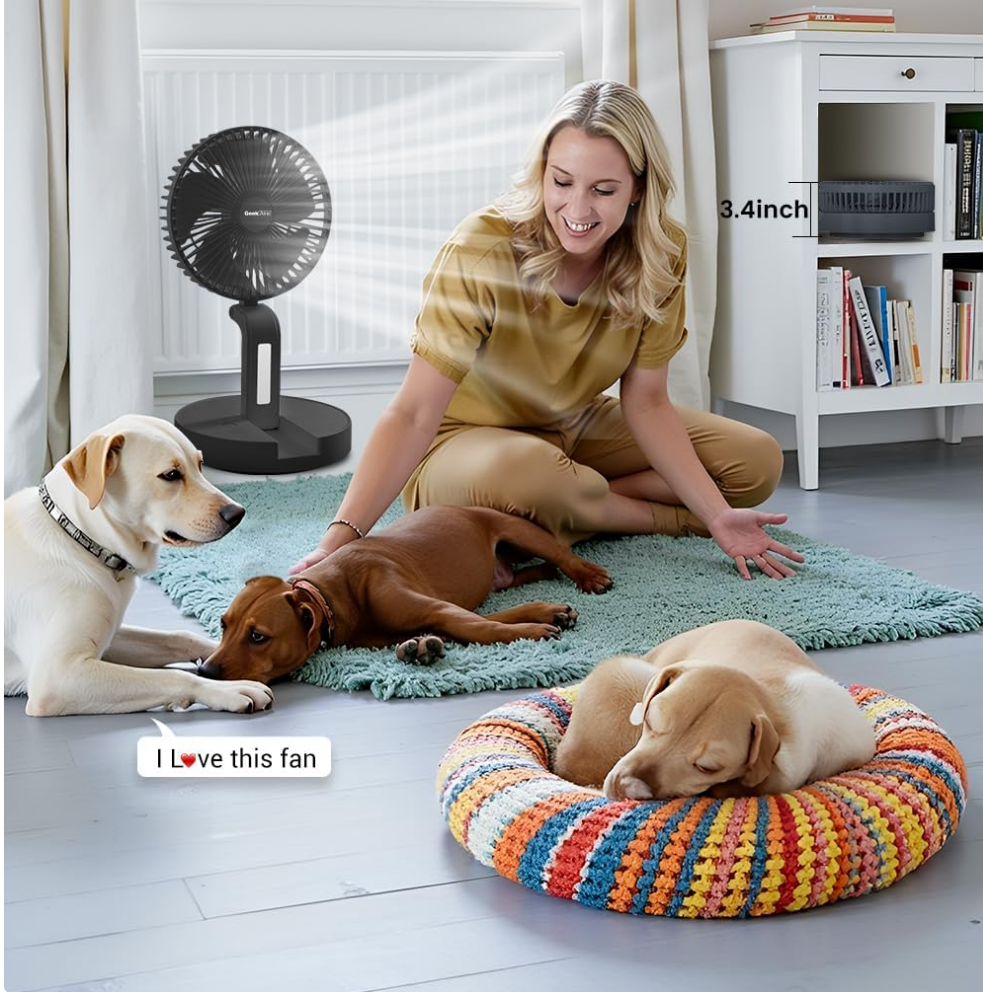
Image 3.1: The fan positioned in a living room, demonstrating its compact size and ability to provide cooling in various indoor spaces.

Equipped with DC motor for enhanced energy efficiency