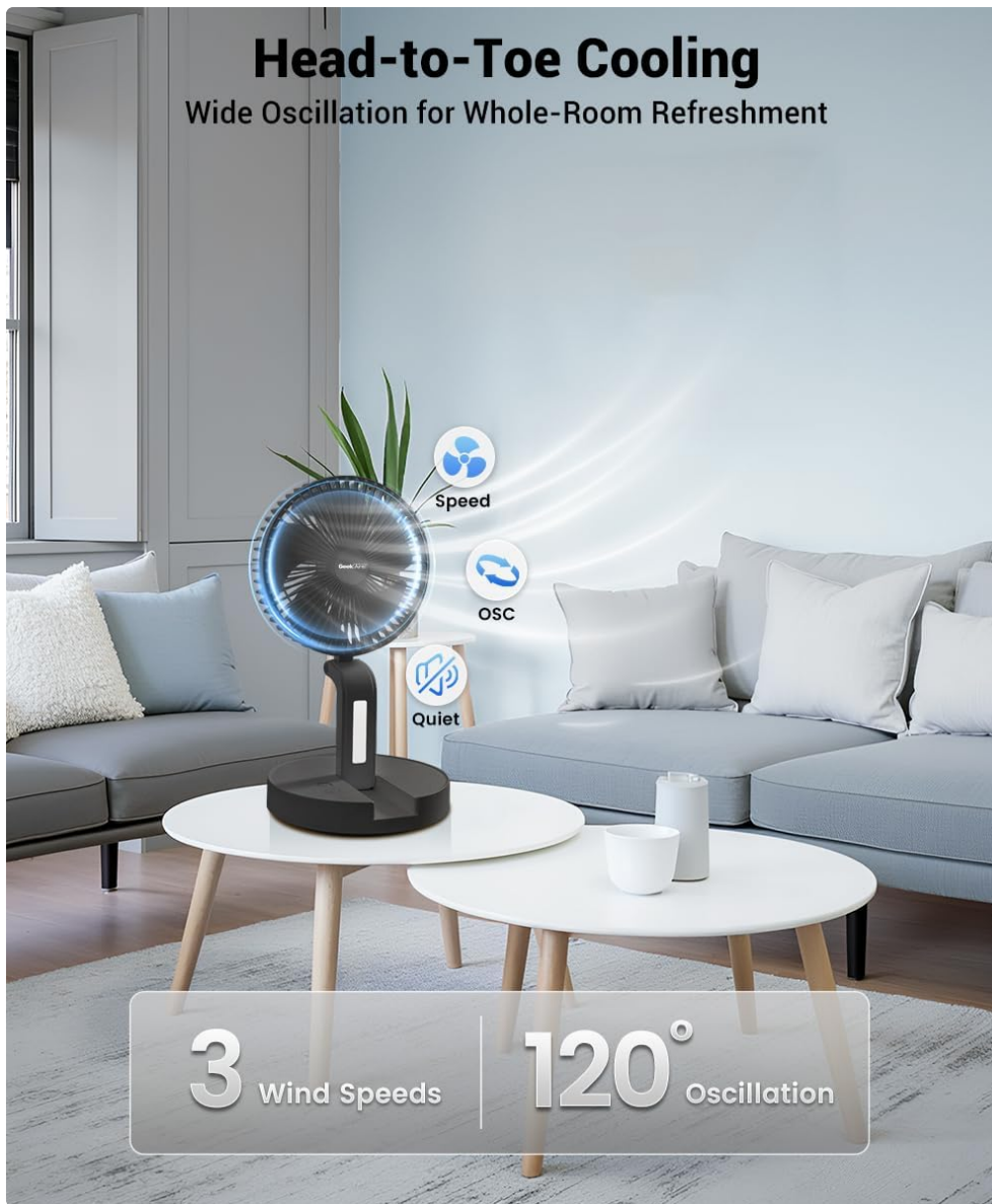
Image 5.1: The fan displaying visual indicators for its three wind speeds, 120-degree oscillation, and quiet operation, illustrating key functional aspects.