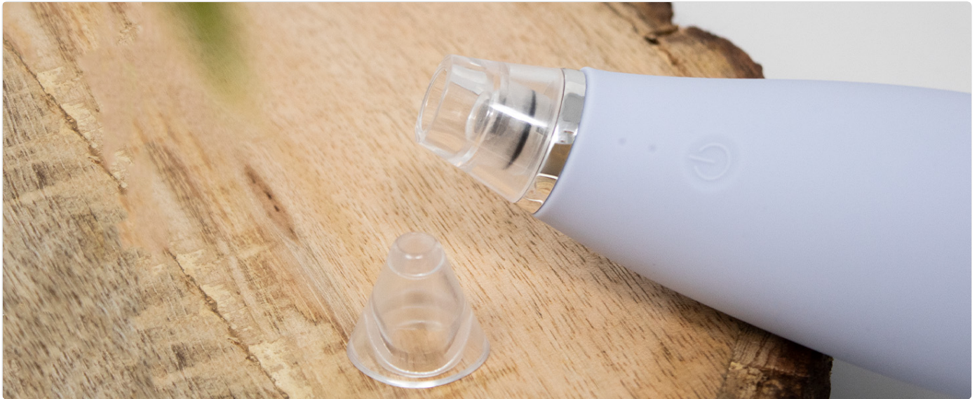
Image: A close-up view of the various diamond and blackhead removal tips included with the device.