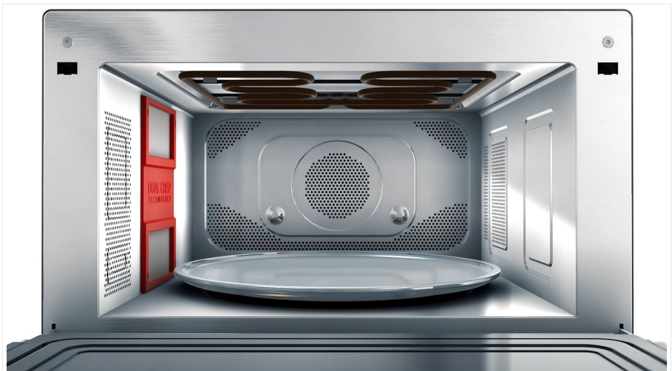
Image: Interior of the microwave, highlighting the spacious cavity and the turntable.

The 33-liter interior capacity accommodates a 36 cm turntable, ensuring even cooking. The oven features a grill element and advanced technologies like Dual Crisp and Dual Power for enhanced cooking performance.