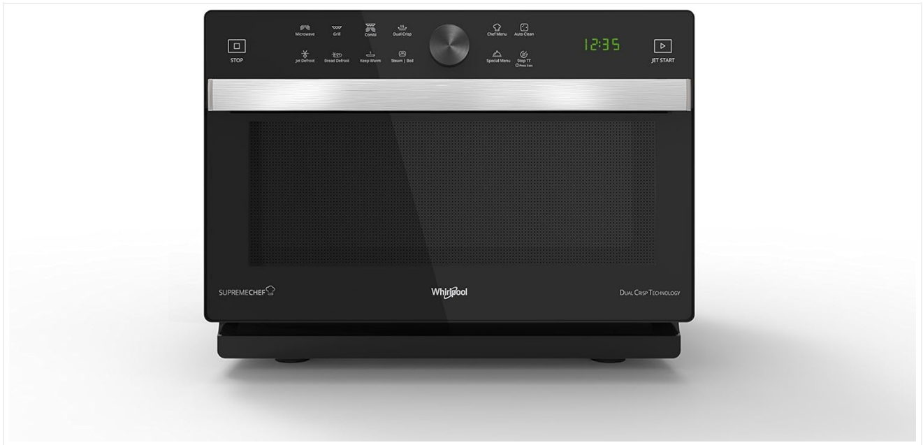
Image: Close-up of the control panel, showing the LED display and touch-sensitive buttons for functions like Microwave, Grill, Combi, Dual Crisp, Jet Defrost, Steam & Boil, Chef Menu, and Auto Clean.

The appliance is equipped with both rotary and tactile controls, along with an integrated LED display for clear visibility of settings and cooking time.