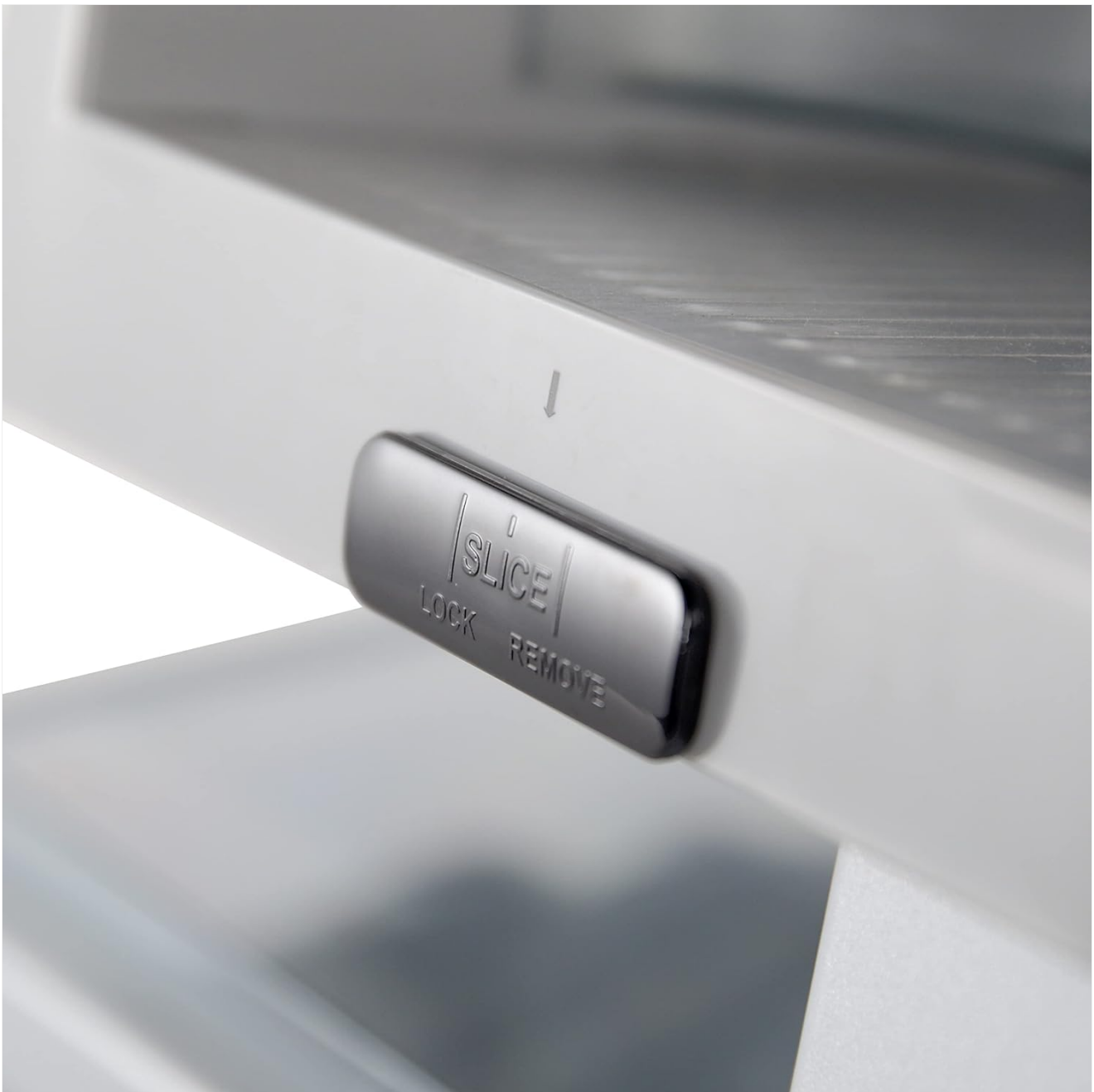
Figure 5: The control button for engaging the slice, lock, or remove positions of the food carriage.