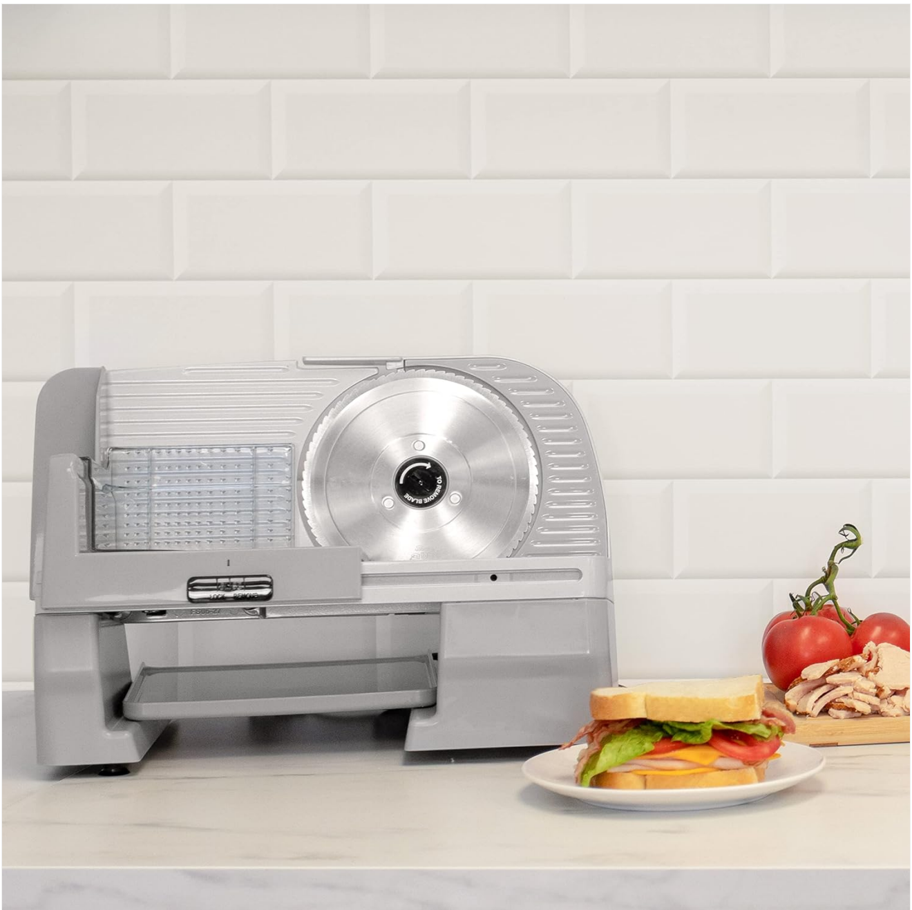
Figure 6: The slicer in operation, demonstrating its use for preparing sandwich ingredients.