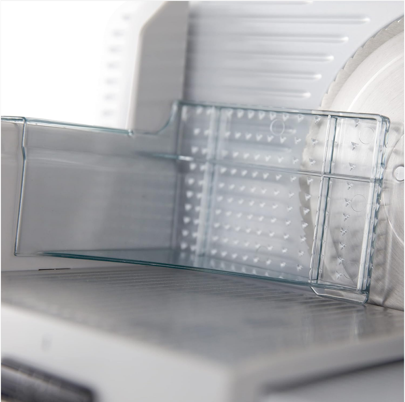
Figure 4: The transparent food carriage, designed to hold food securely for consistent slicing.