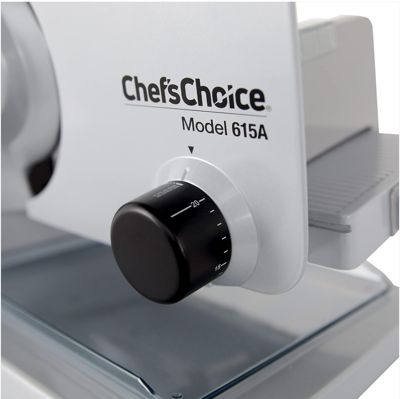
Figure 3: Detail of the thickness control knob, allowing precise adjustment of slice thickness.