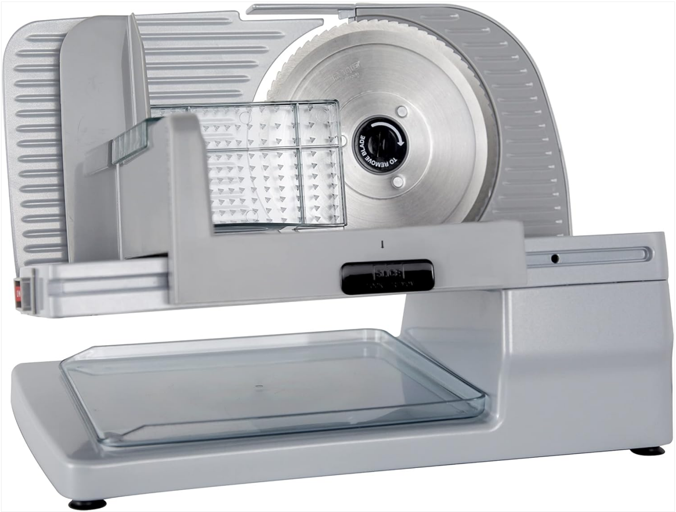
Figure 1: Front view of the Chef'sChoice 615A Electric Meat Slicer, showing the blade, food carriage, and serving tray.